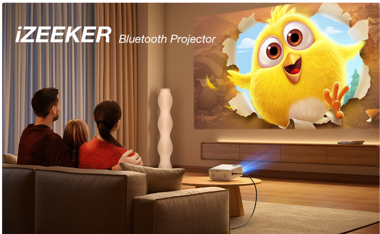
Figure 5.1: Enjoying a home cinema experience with the iZEEKER Bluetooth Projector.

The projector features a 75% zoom function. Access this setting in the projector's menu to adjust the screen size without physically moving the projector.