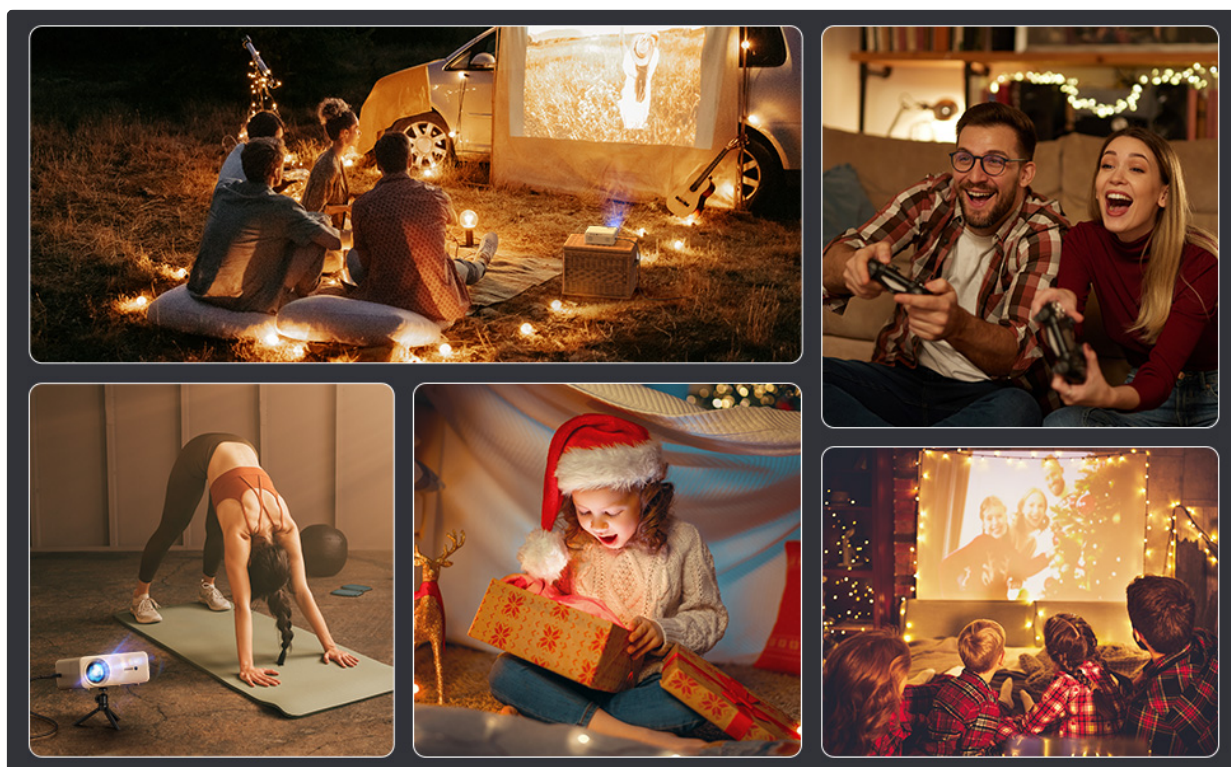
Figure 5.2: Versatile usage scenarios for the iZEEKER projector, from outdoor entertainment to indoor activities.