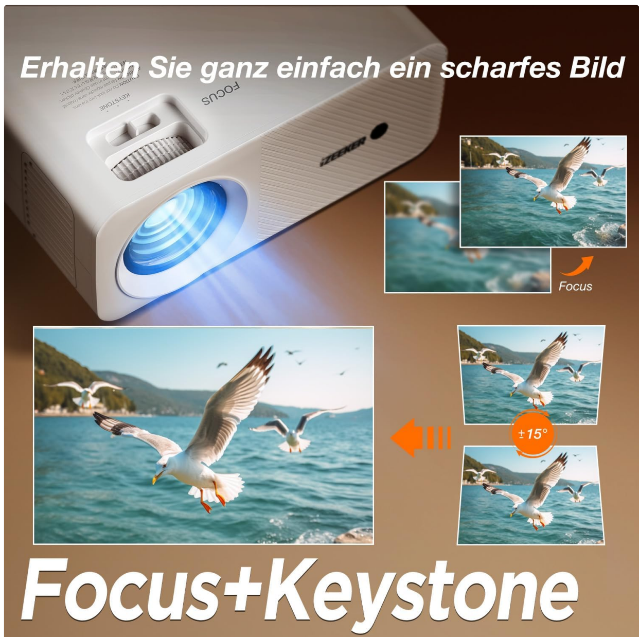
Figure 4.2: Adjusting focus and keystone for a clear and rectangular image.