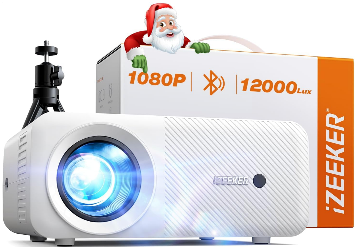
Figure 2.1: The iZEEKER Projector and included accessories, such as the customized tripod.