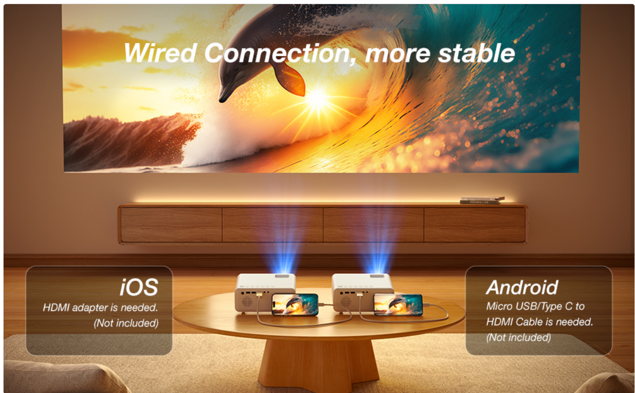
Figure 4.4: Stable wired connections for various devices, including smartphones.