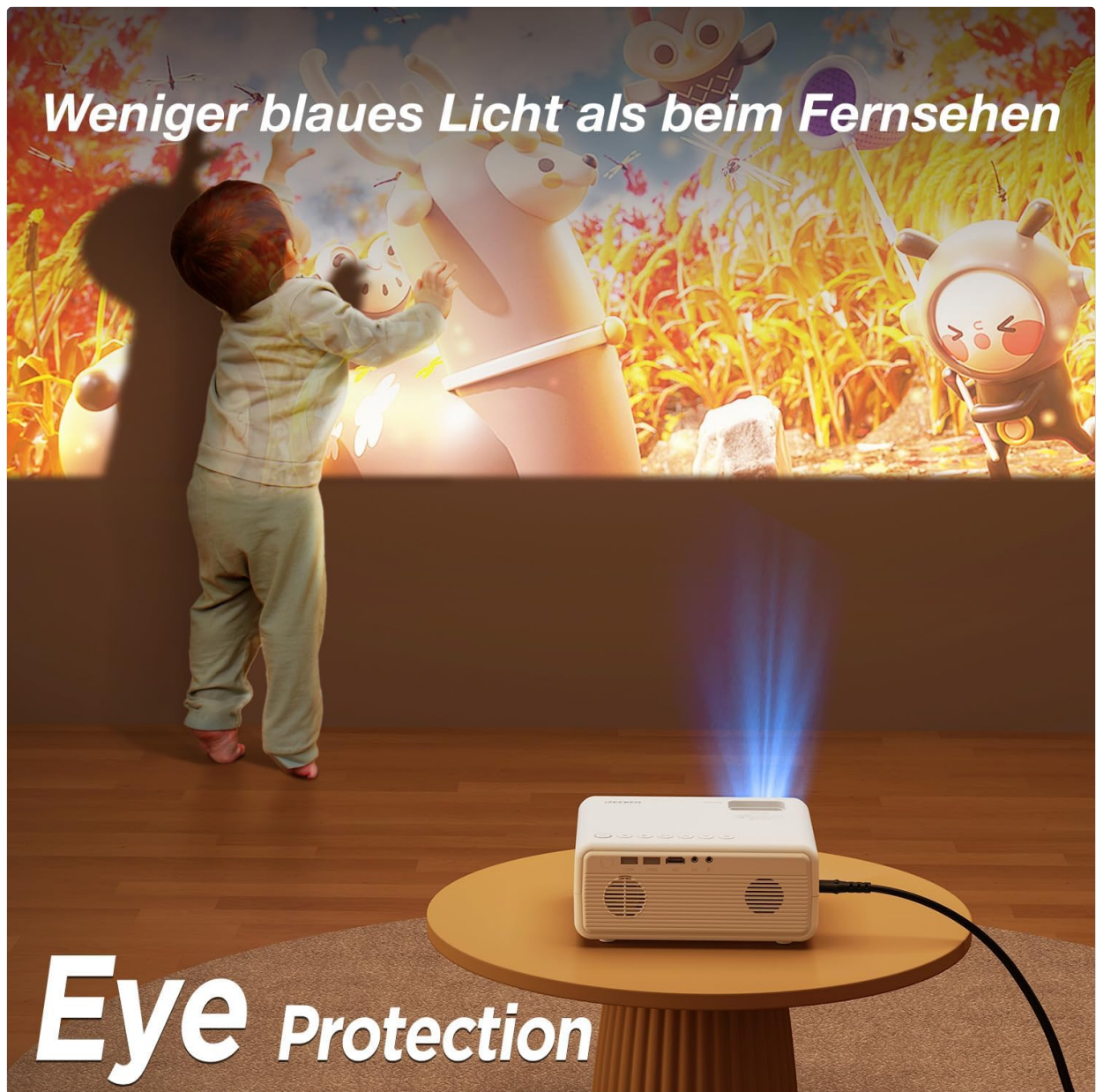
Figure 1.1: The iZEEKER projector's diffuse reflection technology helps reduce blue light and eye strain, making it suitable for family viewing.