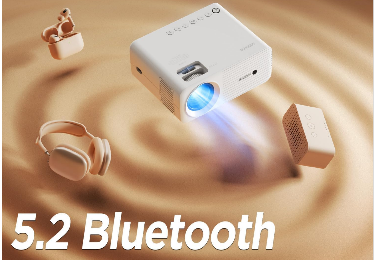
Figure 3.2: The projector's Bluetooth 5.2 capability allows connection to various external audio devices for enhanced sound.