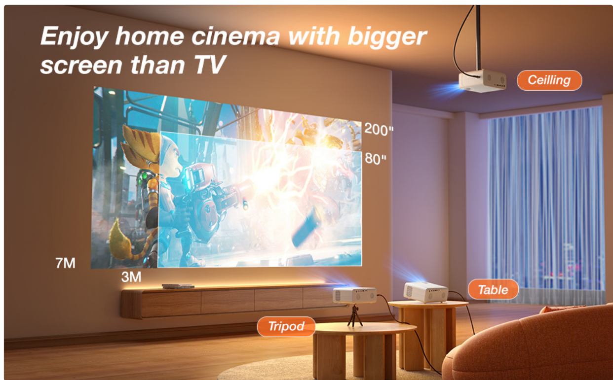
Figure 4.1: Flexible placement options for your iZEEKER projector, including tripod, table, and ceiling mounting.