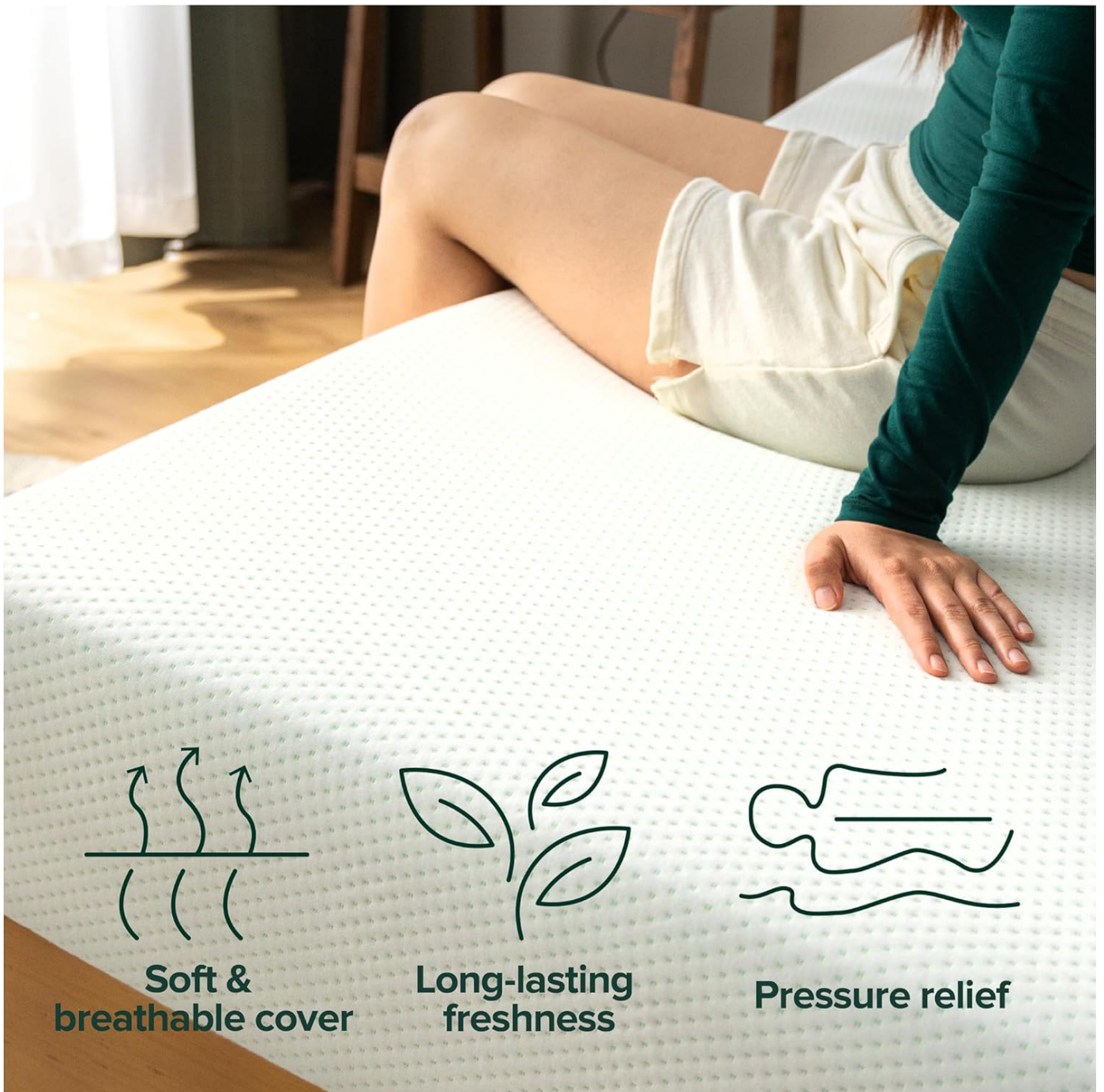
Image: A graphic demonstrating how the mattress provides patented custom contour support and zoned pressure relief.