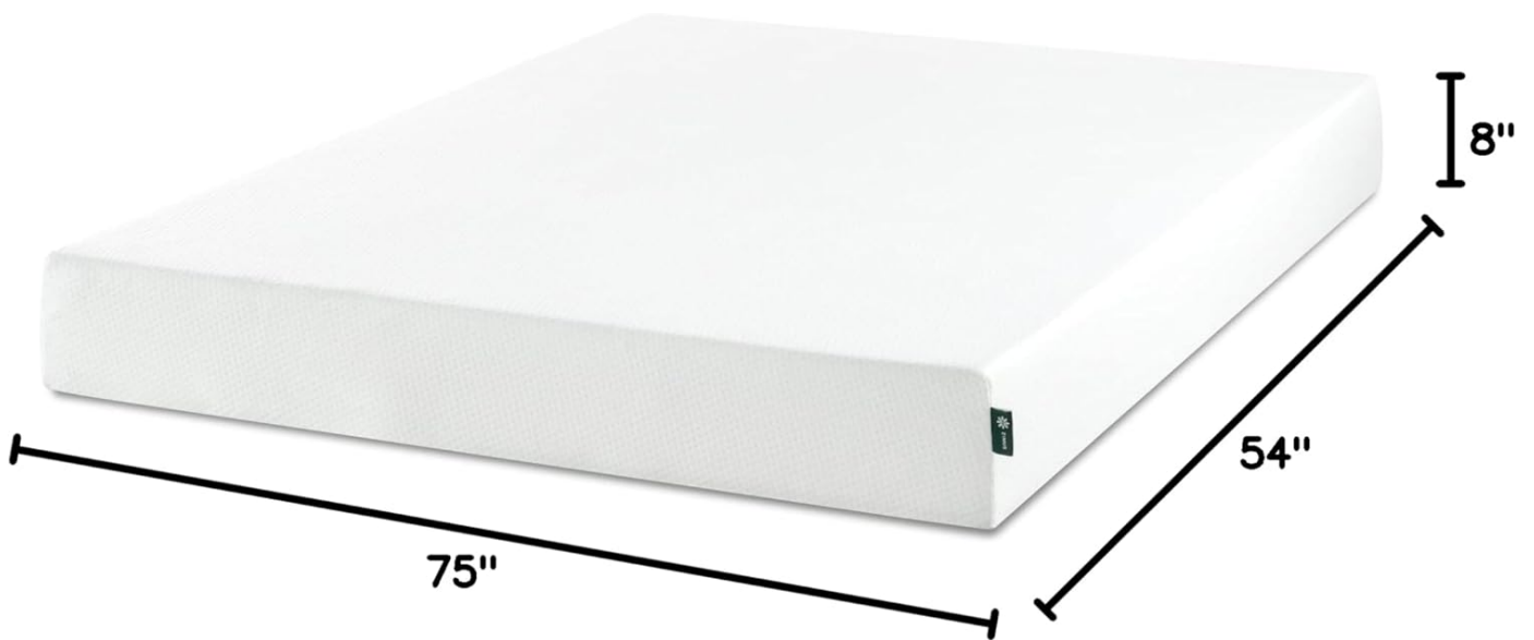
Image: Visual representation of the mattress dimensions (75\"L x 54\"W x 8\"Th).