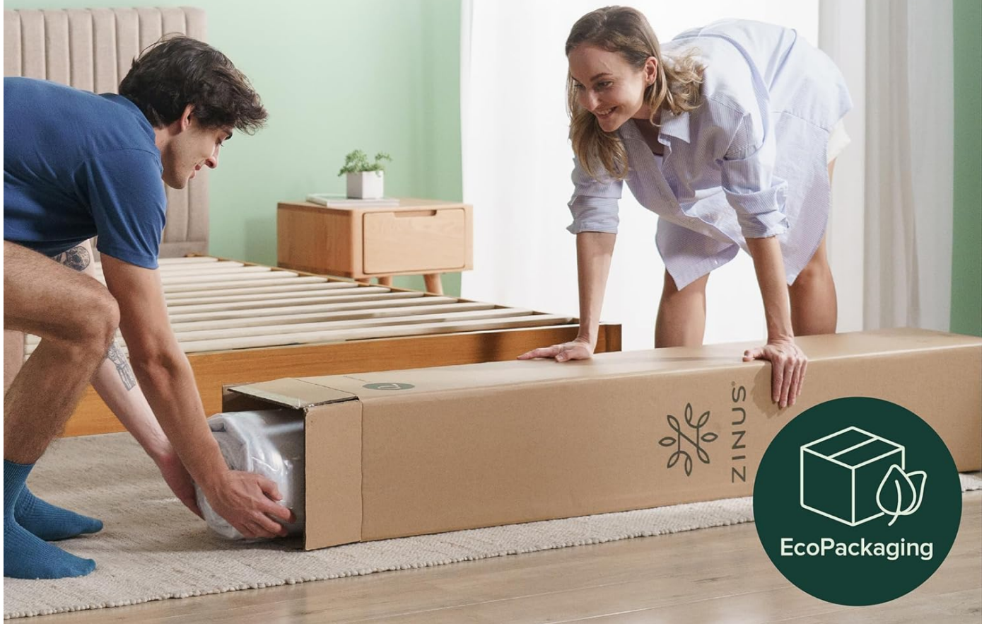
Image: Two individuals carefully removing the compressed mattress from its eco-friendly packaging.

Shipped in a smaller box for a reduced carbon footprint