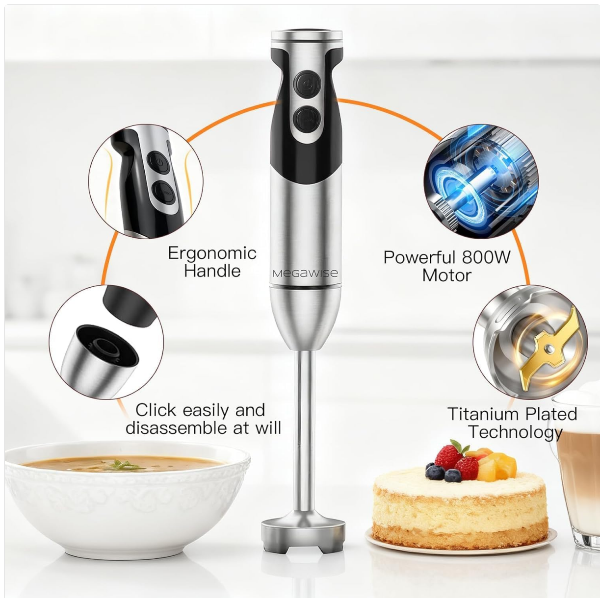
Image: Visual guide demonstrating the assembly of the blending shaft and whisk attachment to the main motor unit.