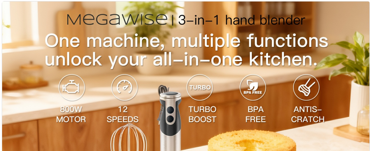
Image: An overview of the Megawise Hand Blender and its accessories, including the blending shaft, whisk, and milk frother, displayed with various food preparations.