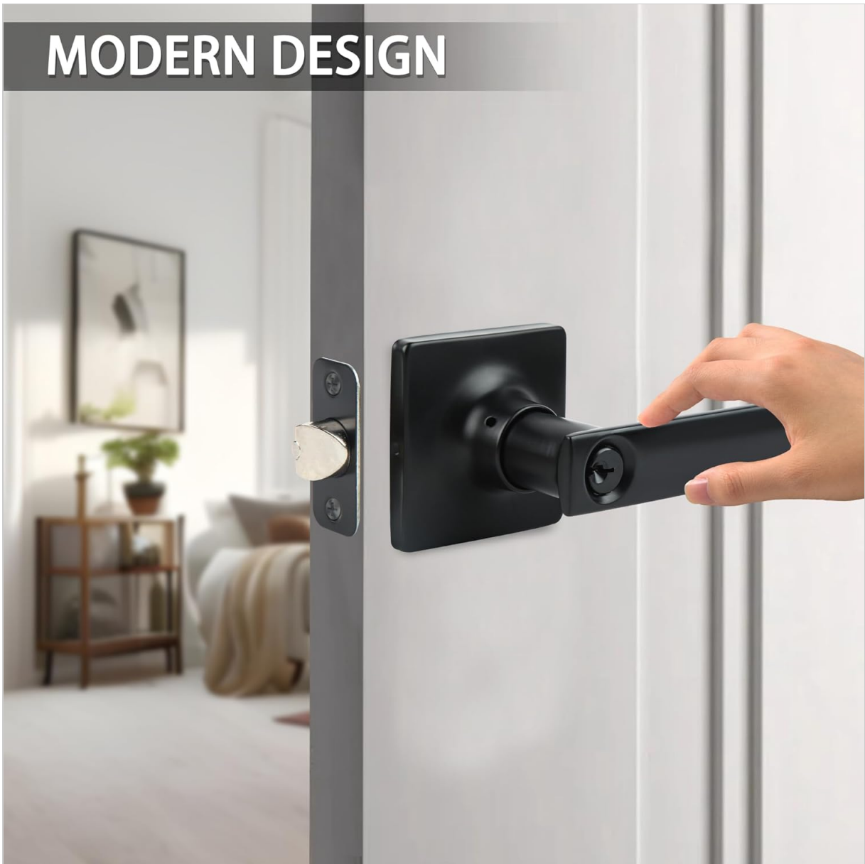
Image: A hand inserting a key into the exterior door handle to engage the locking mechanism.