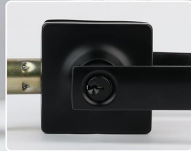
Abrasion Resistant Tough Finish

Image: A detailed view of the internal components of the JESSTTI door handle lock, highlighting its heavy-duty inner structure and sturdy construction for durability.