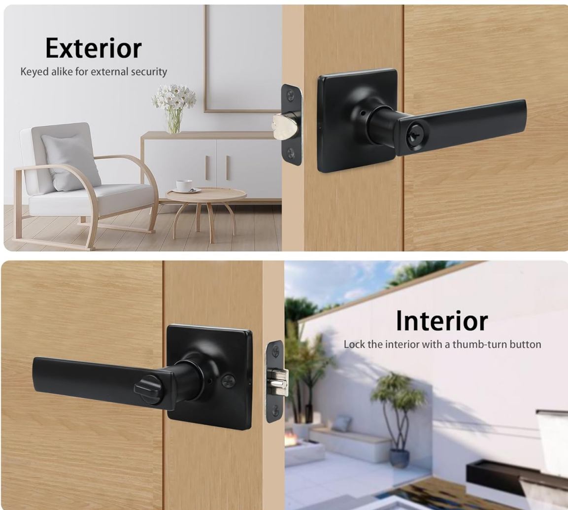
Image: A split view illustrating the exterior handle with its keyhole and the interior handle featuring a thumb-turn button for convenient locking and unlocking.