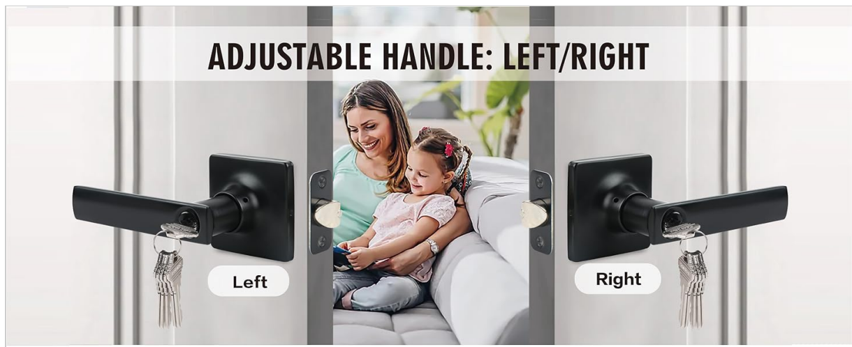
Image: Demonstrates the reversible design of the handle, allowing for installation on both left-handed and right-handed doors.