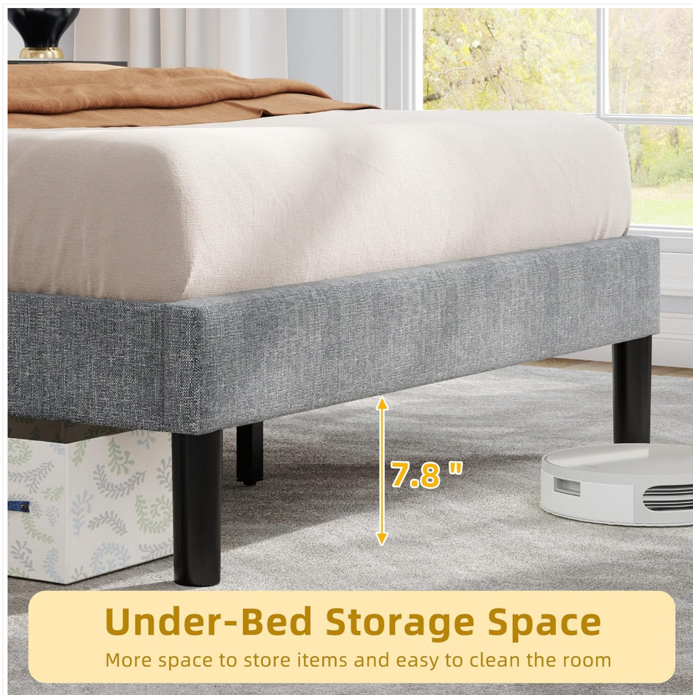
Image: The under-bed storage area, measuring 7.8 inches, shown with storage boxes and a robotic vacuum cleaner, illustrating its practical use.