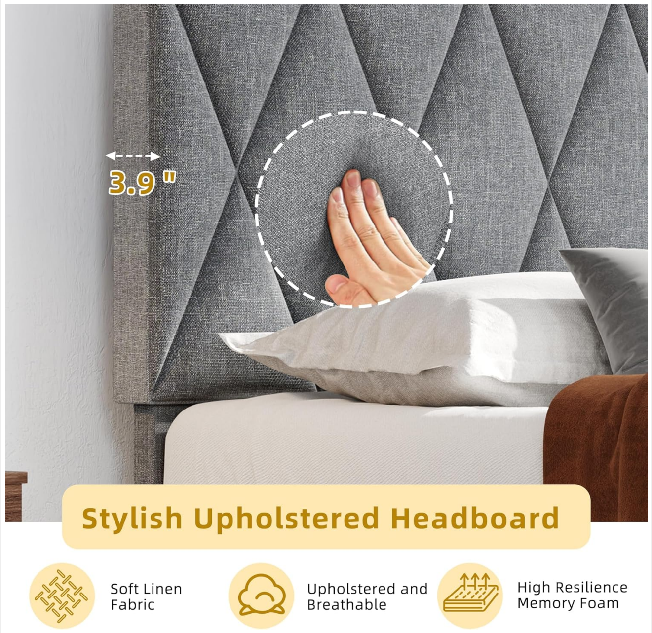
Image: Detail of the upholstered headboard, showing the soft linen fabric and high resilience memory foam for comfort and support.

headboard to your preferred height to fit your mattress (recommended thickness 8-12 inches).