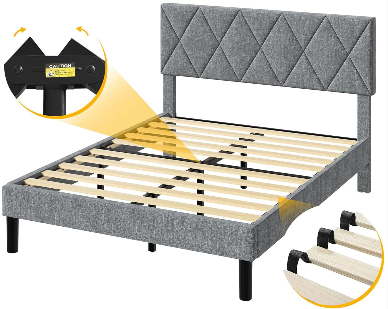
Image: A visual guide to the easy assembly of the bed frame, illustrating the pre-installed folding main frame and the Velcro design for quick slat installation.

Easily unfold the pre-installed main frame to save time and effort. Velcro design that enables quick installation and prevents friction and movement.