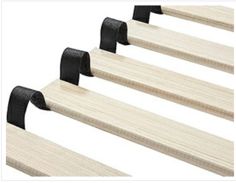
Image: Close-up view of the silent foam strip applied to the metal rail, designed to minimize noise.

7. Final Check: Ensure all connections are tight and the bed frame is stable.