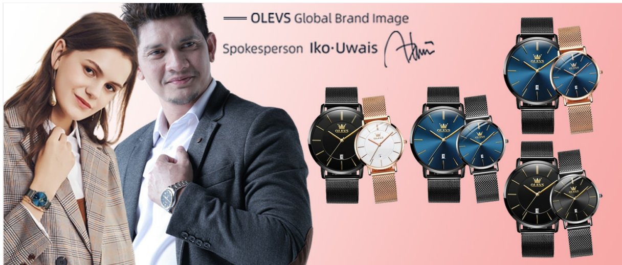
Image: OLEVS G5869 Couple Watches displayed on wrists.

Thank you for choosing the OLEVS G5869 Couple Pair Quartz Watches. This manual provides essential information for the proper setup, operation, maintenance, and troubleshooting of your new watches. Please read these instructions carefully to ensure optimal performance and longevity of your timepiece.