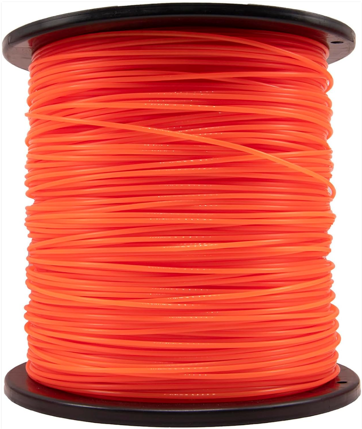
Image 1.1: A large spool of orange KAKO 0.065 inch round trimmer line.