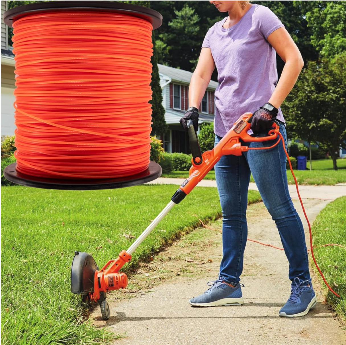
Image 3.1: A person demonstrating the use of a string trimmer with KAKO trimmer line to edge a lawn.