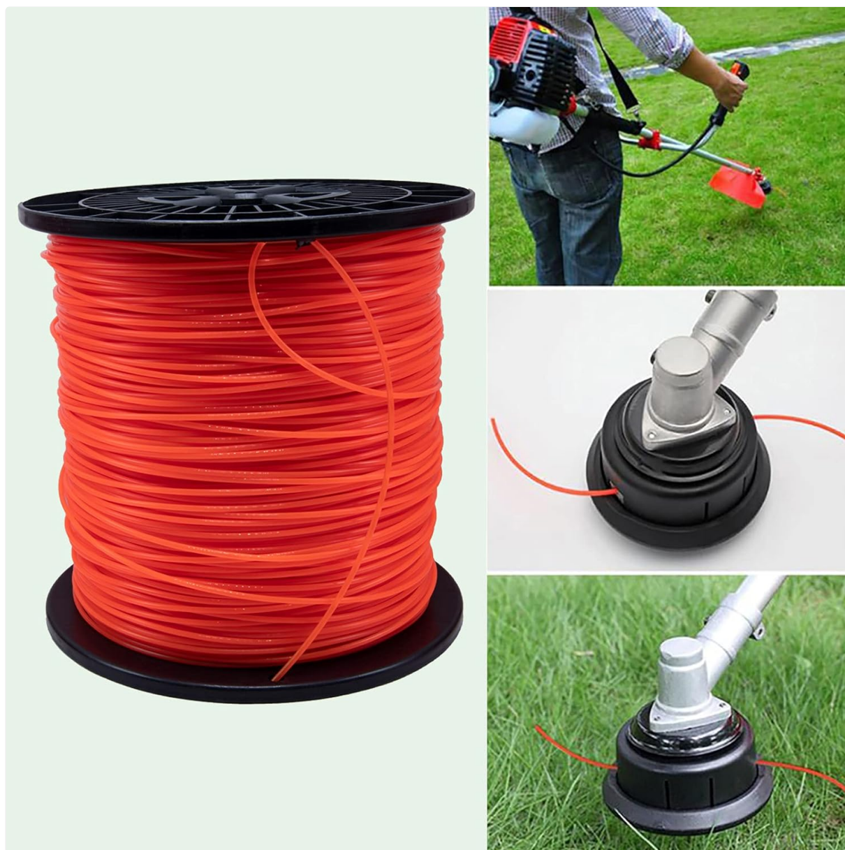
Image 2.1: A KAKO trimmer line spool alongside close-up views of a trimmer head with the line installed.