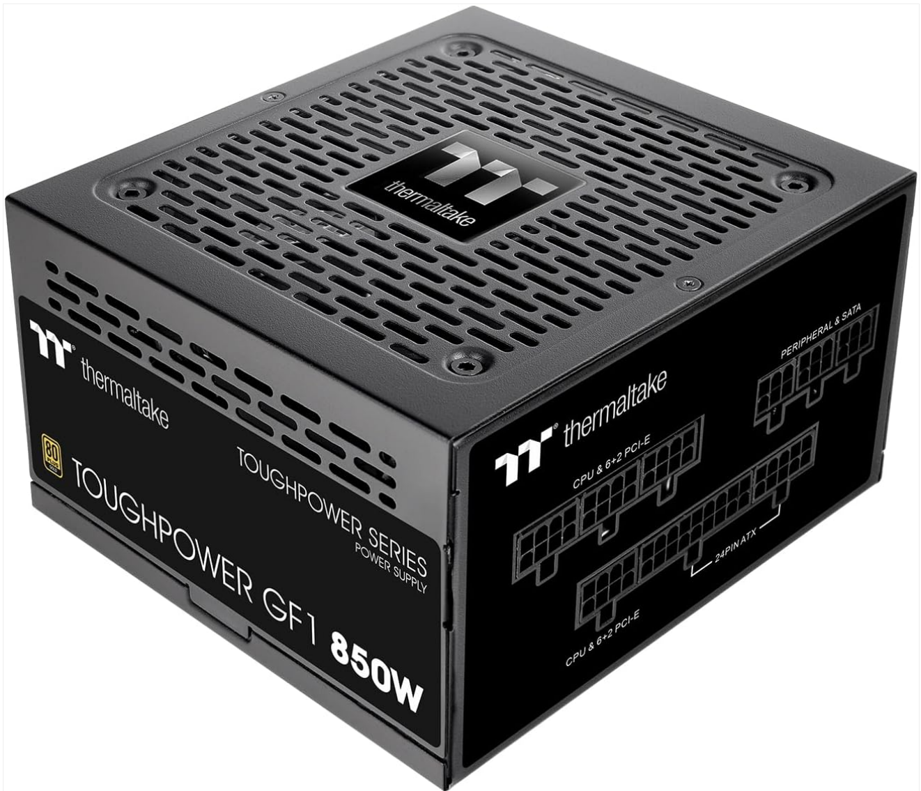
Figure 1.1: Thermaltake Toughpower GF1 850W Power Supply, showcasing its modular design and ventilation grilles.