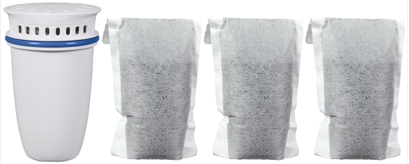
Image: The reusable filter shell and three new filter refills.