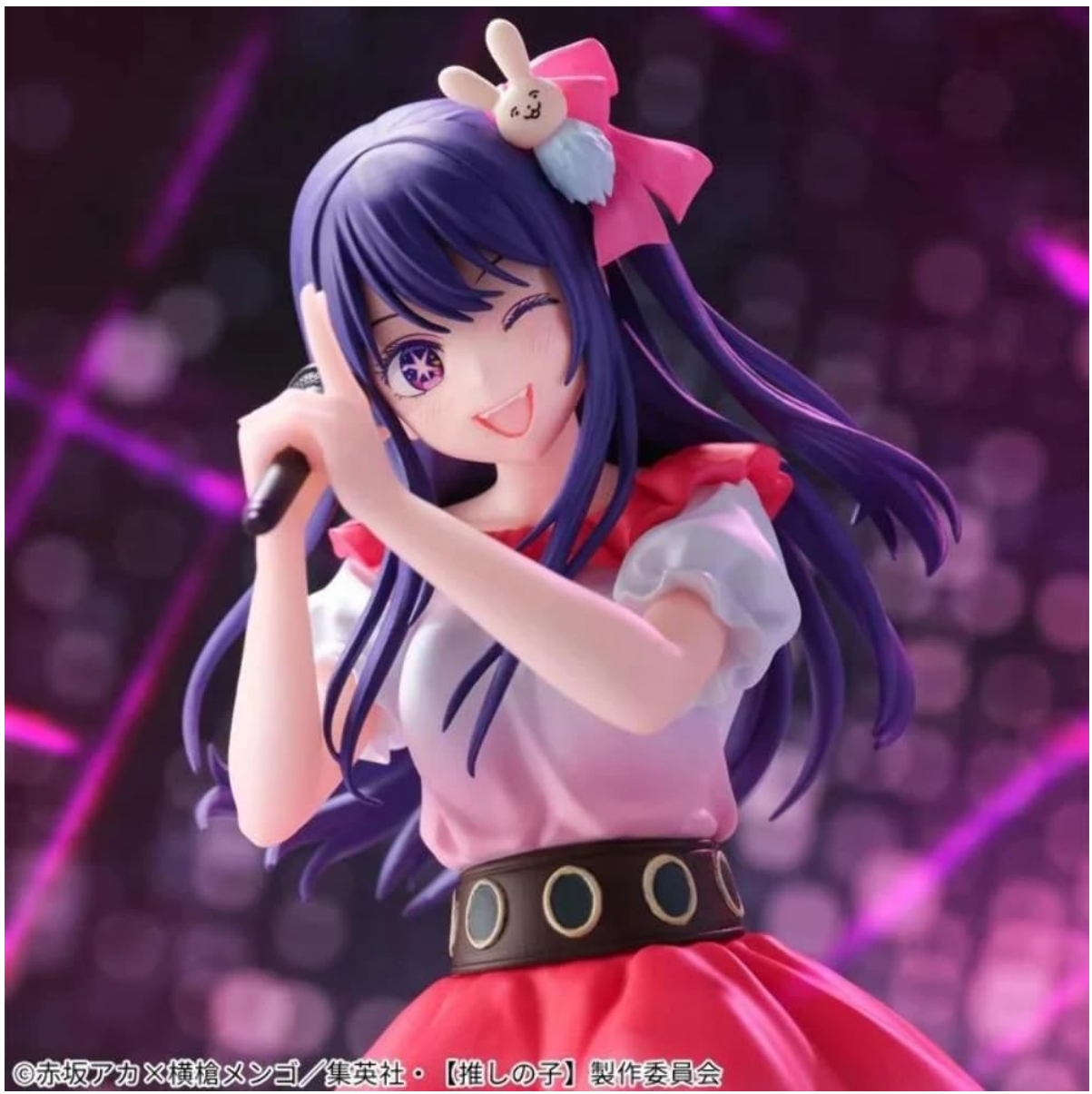
Image 1.1: Front view of the Banpresto Oshi no Ko Ai figure on its display stand.