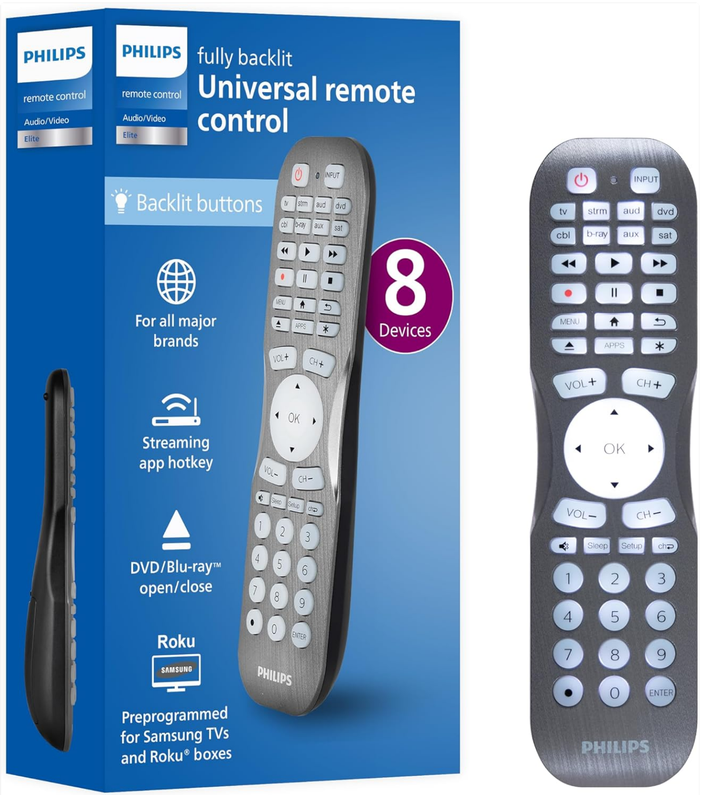
Image: The Philips SRP8121G/27 8-Device Universal Remote Control, shown alongside its retail packaging. The remote features a brushed graphite finish and a clear button layout.