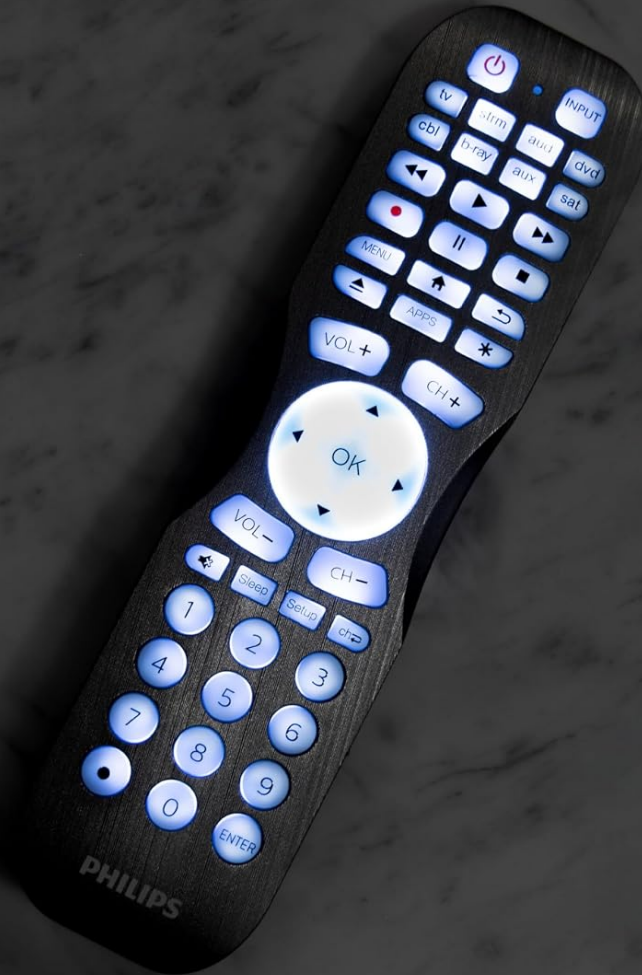
Image: The Philips SRP8121G/27 remote control demonstrating its compatibility with major brands such as Samsung, Vizio, JVC, Sony, Emerson, Element, Hisense, and Westinghouse. It is preprogrammed for Samsung TVs and Roku boxes.