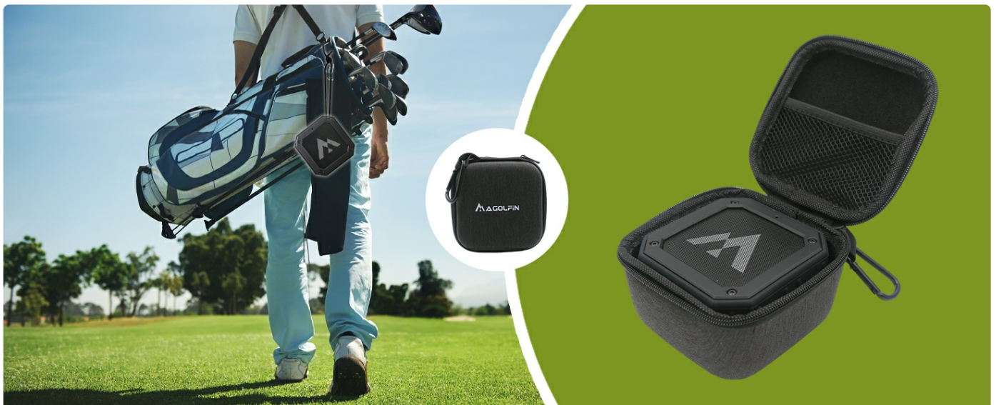
Image showing the MAGOLFIN X10 speaker alongside its protective storage case.