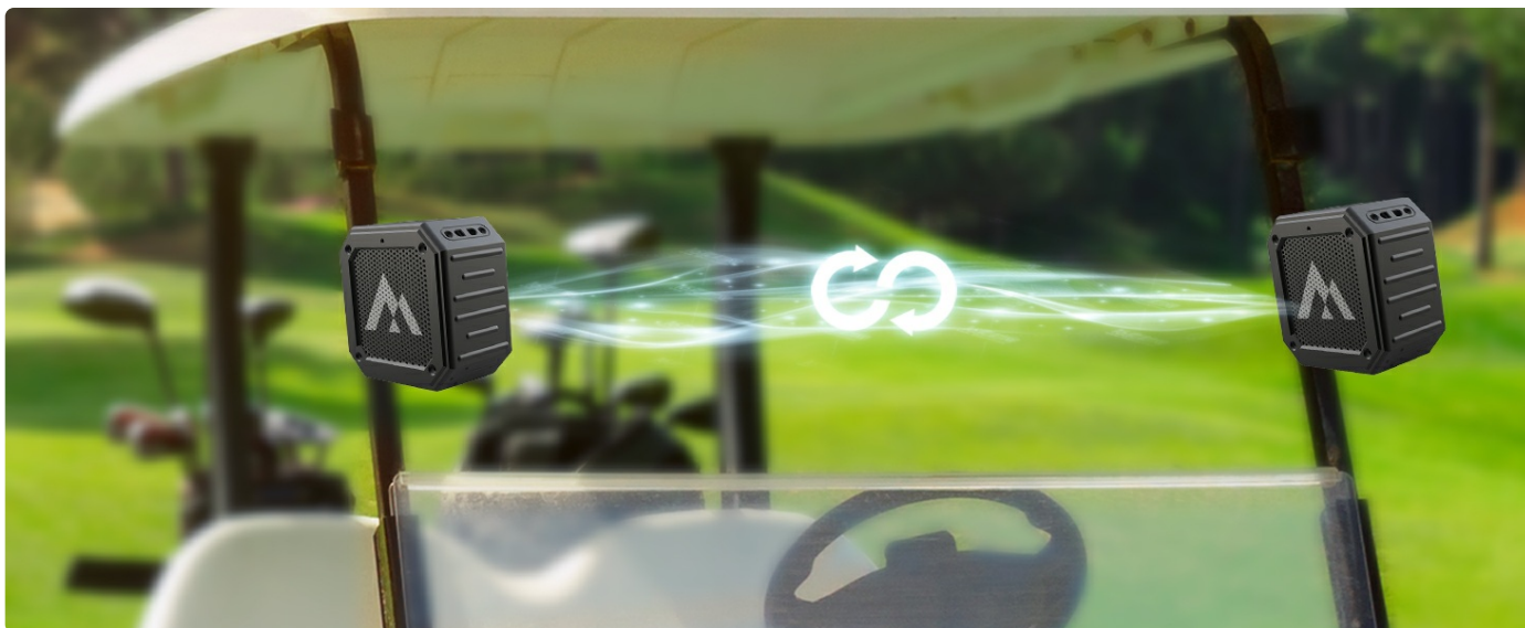
Image illustrating two speakers wirelessly connected for a stereo sound experience.