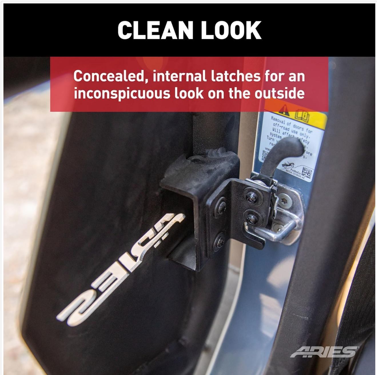
Figure 4: Close-up of the concealed, internal latch mechanism for a clean look.

that the doors do not interfere with the vehicle's side-view mirrors or cause paint scraping during normal operation.