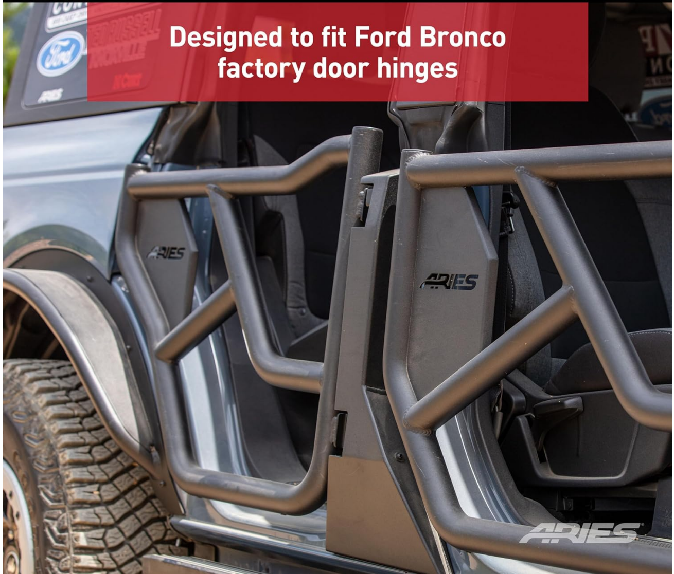
Figure 3: ARIES tube doors are designed for easy installation using existing Ford Bronco factory door hinges.

Designed to fit Ford Bronco factory door hinges