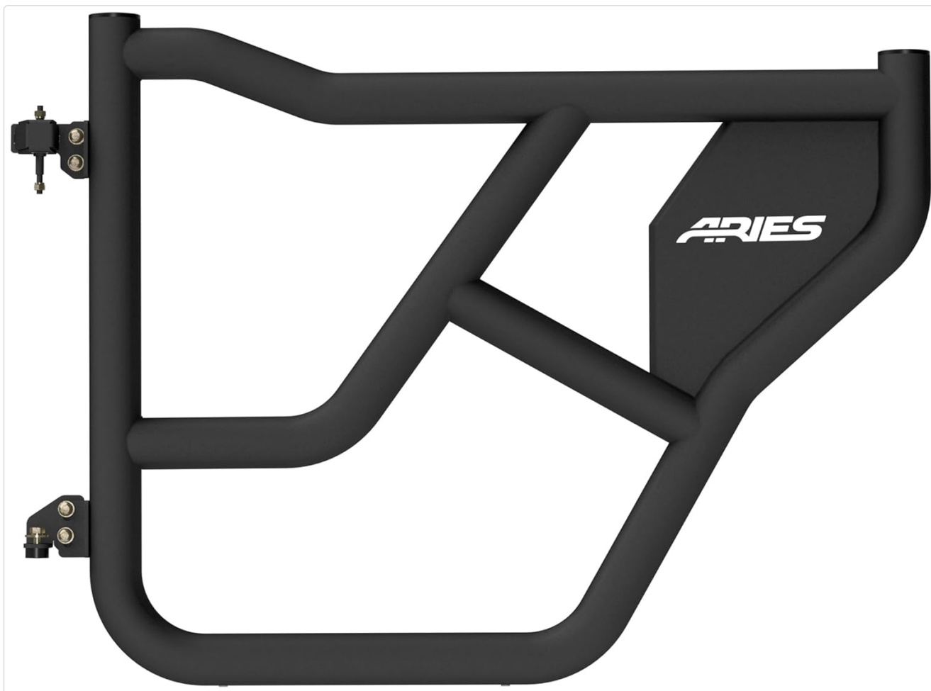
Figure 1: ARIES 2500250 Rear Black Aluminum Tube Door.