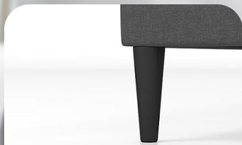
Solid Wood Legs