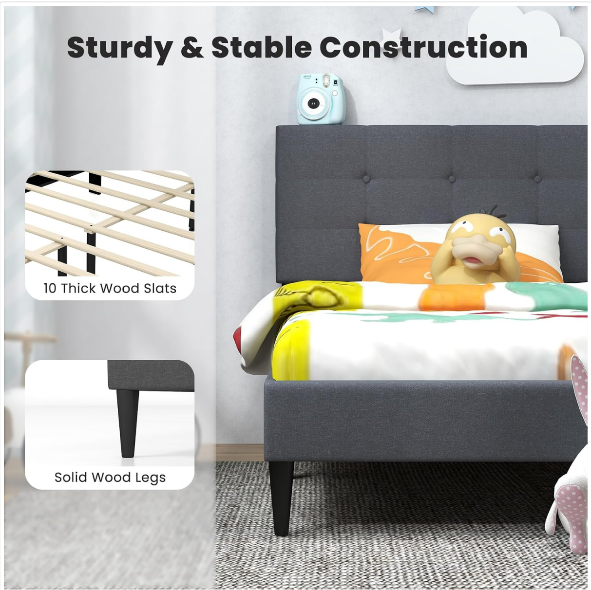
Figure 2: Sturdy and Stable Construction. This image illustrates the 10 thick wood slats and solid wood legs that contribute to the bed frame's robust and stable support.