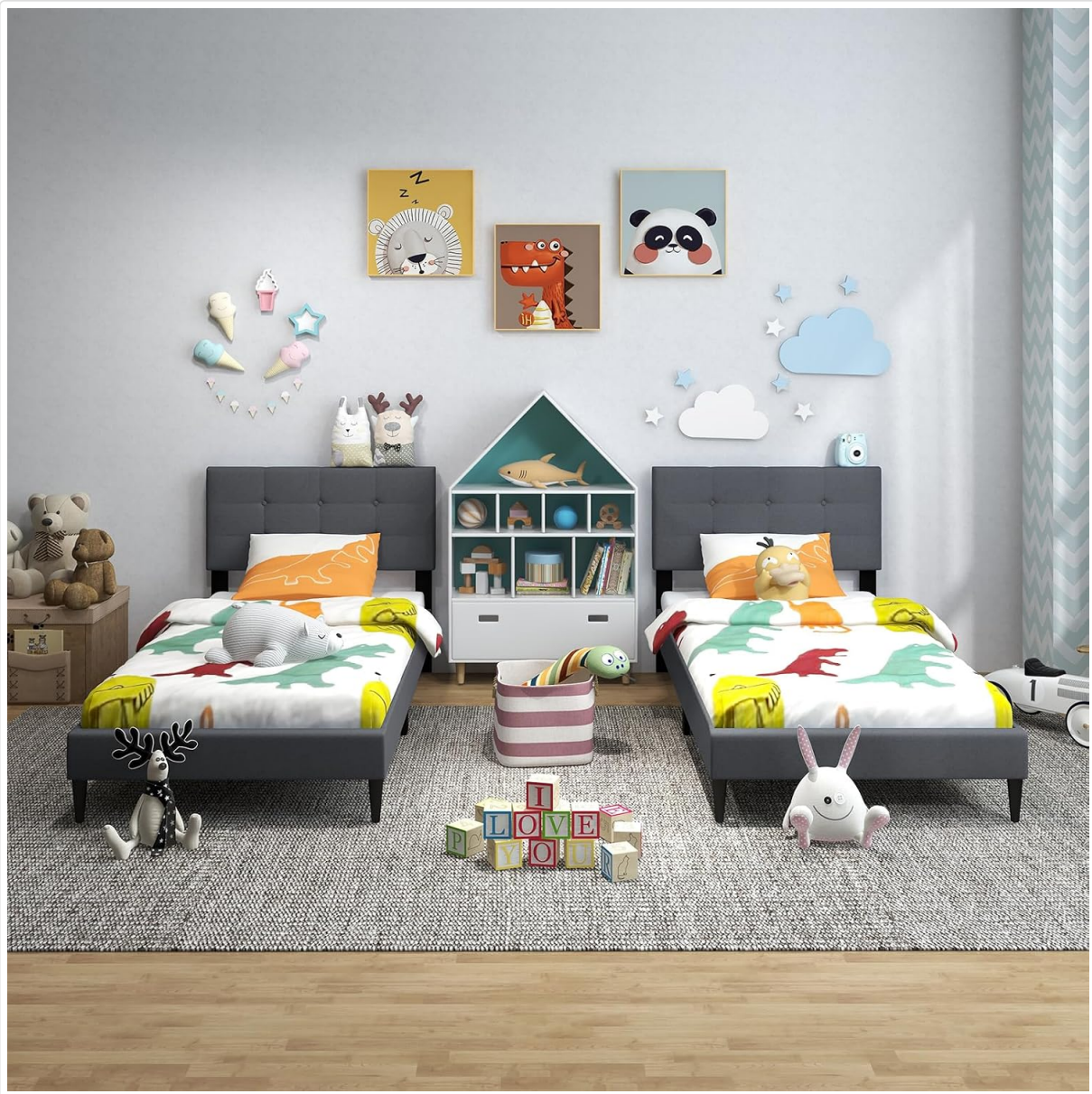
Figure 3: No Box Spring Needed. This image demonstrates the embedded design of the bed frame, which securely holds the mattress in place, eliminating the need for a box spring.