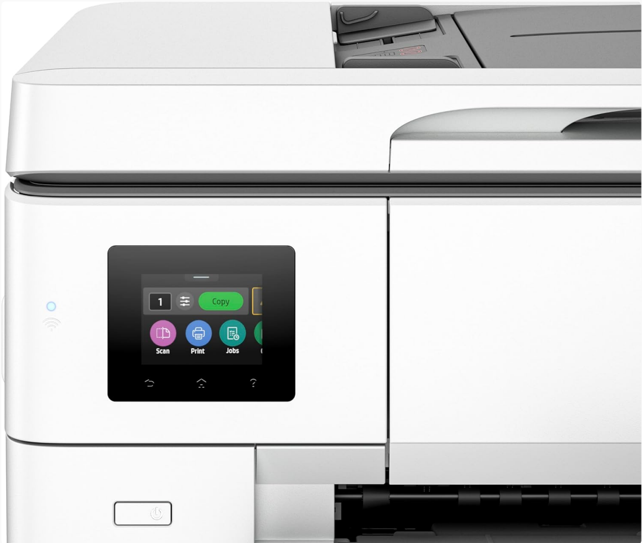
Figure 4.1: Close-up view of the printer's touchscreen display, showing various function icons.

The HP OfficeJet Pro 9720 features an intuitive touchscreen display for easy operation. Tap icons to select functions like Print, Scan, or Copy. Swipe to navigate through menus and settings.