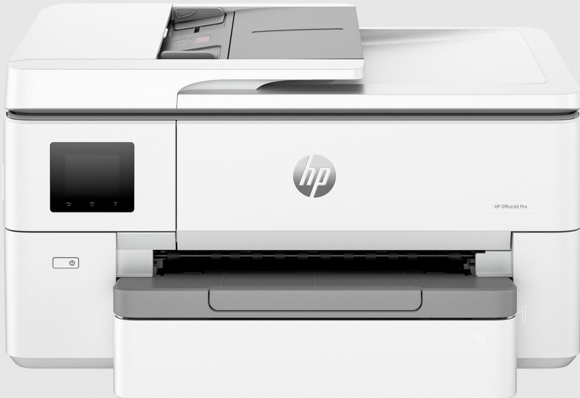
Figure 1.1: Front view of the HP OfficeJet Pro 9720 printer, showing the main body and paper trays.