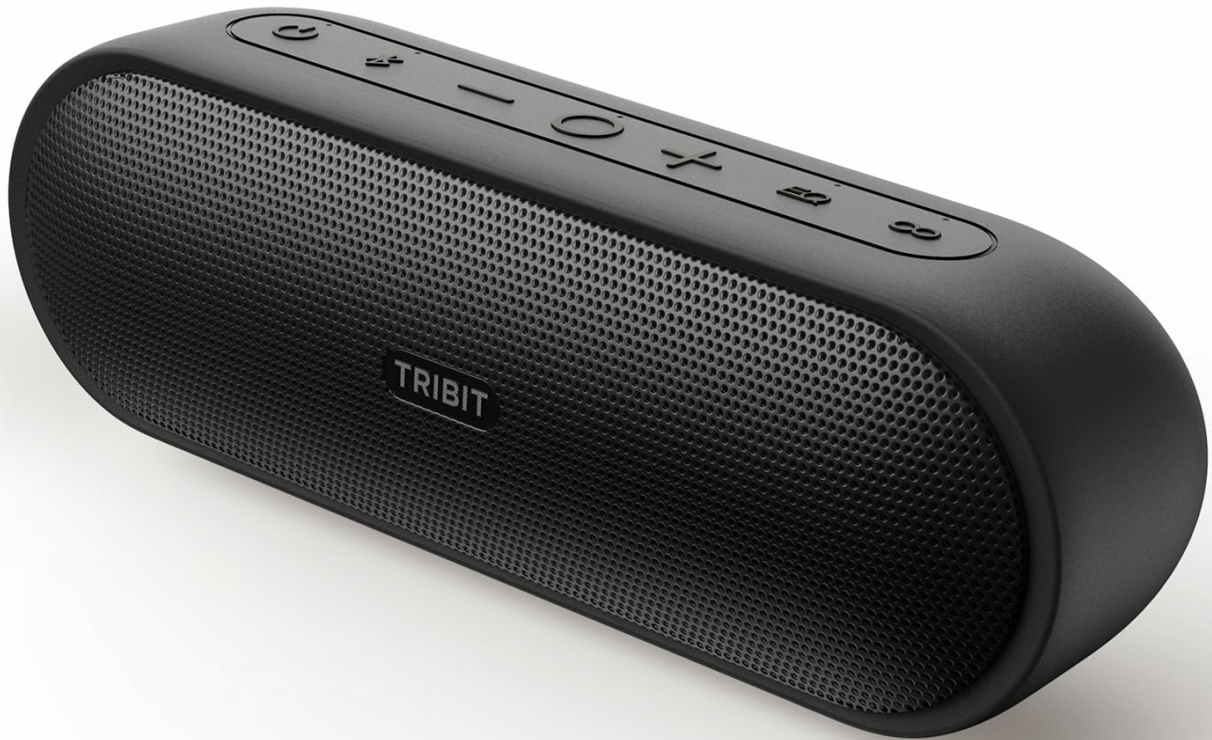
Tribit XSound Plus 2 speaker and included accessories.

Before first use, fully charge the speaker using the provided charging cable. A full charge ensures optimal battery performance.