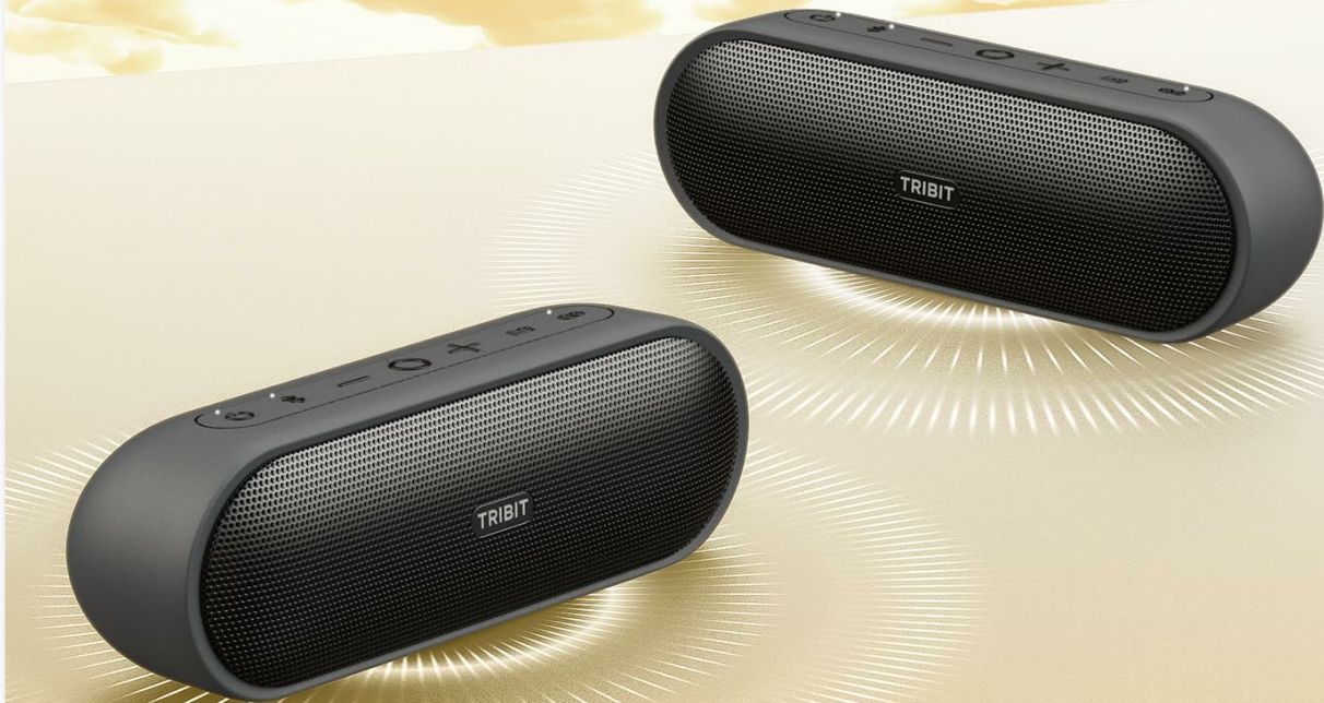
Tribit XSound Plus 2 speaker with an overlay indicating 24-hour battery life.