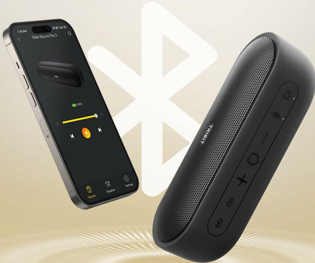
Tribit XSound Plus 2 speaker connecting via Bluetooth 5.3.

Your browser does not support the video tag.