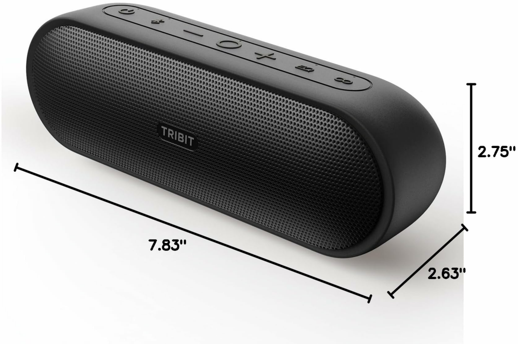
Dimensions of the Tribit XSound Plus 2 speaker.