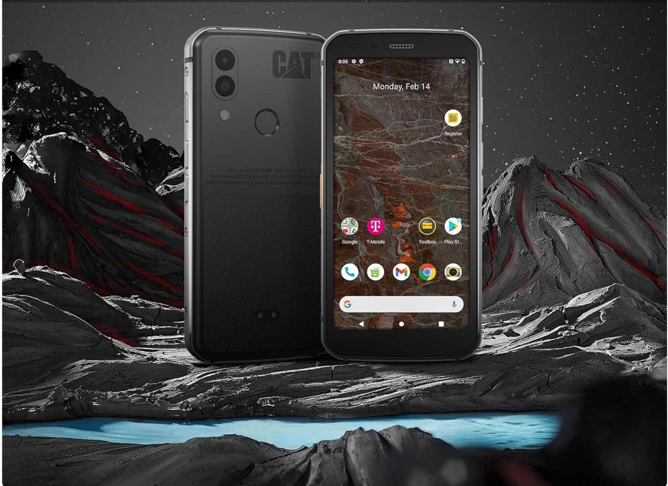
Figure 2.1: The CAT S62 smartphone highlighting its key features such as IP68 waterproof rating, 4000mAh battery, and camera specifications.