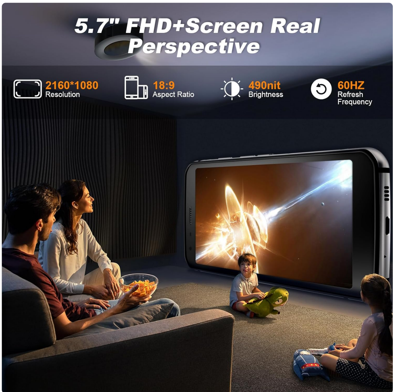
Figure 4.1: The CAT S62's 5.7-inch FHD+ display, showcasing its resolution, aspect ratio, brightness, and refresh rate.

The CAT S62 features a 5.7-inch FHD+ display with 2160x1080 resolution and 490 nits brightness, protected by Corning Gorilla Glass 6. It supports touchscreen operation even with wet fingers or gloves, making it ideal for outdoor use.