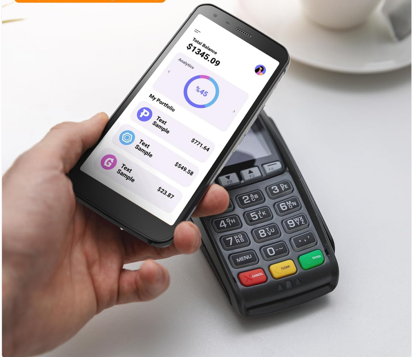
Figure 4.3: The CAT S62 utilizing its NFC capabilities for Google Pay transactions.