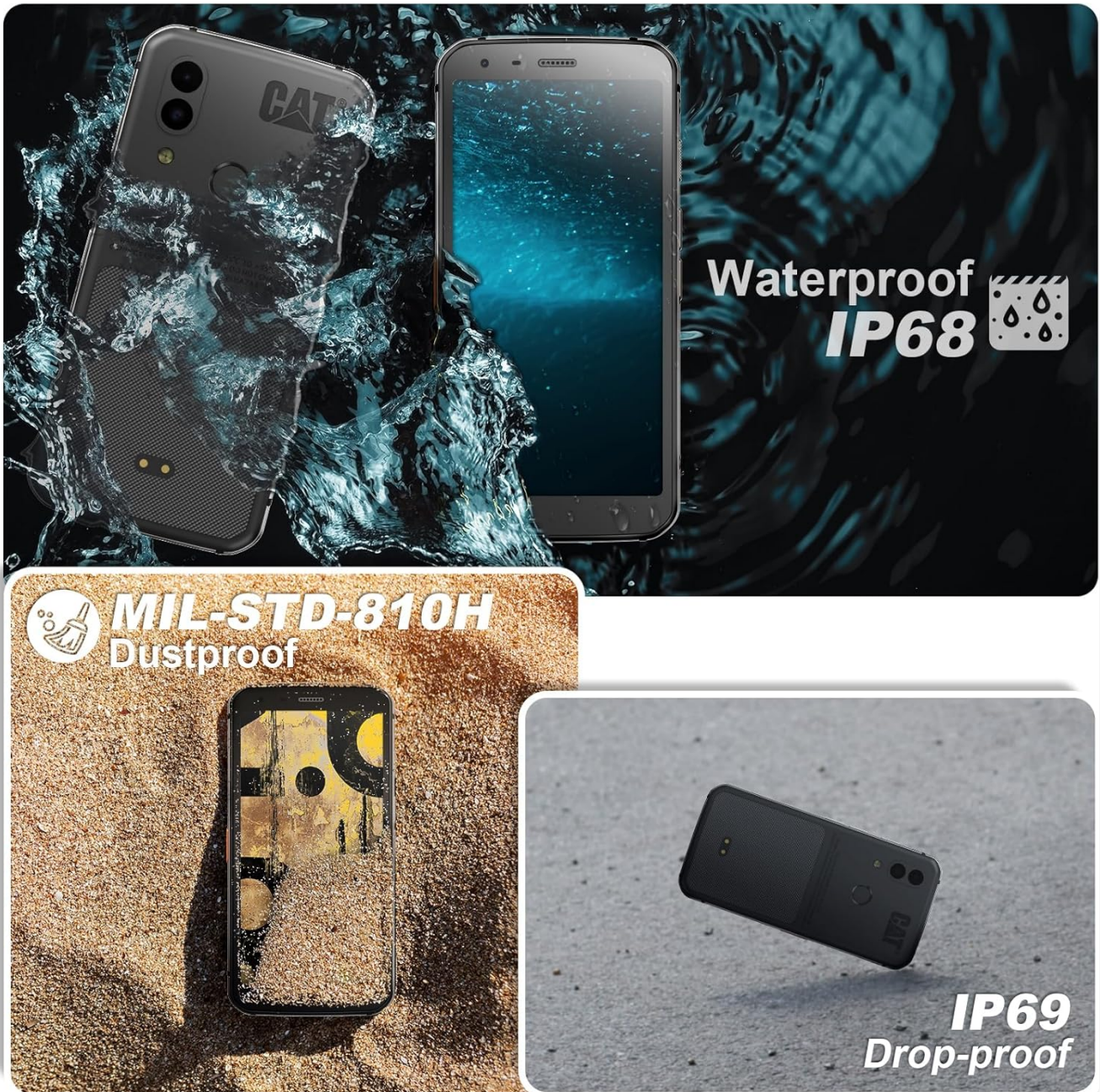
Figure 5.1: The CAT S62 showcasing its robust design with waterproof, dustproof, and drop-proof capabilities.