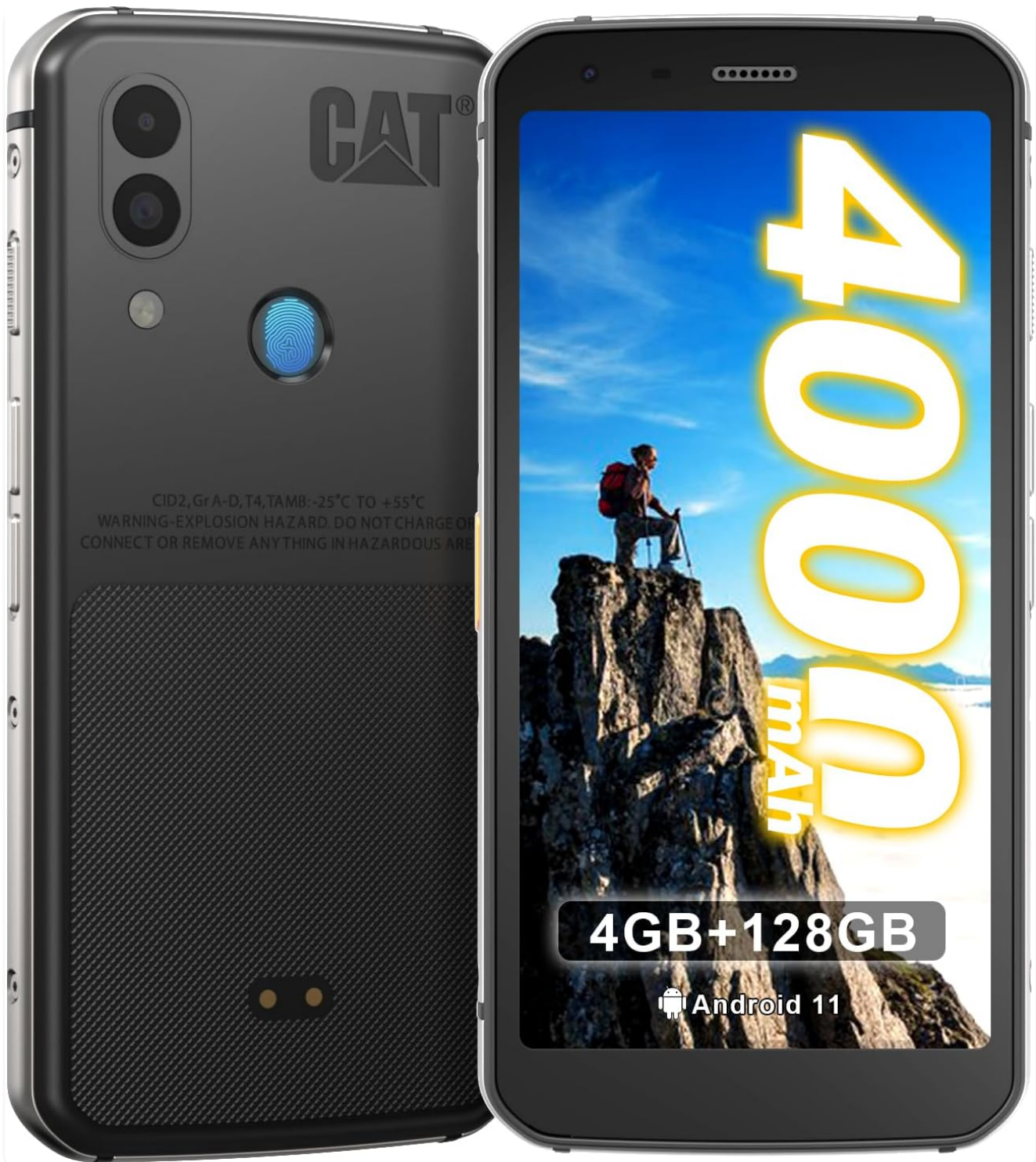
Figure 1.1: Front and back view of the CAT S62 Rugged Cell Phone.