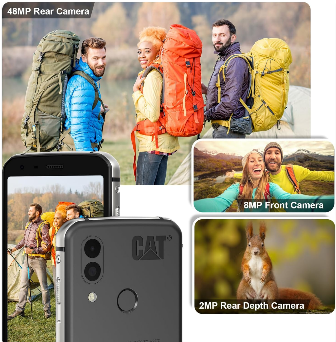
Figure 4.2: Overview of the CAT S62's camera system, including the rear and front camera specifications.