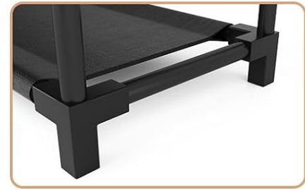
High Hardness Structural Parts