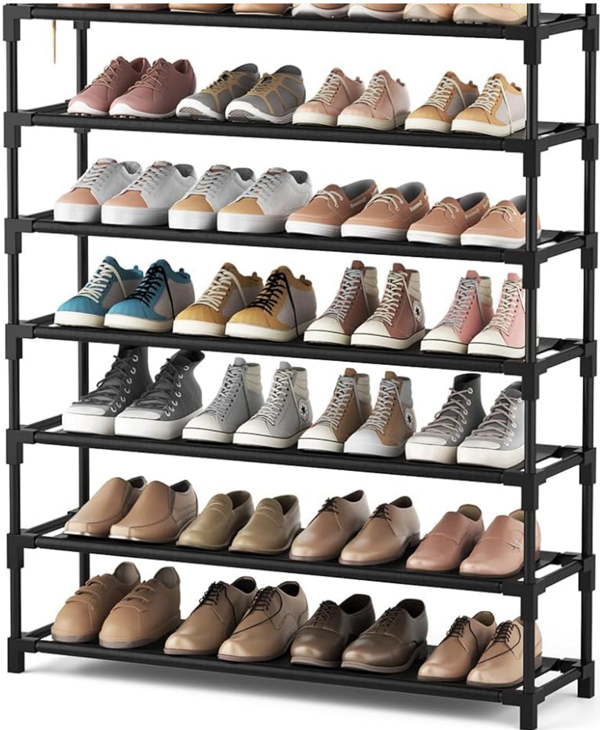
Image: Fully assembled VTRIN 10-Tier Shoe Rack, showcasing its large capacity and integrated hooks.