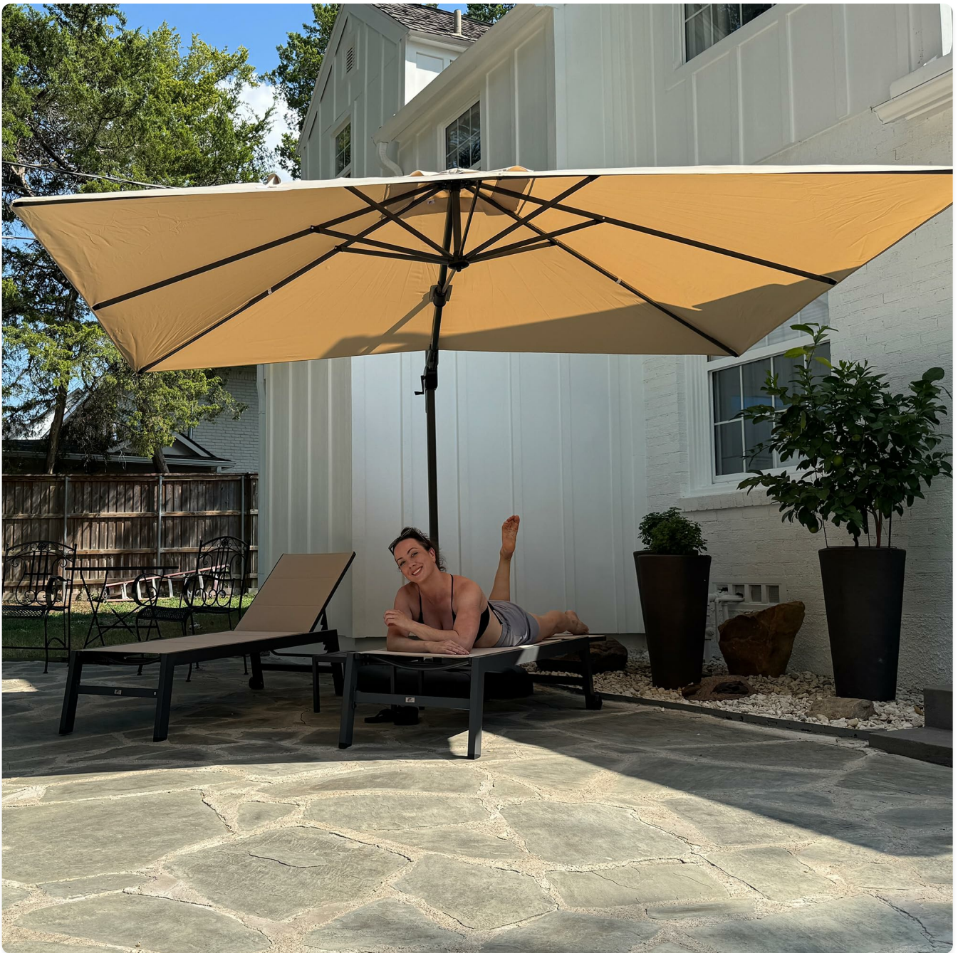
Image: The PURPLE LEAF 8.2' X 11.5' Left-right Tilting Patio Umbrella providing shade over a modern outdoor seating area next to a pool.