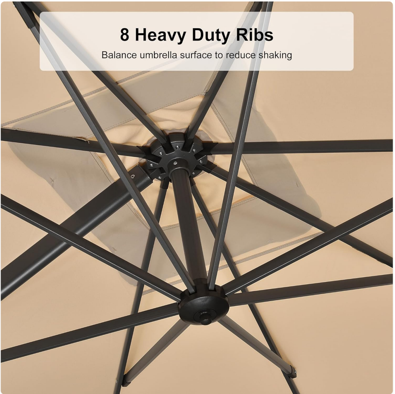
Image: An upward view into the umbrella canopy, clearly showing the eight heavy-duty ribs that provide structural support and balance.

Balance umbrella surface to reduce shaking