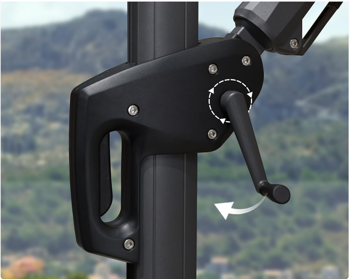
Image: A detailed shot of the cast aluminum handle and crank system, illustrating the mechanism for opening and closing the umbrella.