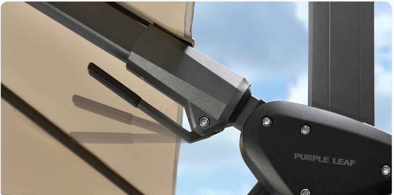
Image: A close-up of the unique swivel handle mechanism, demonstrating how to effortlessly adjust the canopy's tilt in dual directions.

Unique Swivel Handle: Effortless Dual-Directional Tilt