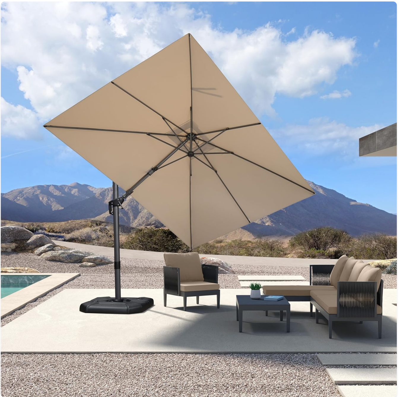
Image: A composite image illustrating the umbrella's ability to provide all-day shade by adjusting its tilt and rotation to track the sun from morning to evening.