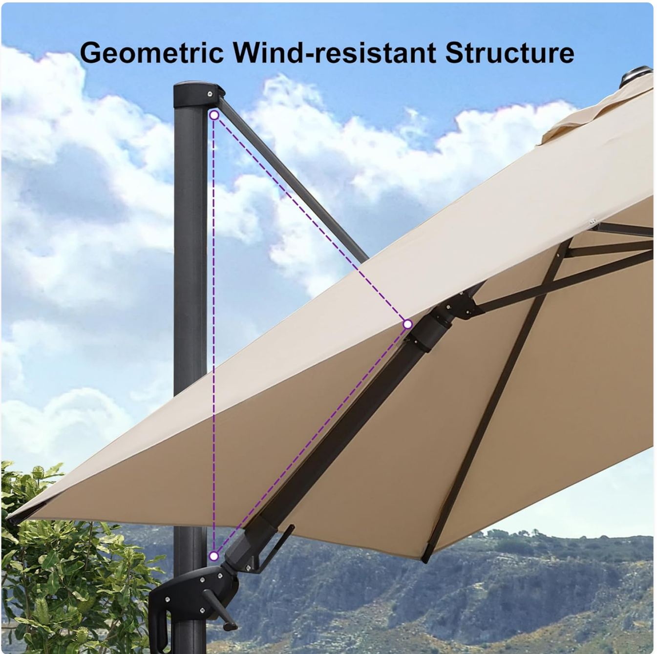
Image: A detailed view of the umbrella's internal frame and canopy, highlighting its geometric wind-resistant structure against a blue sky.