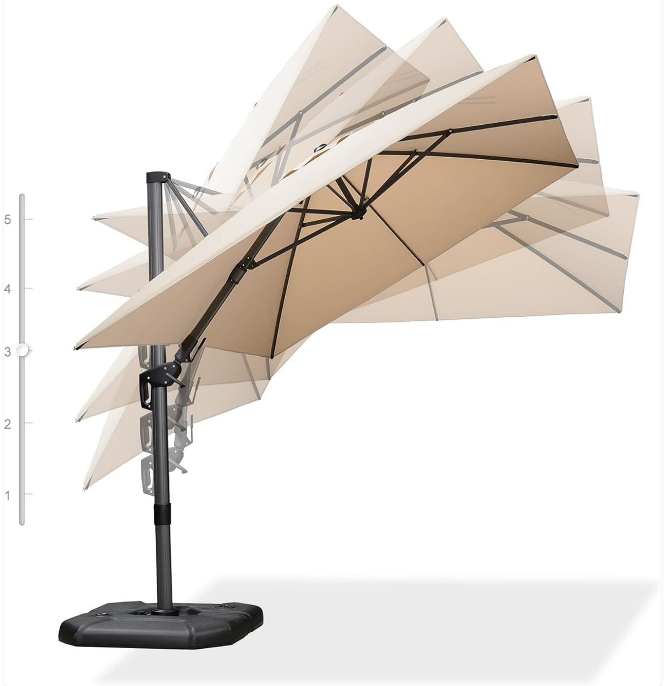
Image: A visual representation of the umbrella's 5-position tilt function, illustrating how the canopy can be adjusted to various angles for optimal shade.

Your browser does not support the video tag.