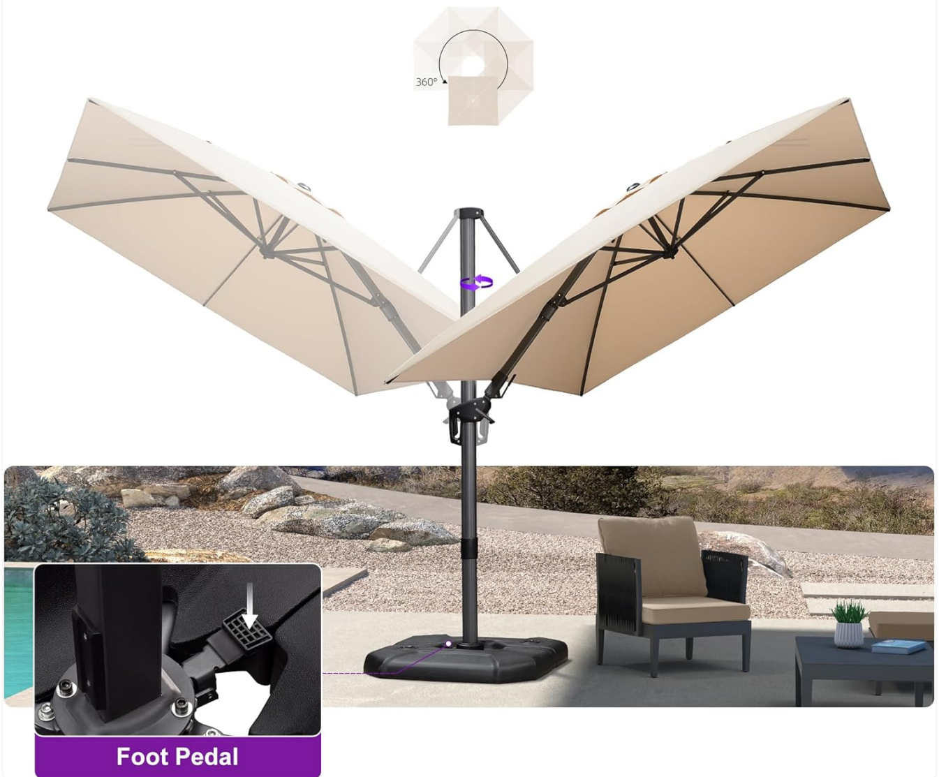
Image: A visual guide demonstrating the 360-degree rotation system, with a close-up of the foot pedal and an illustration of the umbrella's rotational movement.

Step on the pedal to lock your ideal shade angle