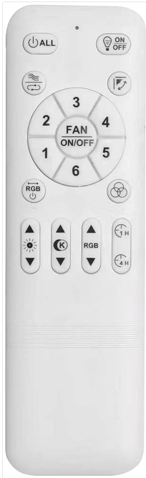
Image 1: LODADRA RGB Ceiling Fan Remote Control. This image displays the white remote control with clearly labeled buttons for fan operation, light control, and timer settings.