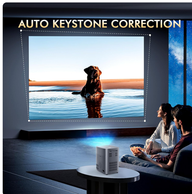
Figure 3.2: The side of the projector shows ventilation grilles for heat dissipation, ensuring stable operation.