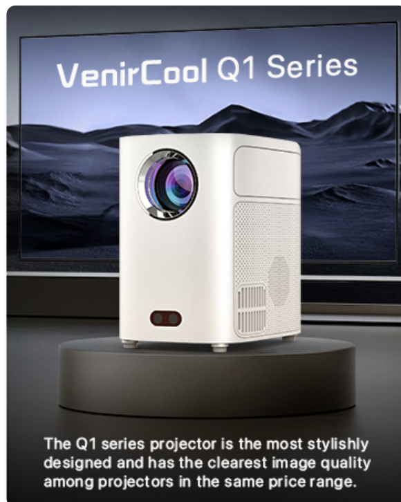
Figure 4.3: Auto keystone correction automatically adjusts the image to be perfectly rectangular, even if the projector is placed at an angle.