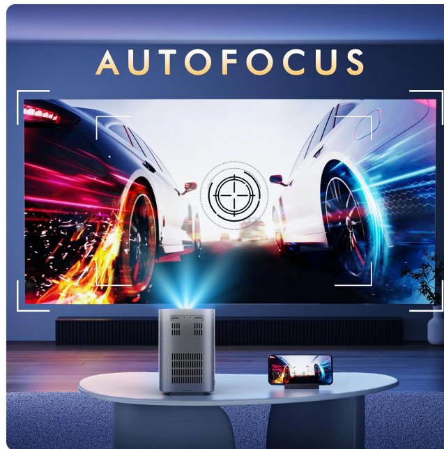
Figure 3.1: The front of the projector features the projection lens and sensors for auto-focus and obstacle avoidance.