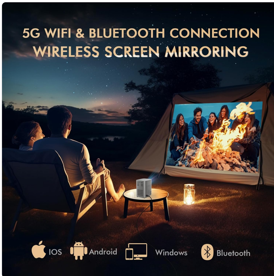
Figure 5.1: Enjoy stable wireless connectivity with 5G WiFi and Bluetooth 5.1 for various devices.

The Q1 Pro+ features 5G WiFi and Bluetooth 5.1 for seamless wireless connections.