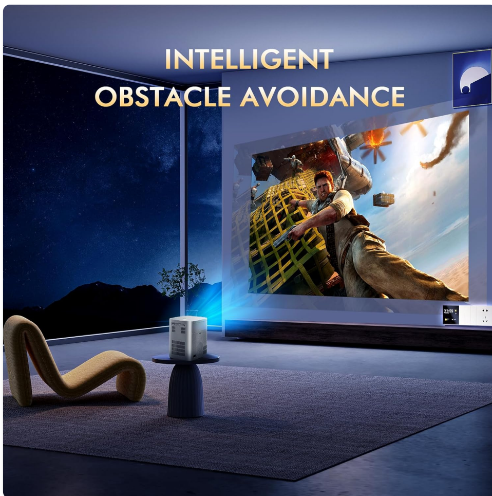
Figure 5.3: The projector intelligently adjusts the image to avoid objects on the projection surface.

The projector can automatically scale the image around obstacles like power outlets, picture frames, or plants, ensuring an uninterrupted viewing experience.