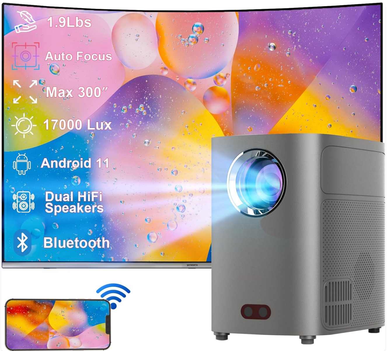
Figure 1.1: VenirCool Q1 Pro+ Projector in use, showcasing its compact design and projected image.