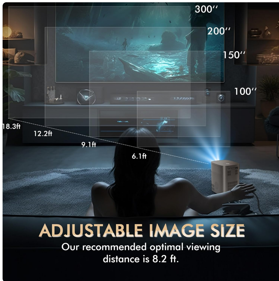
Figure 4.1: Recommended projection distances for various screen sizes, illustrating the flexibility of placement.