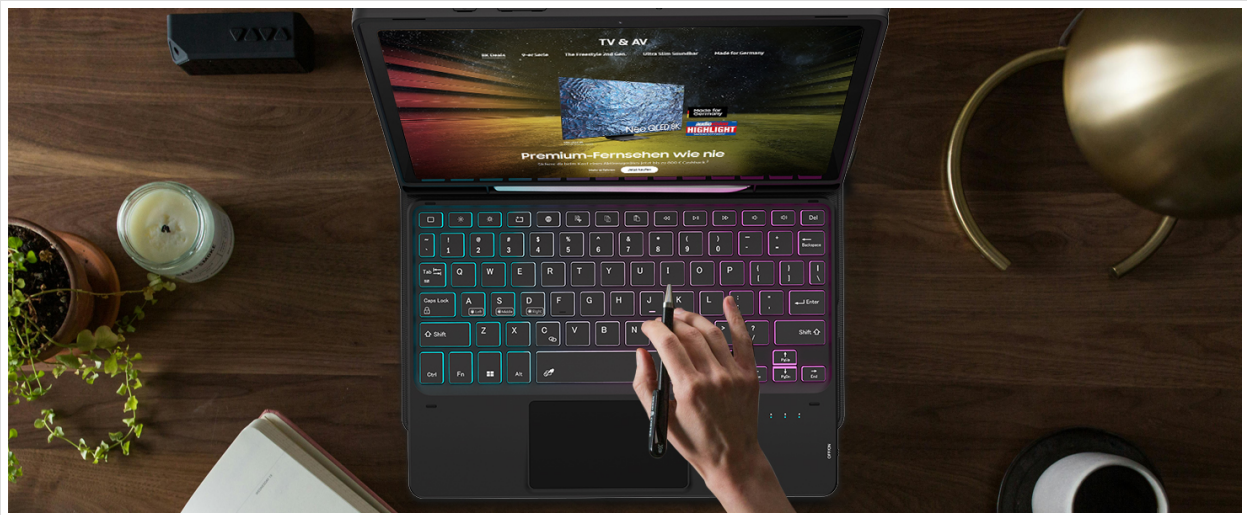
Image: SNOODU Keyboard Case with Samsung Galaxy Tab A9+ A9 Plus 11.0 inch tablet inserted, showing the keyboard and tablet in a laptop-like setup.

This manual provides detailed instructions for the setup, operation, and maintenance of your SNOODU Keyboard Case for the Samsung Galaxy Tab A9+ A9 Plus 11.0" (SM-X210/X216/X218). Please read this guide thoroughly before using the product to ensure optimal performance and longevity.