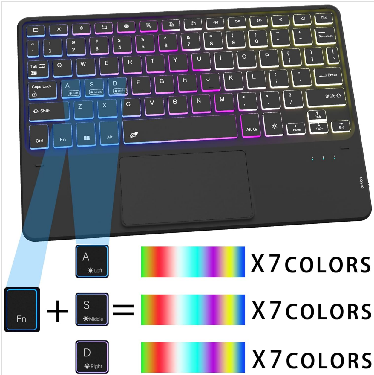
Image: Keyboard layout highlighting keys for backlight color and brightness control.