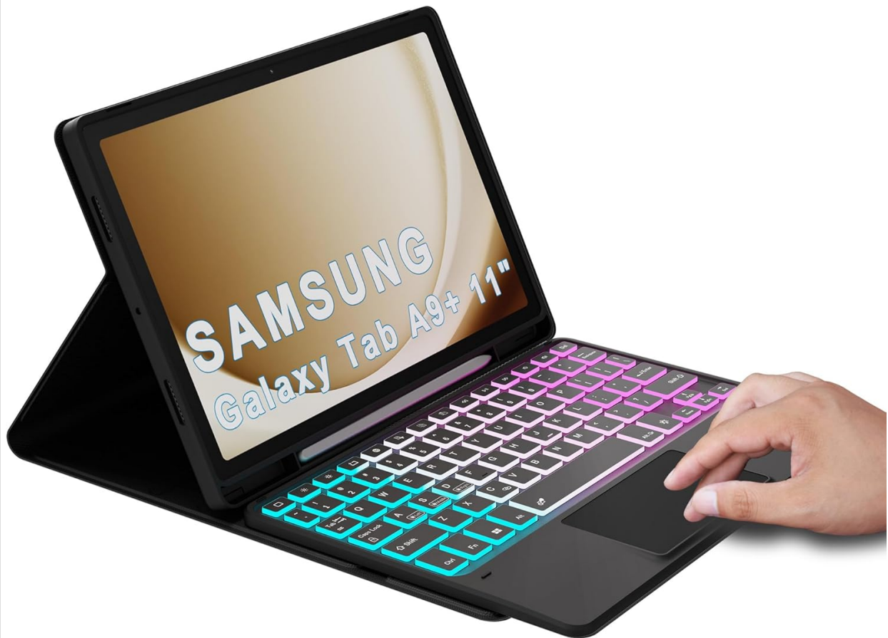
Single finger slipping