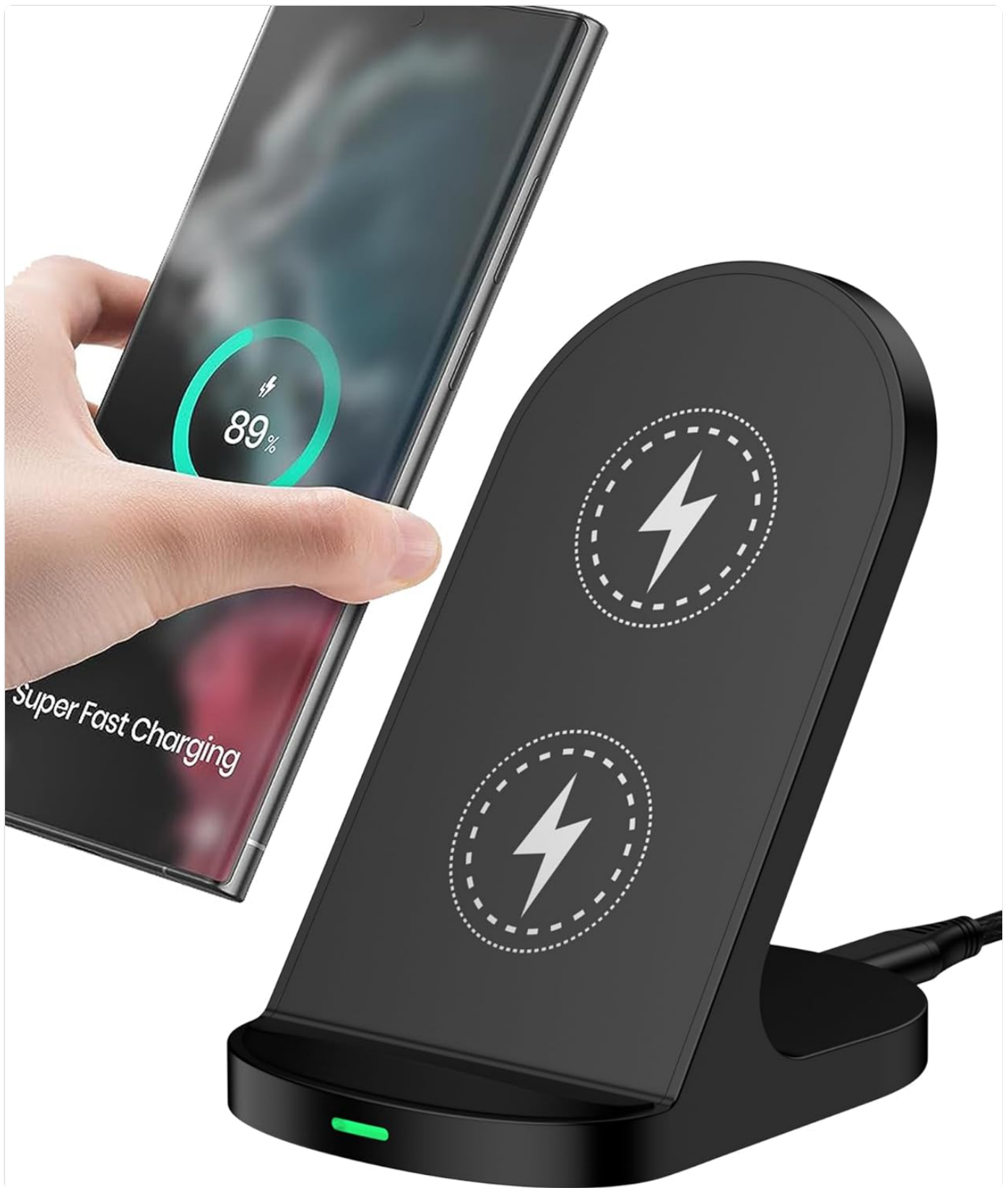
Figure 1: AILKIN 15W Fast Wireless Charger Stand. The image shows the black charger stand with two charging coils indicated by lightning bolt icons, and a smartphone being placed on it for charging, displaying an 89% charge level.

The AILKIN Wireless Charger Stand features a sleek, upright design with two built-in charging coils, allowing for a wider charging area and flexible phone placement. It includes an LED indicator light to show charging status and is equipped with NTC temperature guard for safe operation.