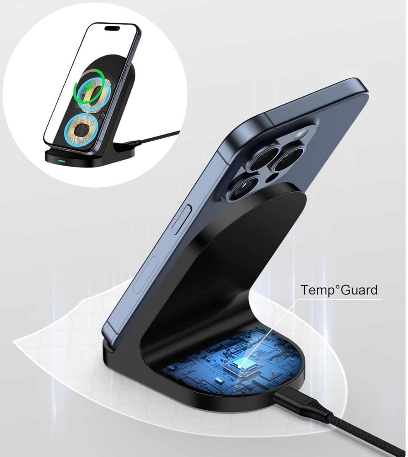
Figure 7: Exceptional NTC Temp°Guard. This diagram illustrates the internal temperature protection mechanism of the charger, designed to

Protect your phone battery against overheating and damage