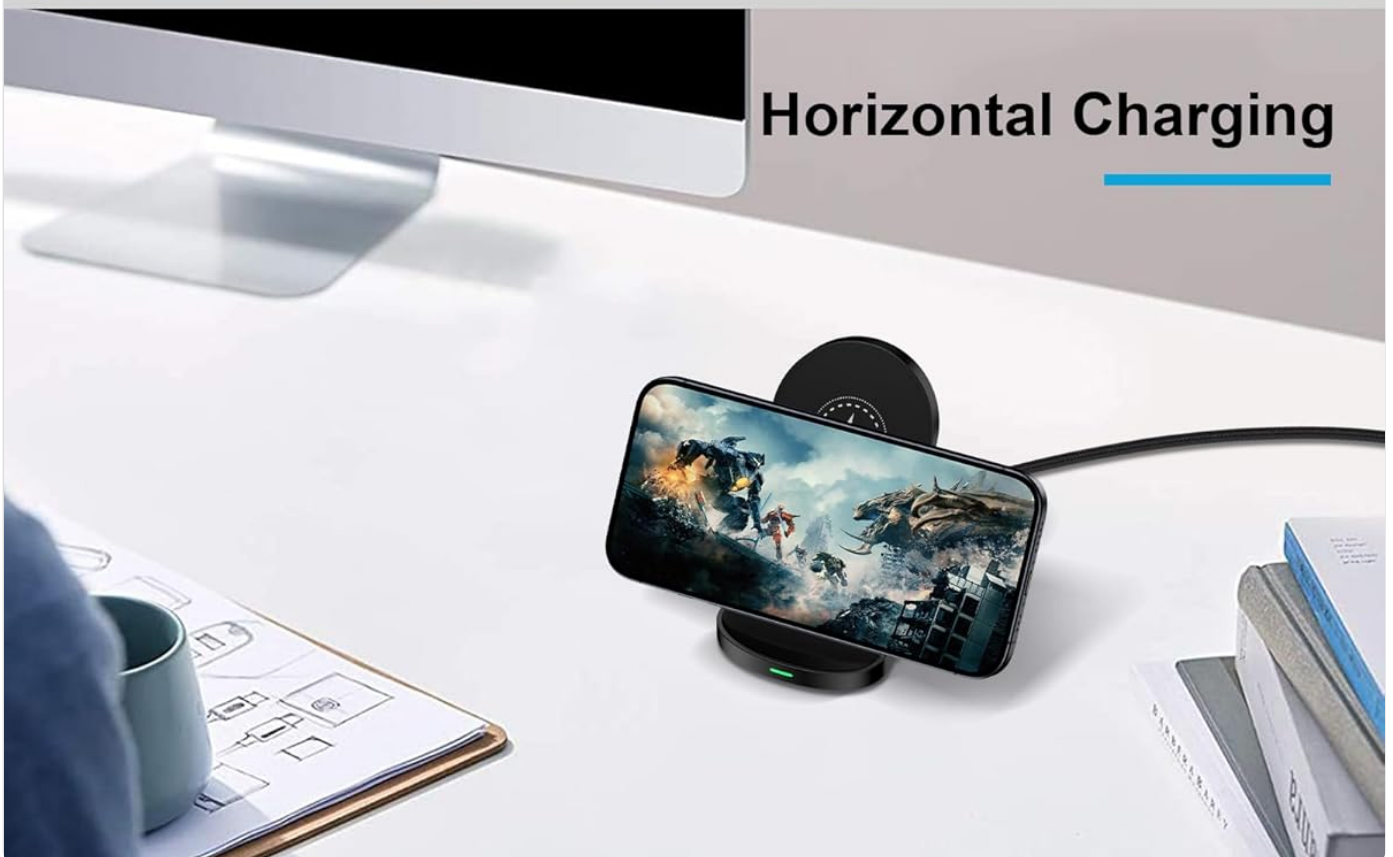
Figure 3: Vertical and Horizontal Charging. The top image shows a tablet and a smartphone charging vertically on the stand on a desk. The bottom image shows a smartphone charging horizontally on the stand, ideal for media consumption.