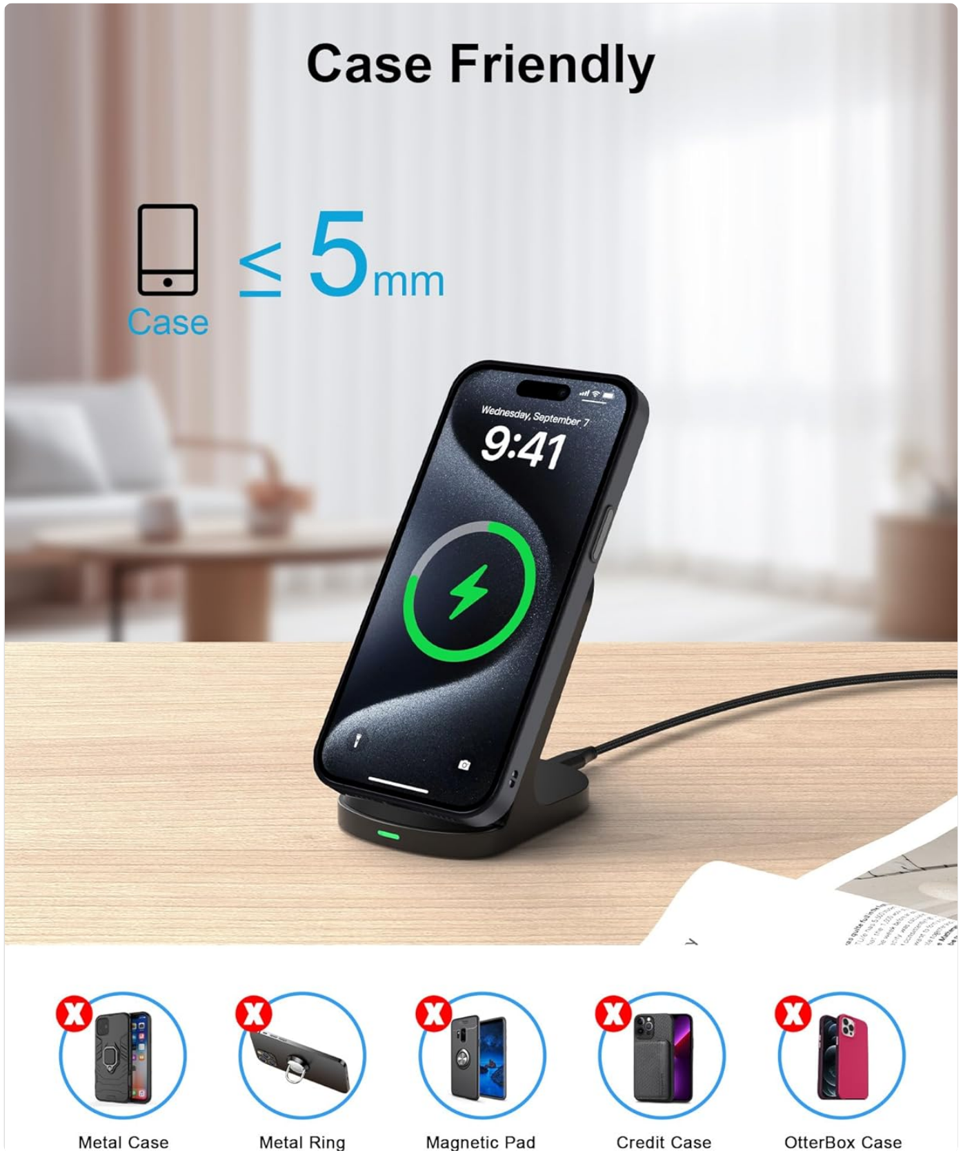
Figure 4: Case-Friendly Design. This image shows a smartphone charging with a thin case, indicating compatibility for cases up to 5mm thick. It also illustrates incompatible case types such as metal cases, cases with metal rings, magnetic pads, credit card cases, and OtterBox cases.

The charger is designed to transmit power directly through most protective cases. It works with rubber, plastic, and TPU cases up to 5mm in thickness. However, cases made of metal, cases with metal rings, magnets, or credit cards will interfere with charging and should be removed before placing your phone on the stand.