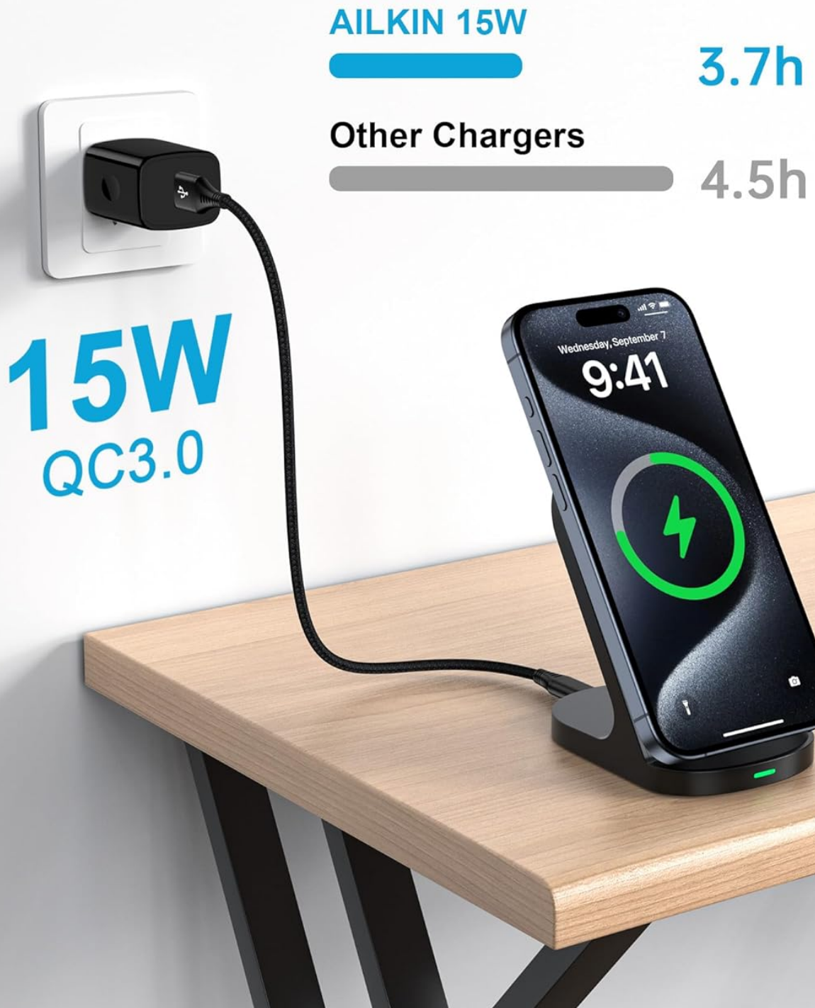
Figure 5: Fast Charging Efficiency. This infographic highlights the 15W fast charging capability of the AILKIN charger, showing it can fully charge a phone in 3.7 hours compared to 4.5 hours for other chargers, saving up to 45 minutes.

The AILKIN charger supports various fast charging modes depending on your device: