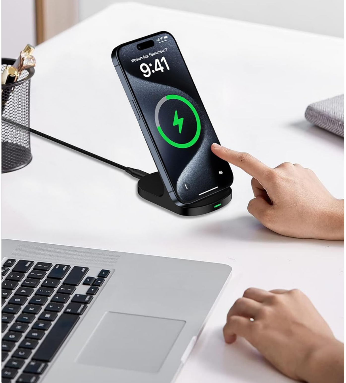
Figure 2: Placing a smartphone on the charger. The image shows a person's hand gently placing a smartphone onto the wireless charging stand, which is positioned on a desk next to a laptop.

To begin charging, simply place your Qi-enabled smartphone onto the charging stand. The dual-coil design allows for both vertical and horizontal charging orientations, enabling you to watch videos, listen to music, or make calls without interruption during the charging process.