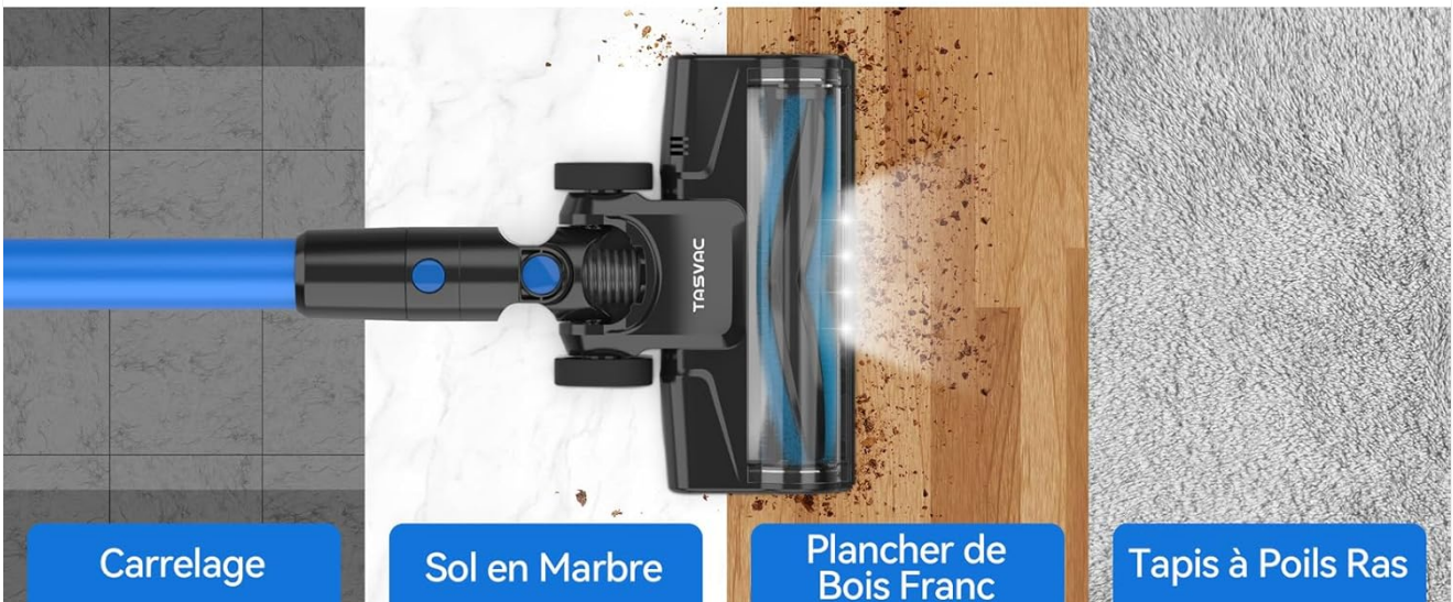
Figure 4.3: The flexible floor brush of the TASVAC V50 features LED headlights to illuminate dust in dark areas and offers 180-degree swivel and 90-degree tilt for easy maneuverability across various floor types including tile, marble, hardwood, and low-pile carpets.