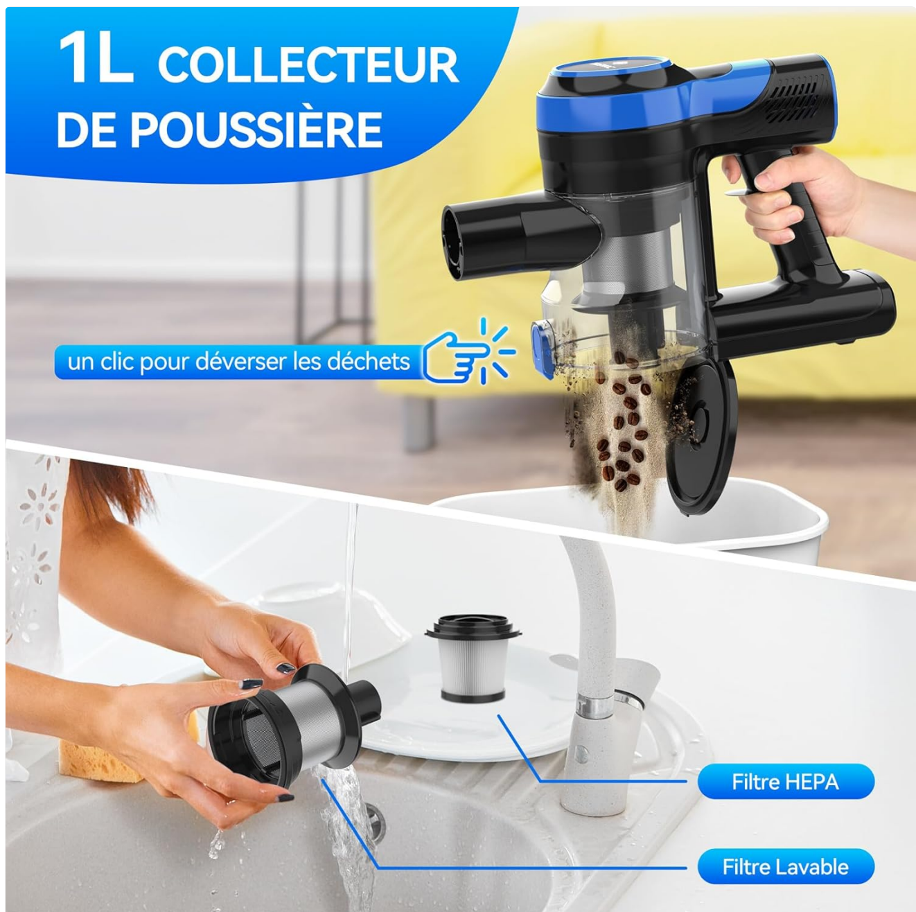
Figure 5.1: The TASVAC V50 features a 1L dust collector that can be emptied with a single click. The HEPA filter and other washable filters can be easily removed and rinsed under running water for cleaning.