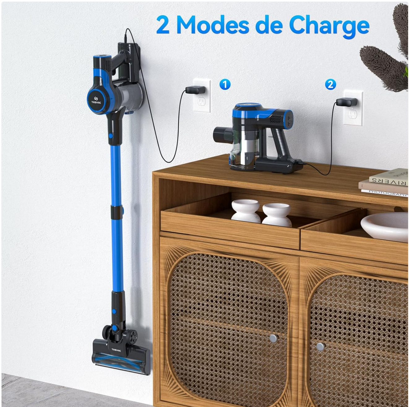
Figure 3.1: The TASVAC V50 offers two charging methods: direct charging by plugging the adapter into the main unit while it's mounted on the wall, or by removing the battery and charging it separately.