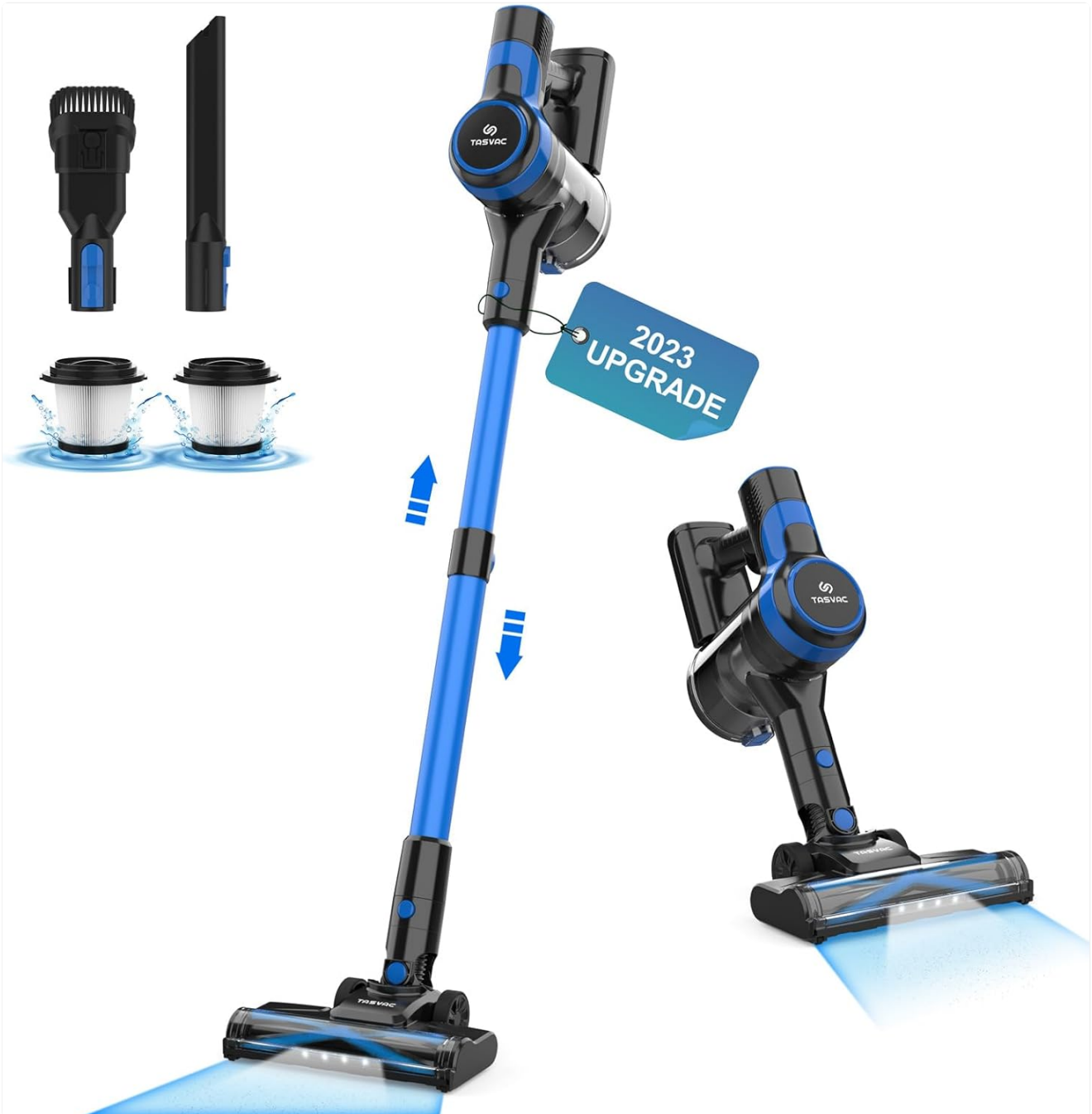
Figure 2.1: Main components of the TASVAC V50 Cordless Vacuum Cleaner, including the main unit, extension wand, floor brush, and various attachments like the crevice tool and brush tool. Two spare filters are also shown.

The TASVAC V50 is a versatile cordless vacuum cleaner designed for efficient cleaning of various surfaces. It features a powerful motor, multi-stage filtration, and a lightweight design for ease of use.