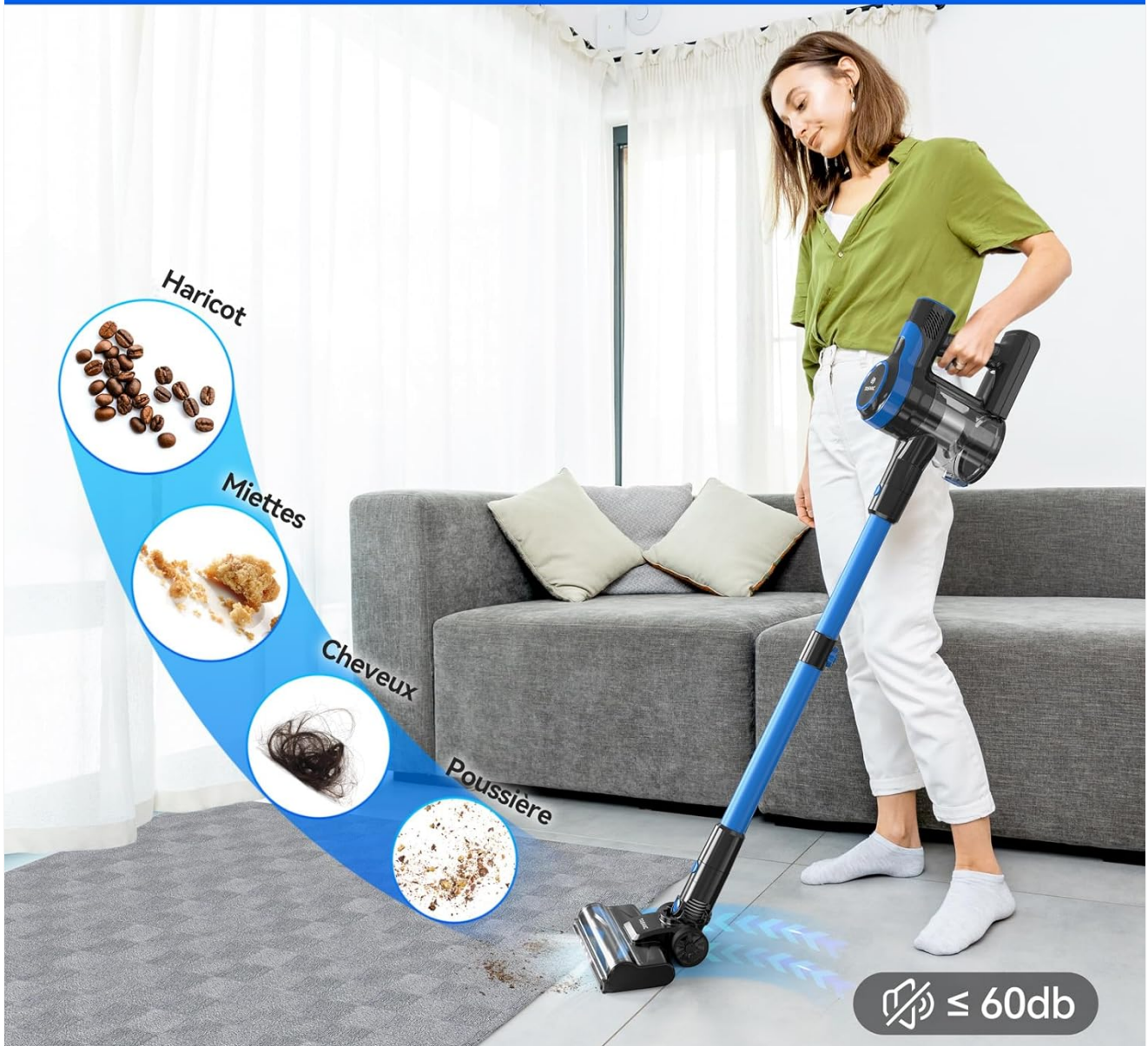
Figure 4.2: The TASVAC V50 is effective at picking up various types of debris, including beans, crumbs, hair, and fine dust, while operating at a low noise level of 60dB.