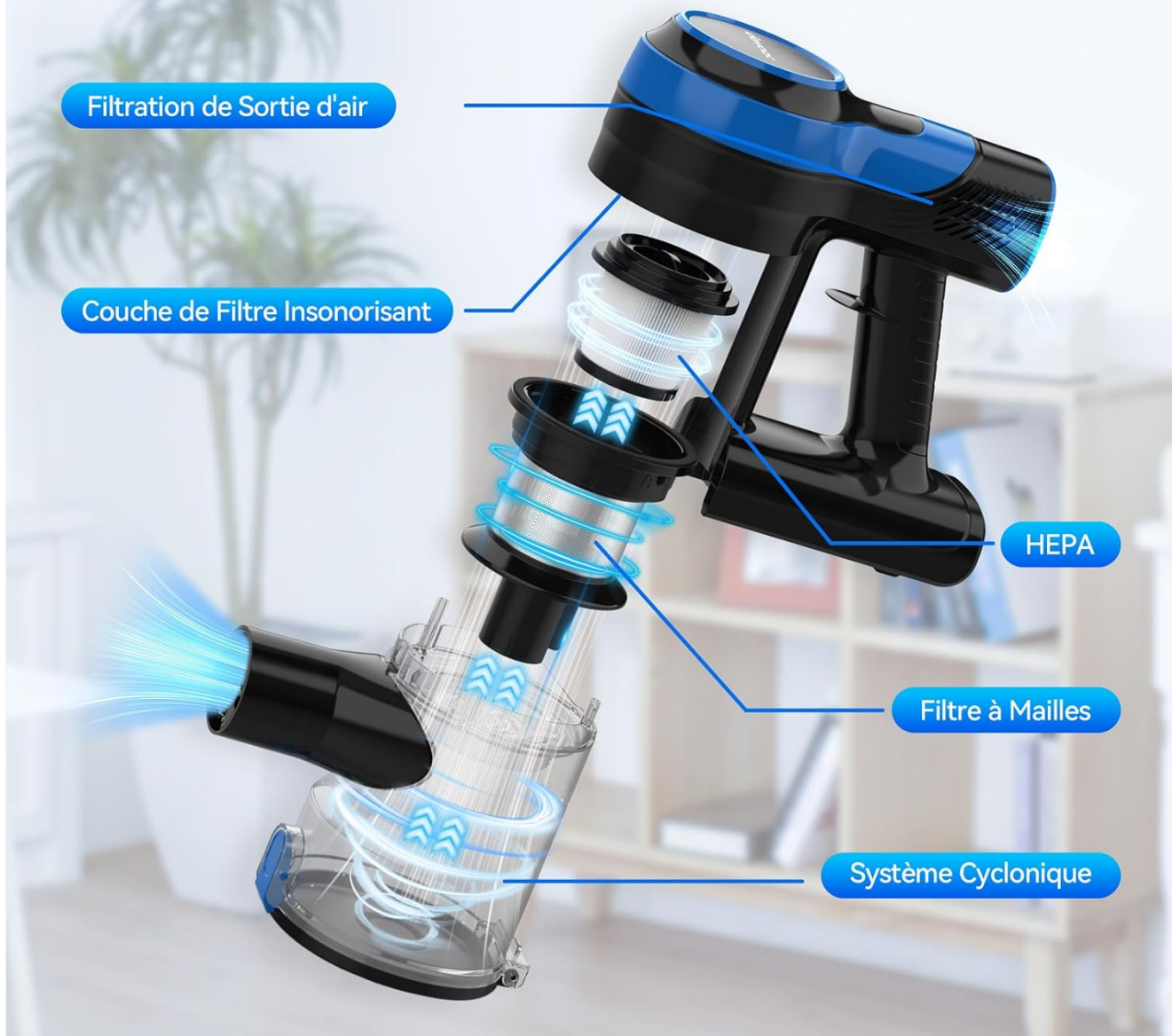
Figure 5.2: The TASVAC V50 utilizes a 5-stage filtration system, including a cyclonic system, mesh filter, HEPA filter, sound-insulating filter layer, and air outlet filtration, all designed to capture fine dust and allergens effectively.