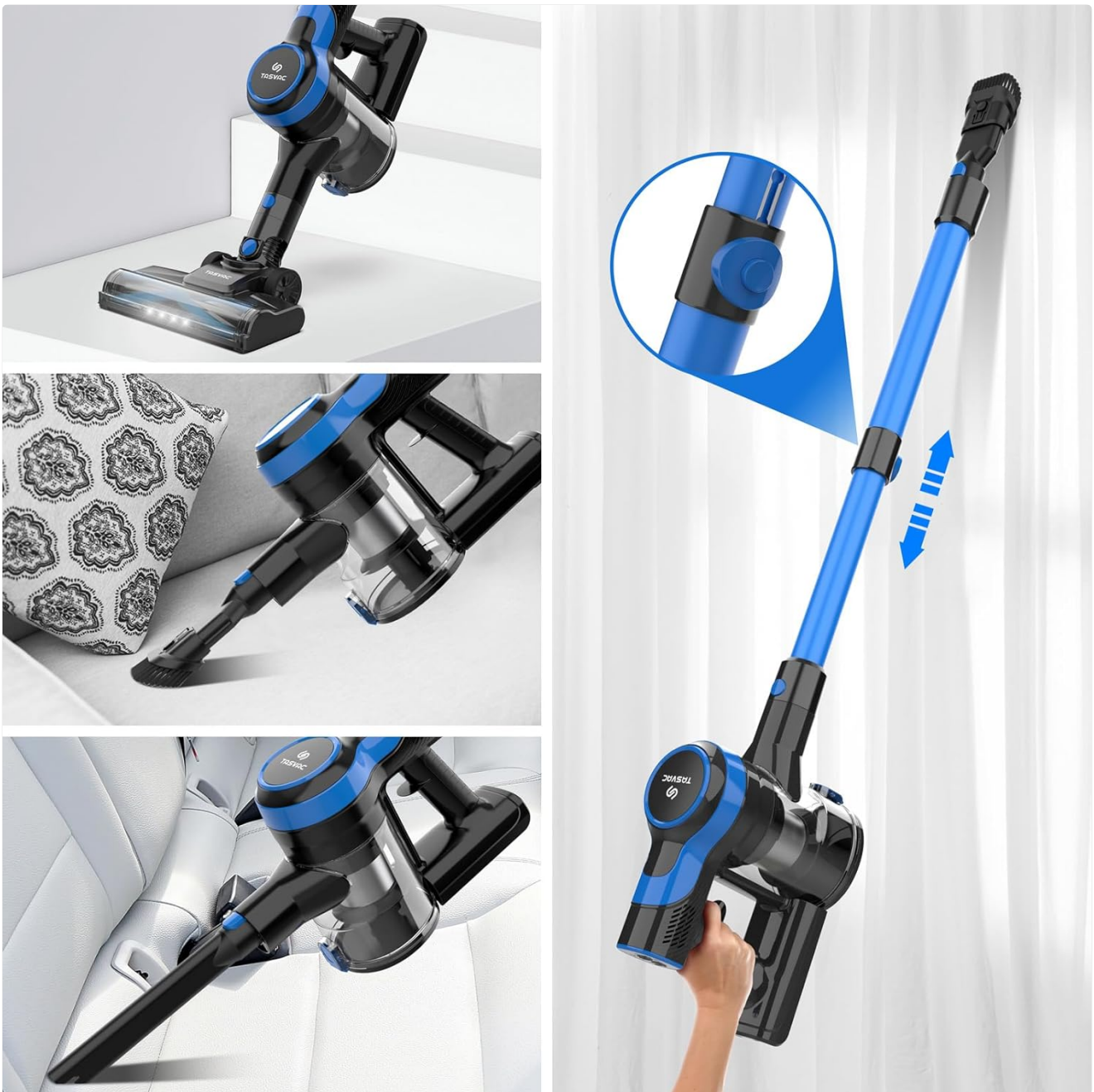
Figure 4.1: The TASVAC V50 can be used in various configurations: as an upright stick vacuum, a handheld vacuum for furniture and car interiors, and with the extension wand for high-reach areas.

The vacuum can be easily converted for different cleaning tasks: