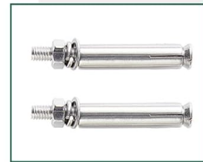
Durable Expansion Bolt