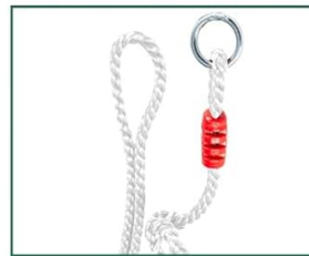
Solid Adjustable Rope