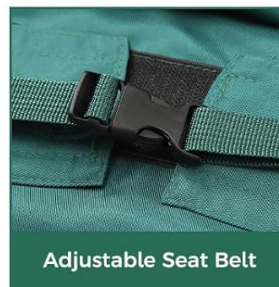
Adjustable Seat Belt