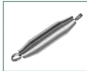
Strong & Flexible Spring