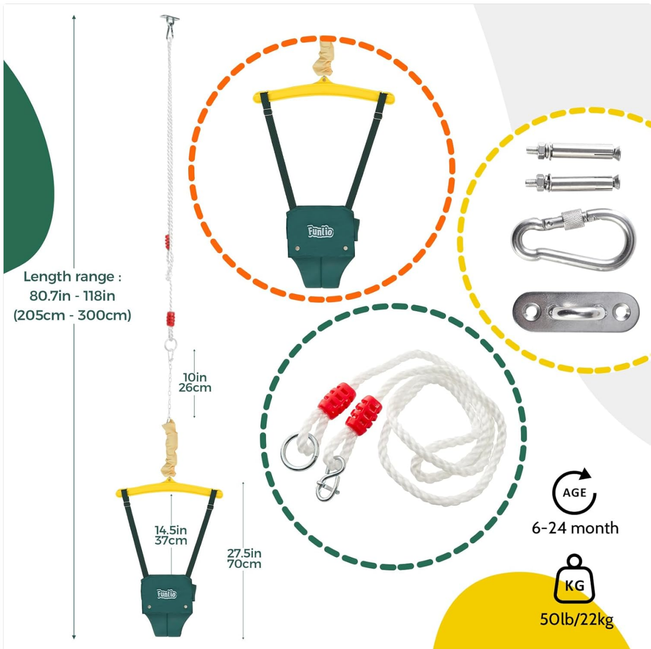
Illustration of all components included in the FUNLIO Baby Jumper package, along with key dimensions.