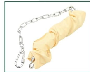
3 Safety Lock Carabiners