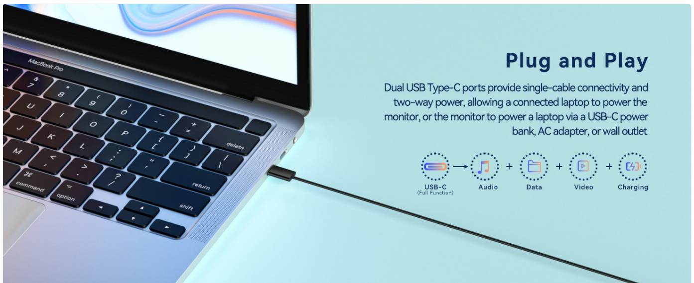
Figure 7: USB-C Single Cable Connection