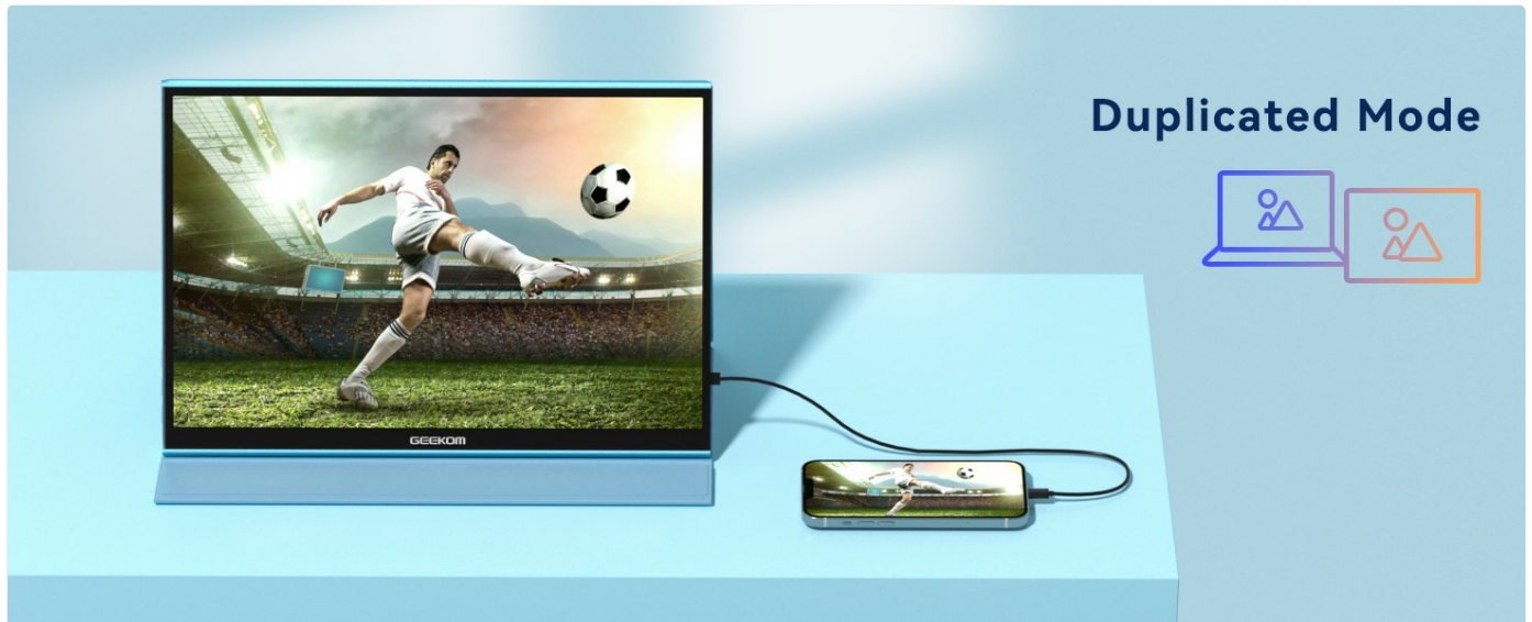
Figure 9: Duplicated Display Mode

Duplicated Mode: Mirrors the content of your primary screen onto the portable monitor. Ideal for presentations or sharing content.