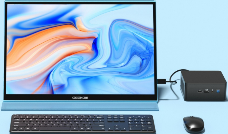
Figure 11: Second Screen Mode