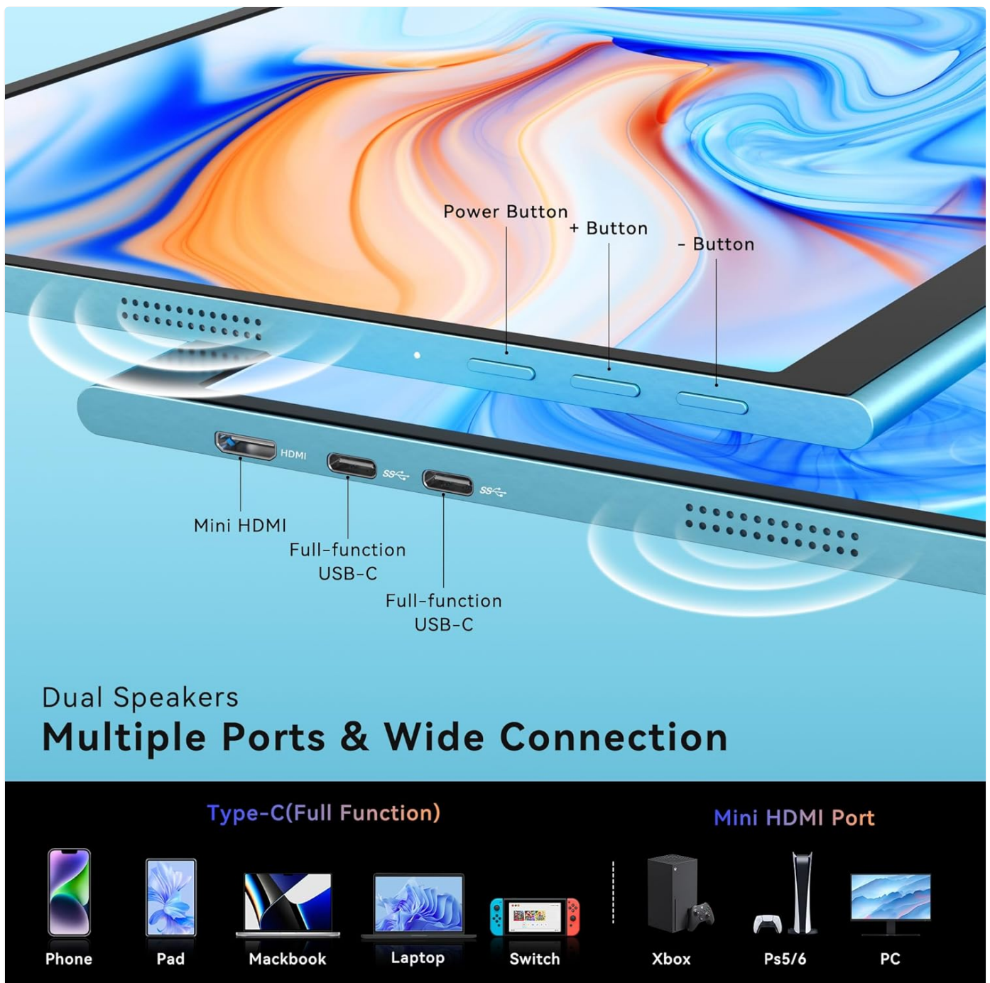
Figure 4: Multiple Ports and Controls