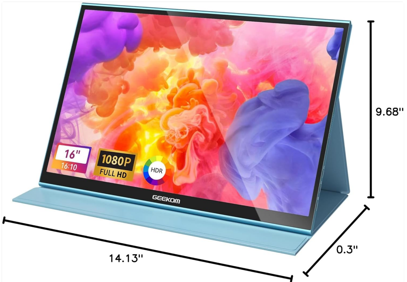
Figure 13: Product Dimensions