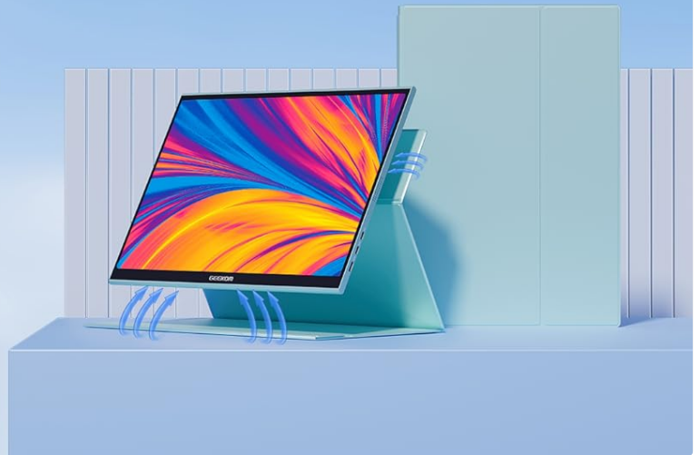
Figure 6: Smart Case Functionality

The GEEKOM PM16 Portable Screen comes with a stylish, smart cover made of durable PU leather exterior that is wear-resistant and scratch-proof, providing all-around protection for the screen.