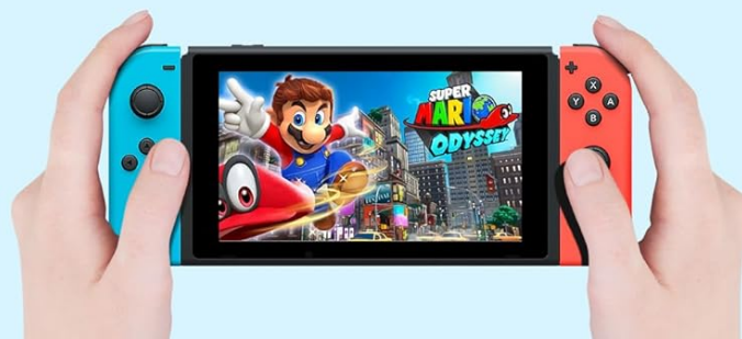
Figure 8: Broad Device Compatibility