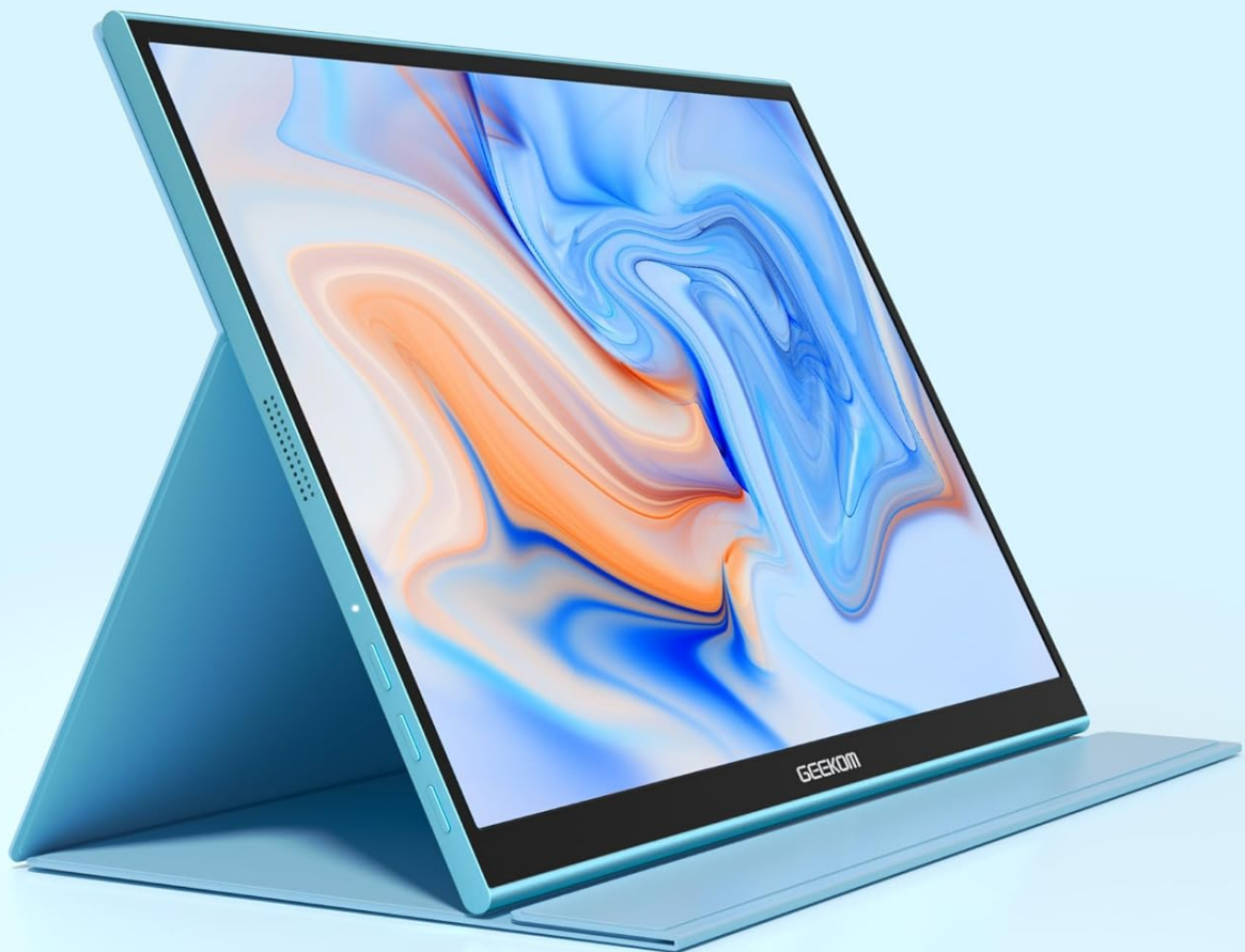
Figure 3: High-Resolution IPS Display