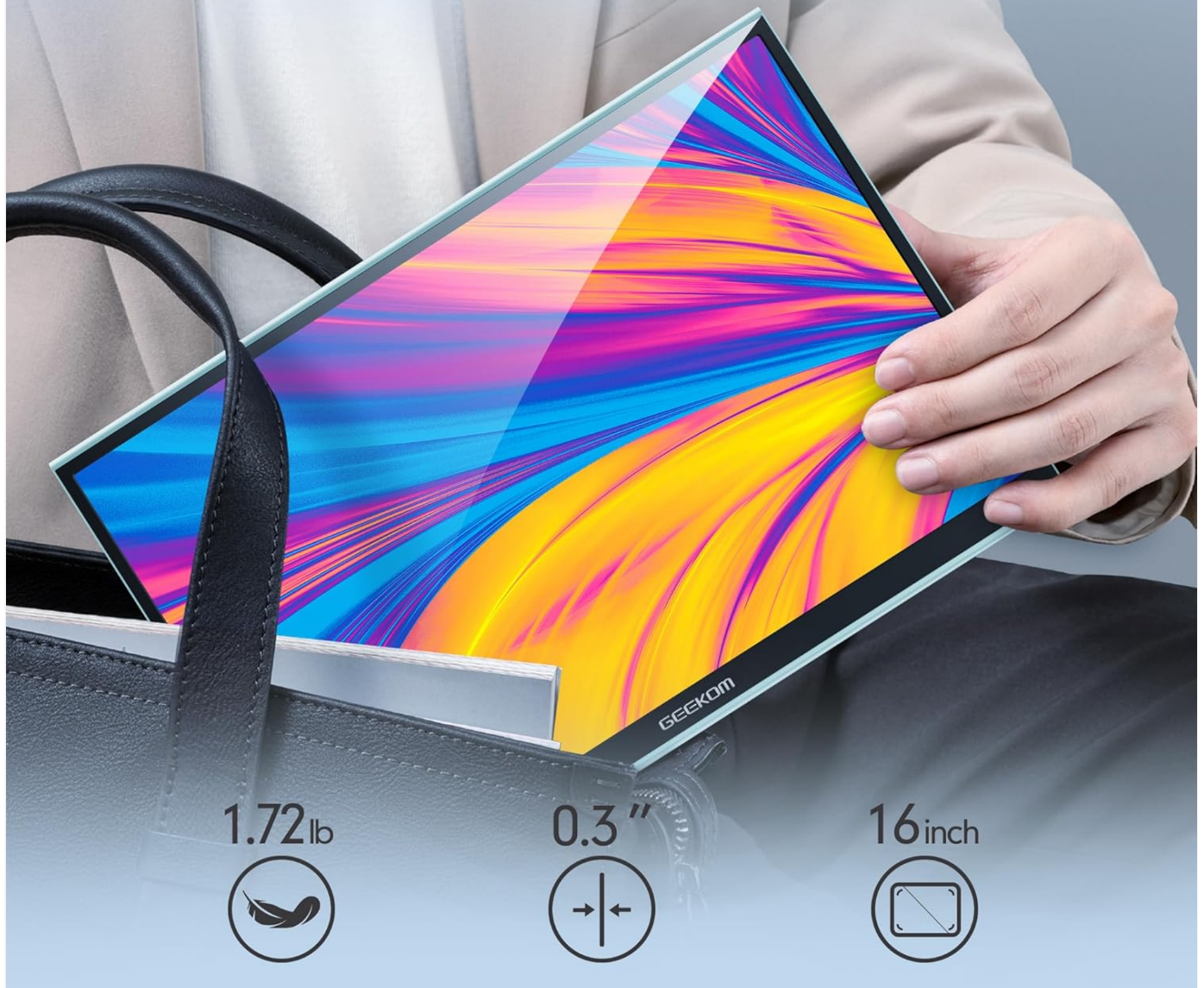
Figure 5: Slim and Portable Design