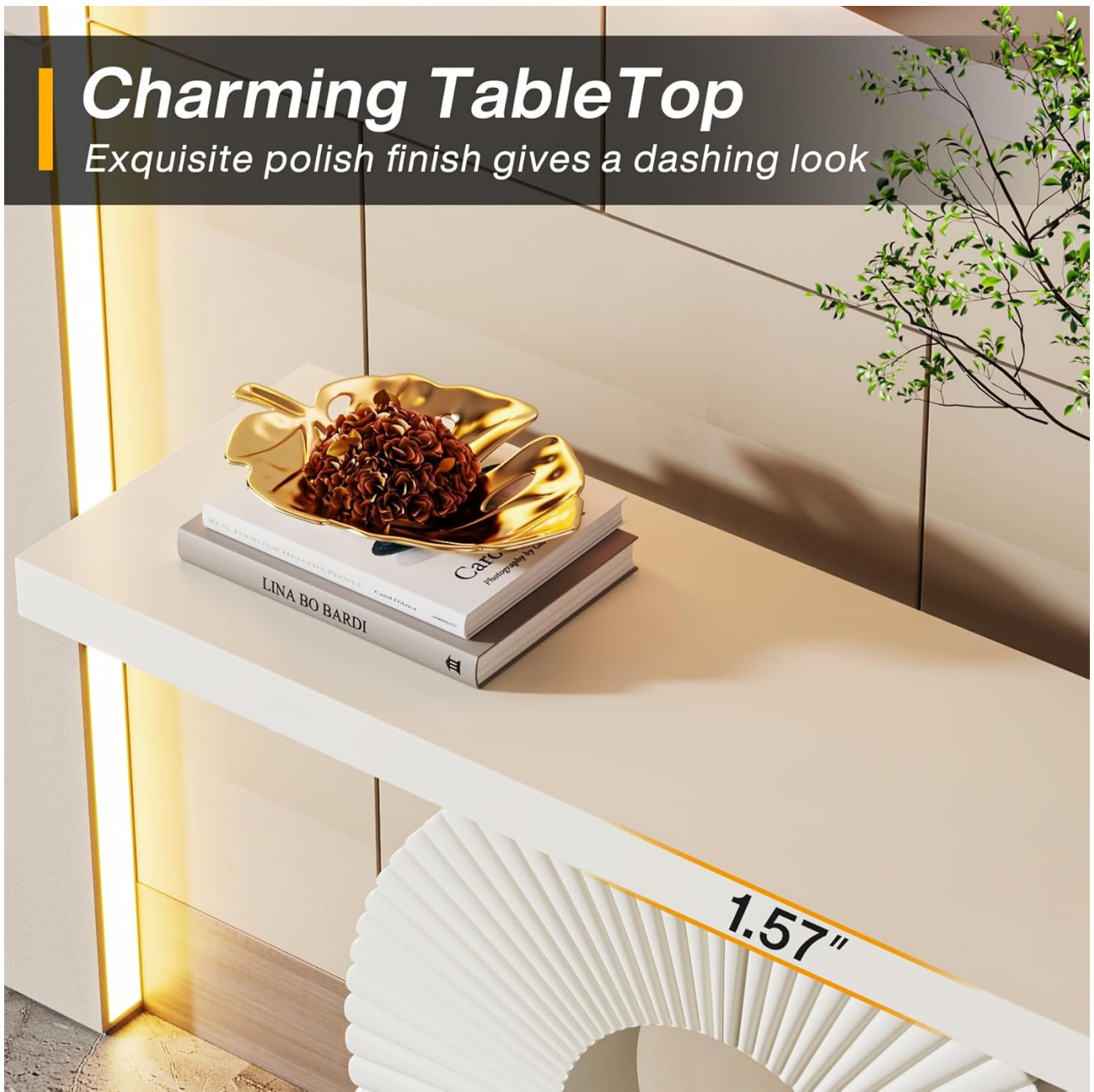
Figure 5.1: Detail of the tabletop's polished finish.

Exquisite polish finish gives a dashing look