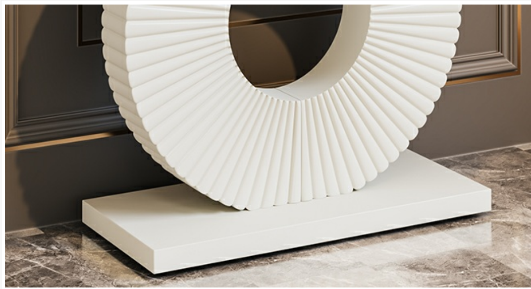
Figure 4.2: Detail of the geometric base, highlighting its construction.

Video 4.1: Official assembly demonstration for the Tribesigns Modern Console Table. This video illustrates the steps for putting the table together.