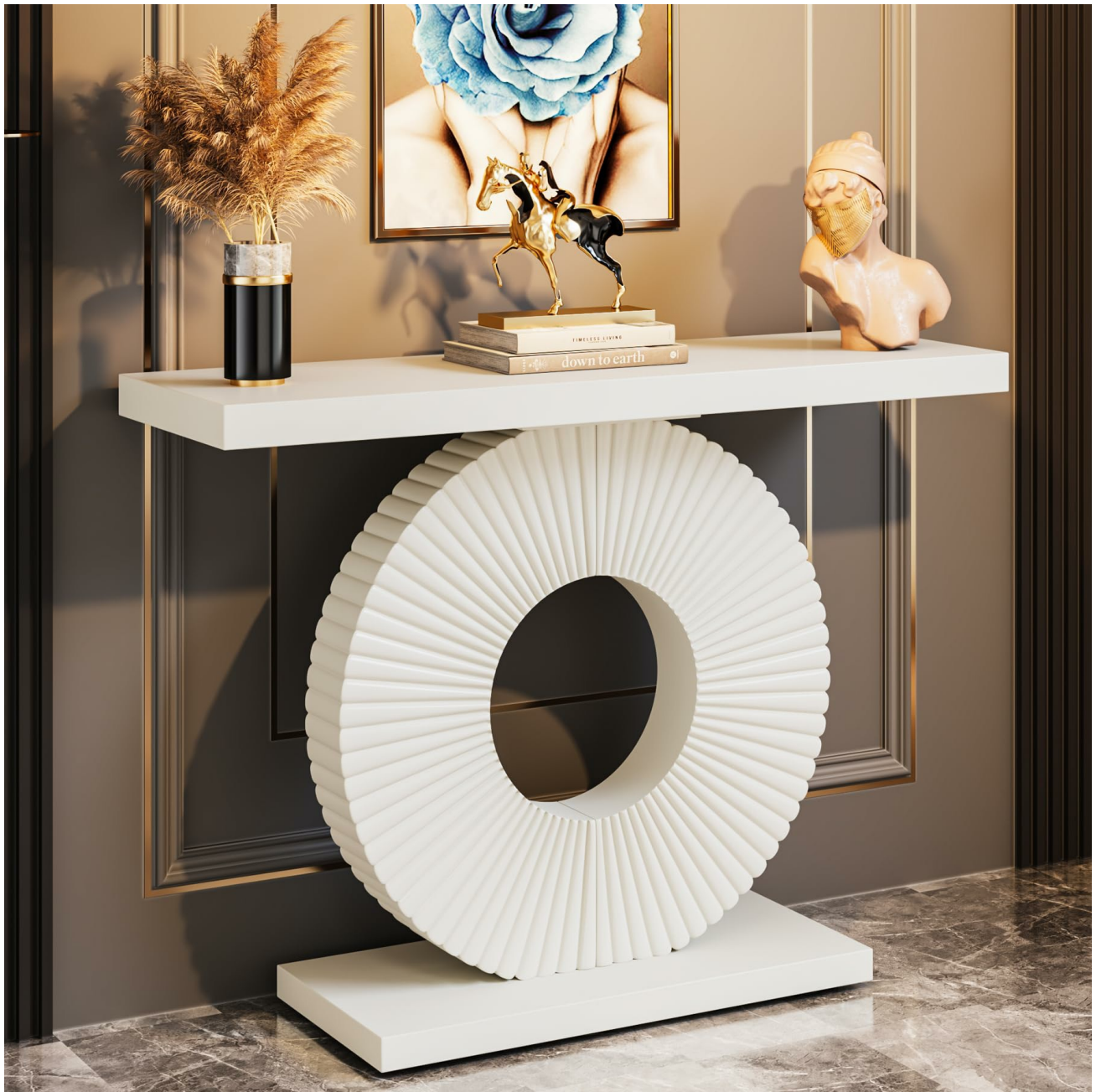
Figure 1.1: Front view of the Tribesigns Modern Console Table.