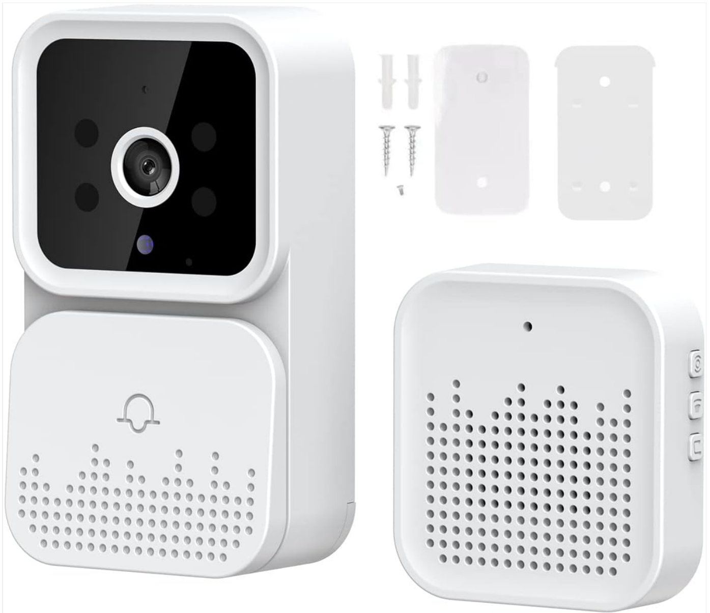
Image: The YUNFANG Smart Video Doorbell unit (left) and its accompanying chime unit (right), along with mounting accessories.