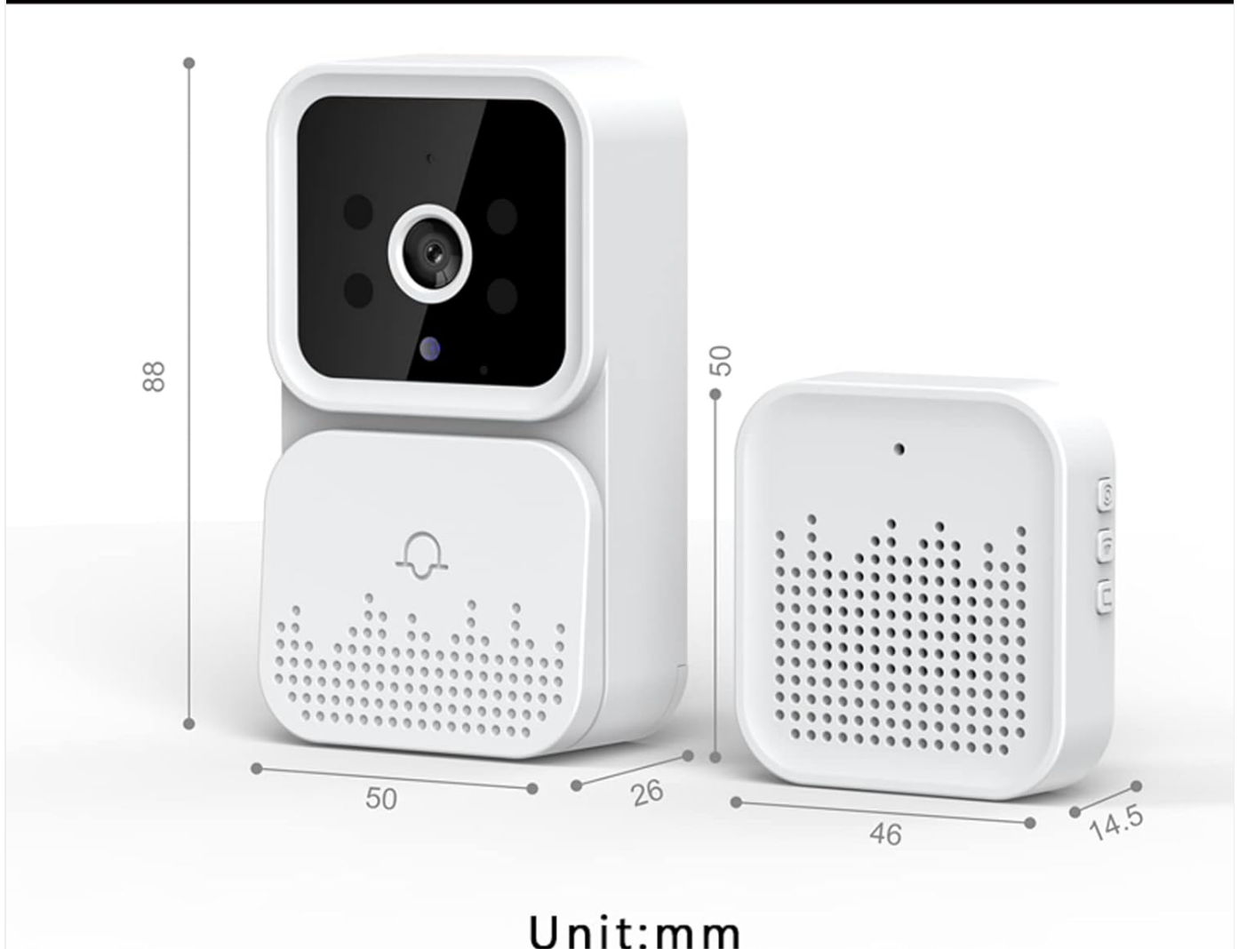
Image: Detailed physical dimensions of both the doorbell and chime units in millimeters.