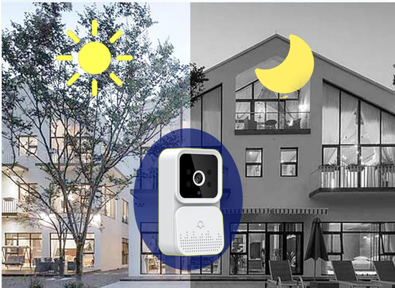
Image: Demonstrates the doorbell's infrared night vision capability, showing clear visibility in dark conditions.

The video doorbell supports night vision and has excellent picture quality even in the dark.