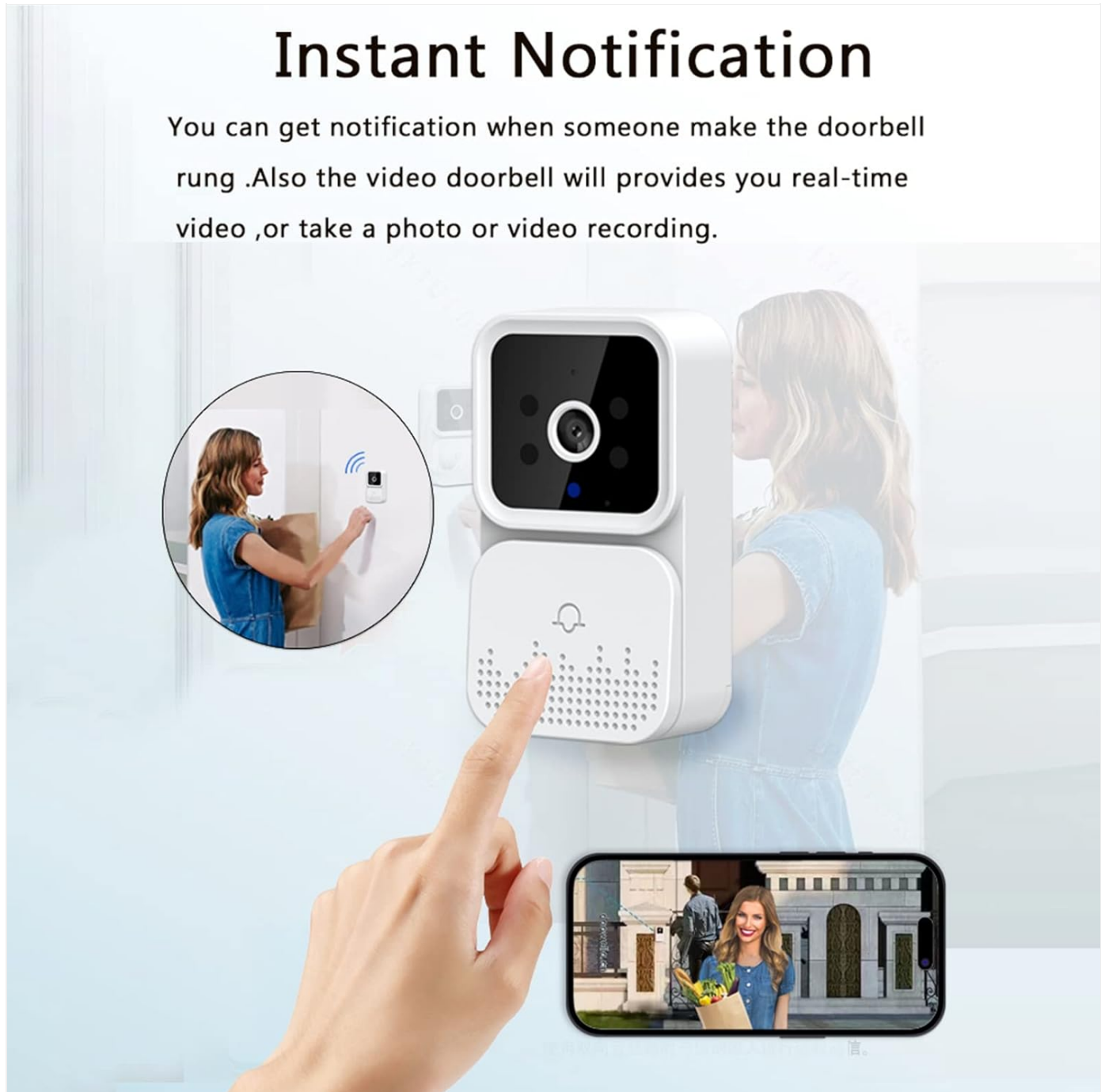
Image: Illustration of a user receiving an instant notification on their smartphone when the doorbell is pressed.

When a visitor presses the doorbell button, the doorbell will send a push notification to your connected smartphone. The chime unit will also ring.