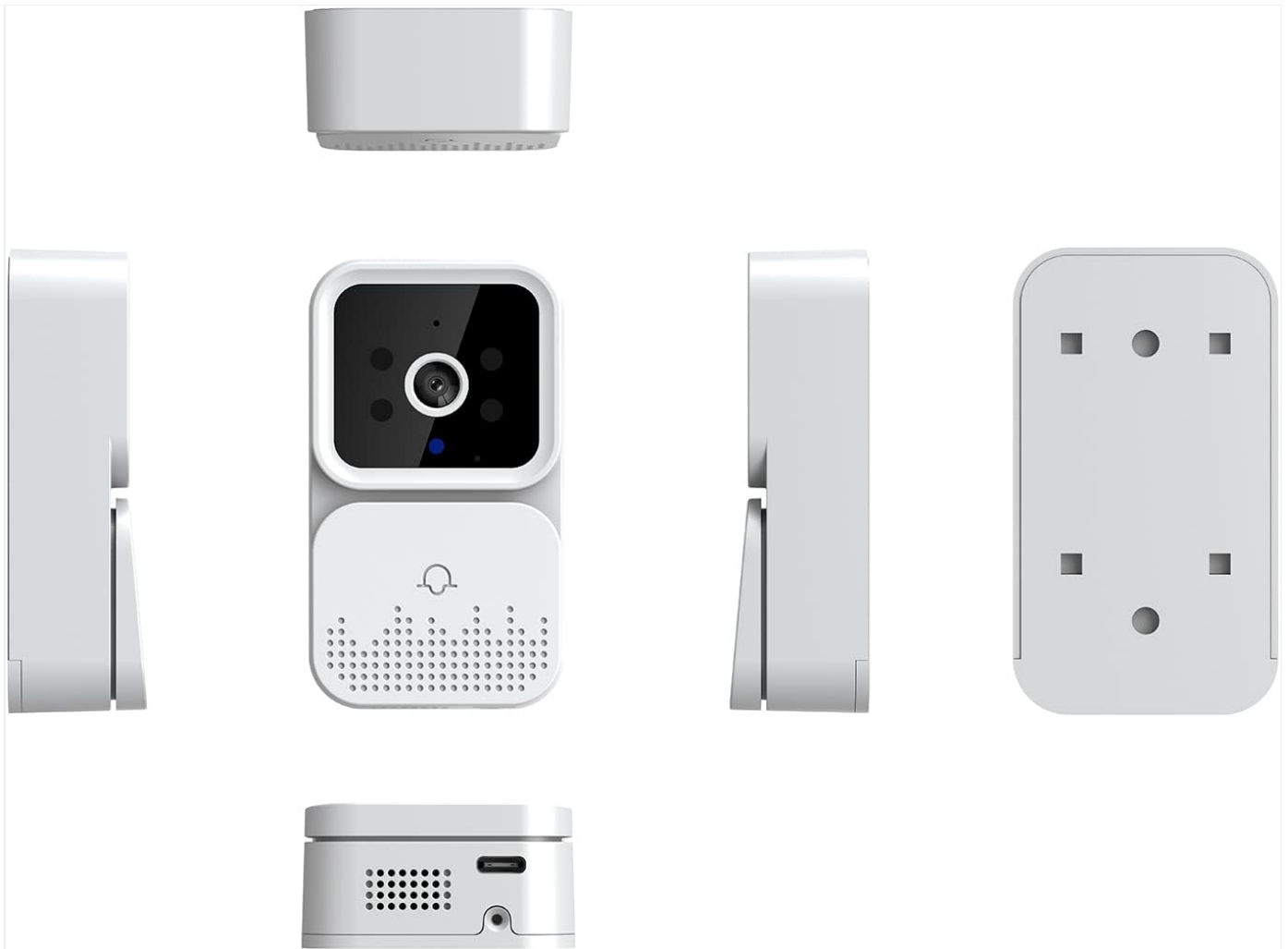
Image: Various angles of the doorbell and chime units, illustrating their design and components.