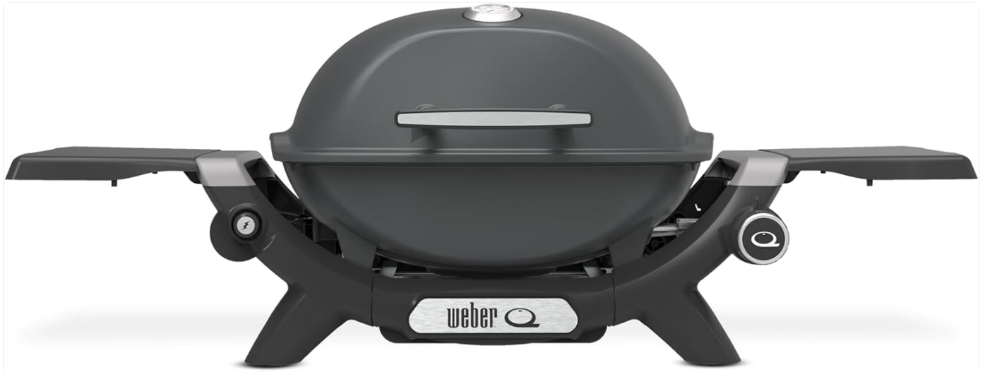
Image: Front view of the Weber Baby Q Premium Gas BBQ (Q1200N) in Charcoal Grey, showcasing its compact design with the lid closed and side tables extended.