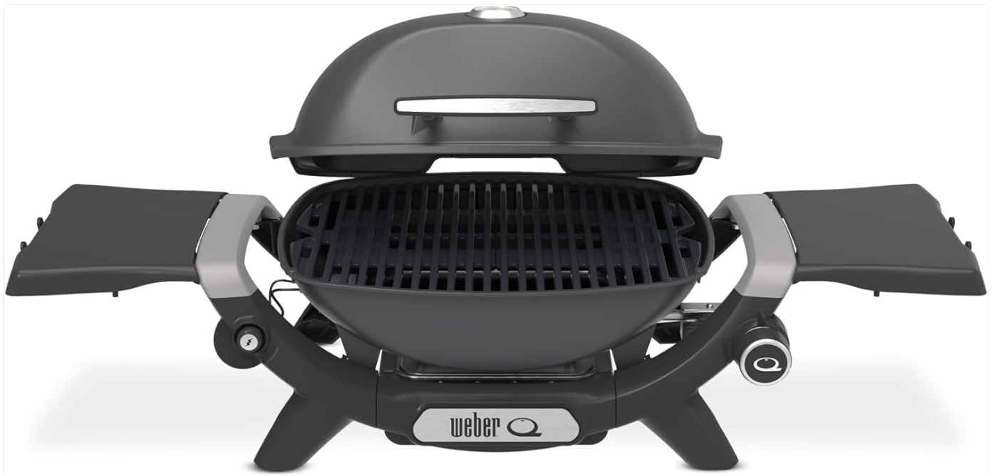
Image: A close-up view of the Weber Baby Q Premium Gas BBQ (Q1200N) with the lid open, focusing on the cooking grates and burner.