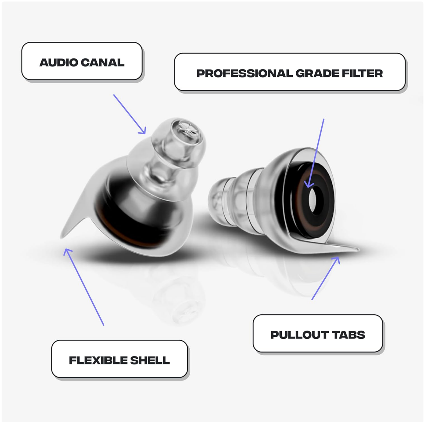
Image: Detailed diagram of Zound earplug components.

6. Check Fit: Gently tug on the earplug. It should resist coming out easily, indicating a proper seal. If it feels loose, re-insert.