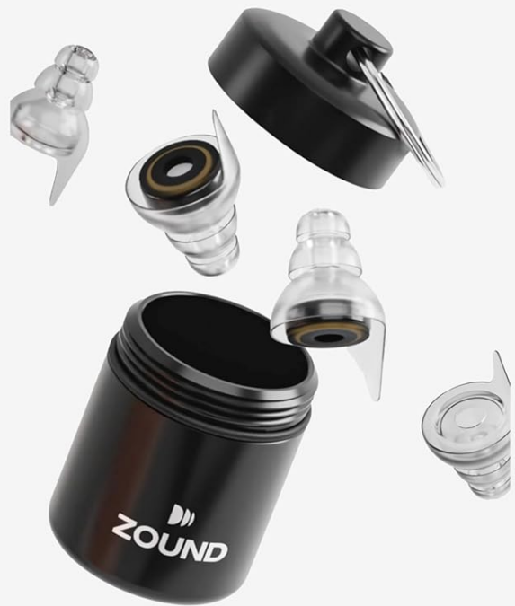
Image: All included components of the Zound earplugs package.