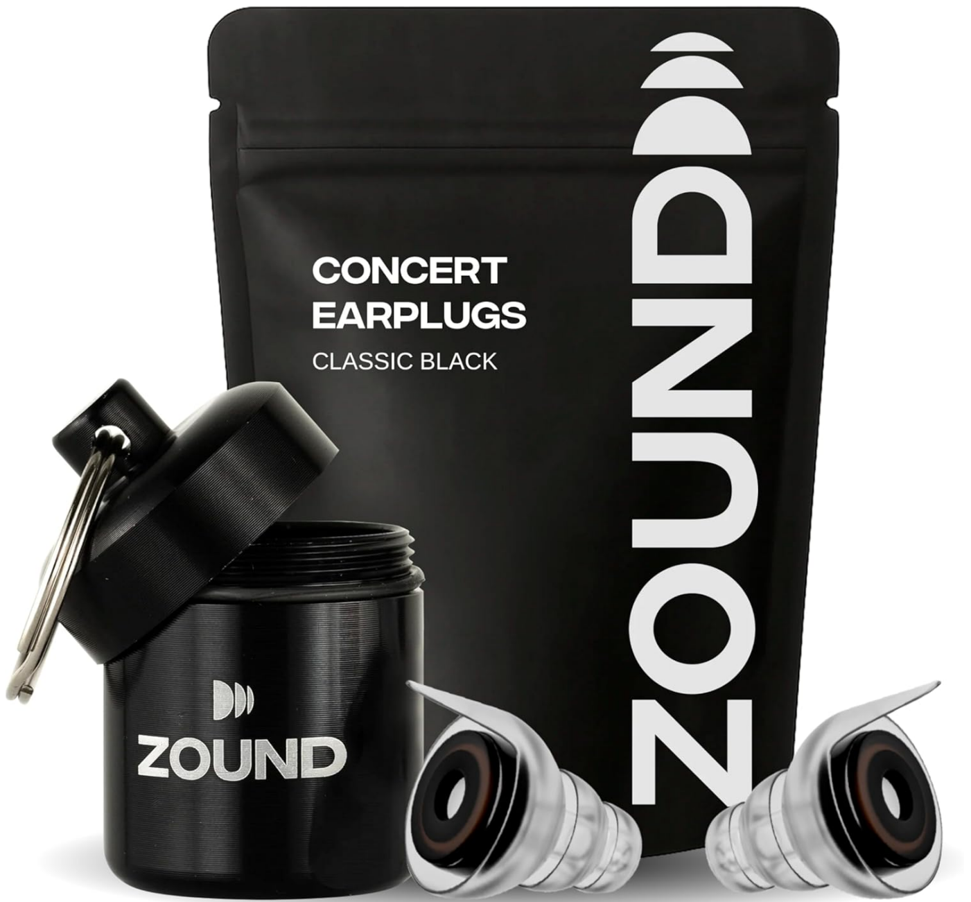
Image: Zound High Fidelity Earplugs with their protective case and packaging.