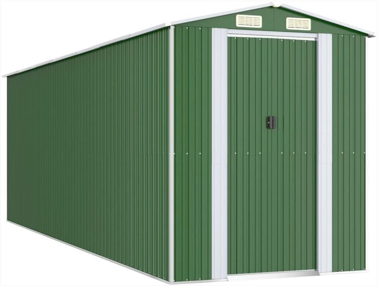
Image 1: The vidaXL Galvanized Steel Garden Shed in its closed state, showcasing its green corrugated metal panels and white trim.