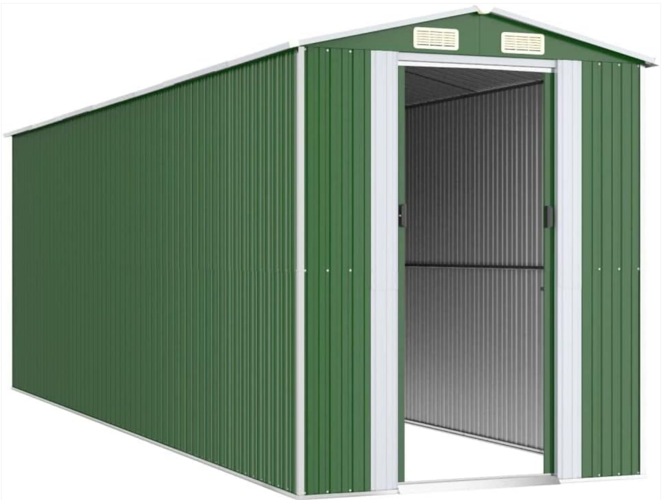
Image 2: The garden shed with one of its double sliding doors partially open, revealing the interior space.