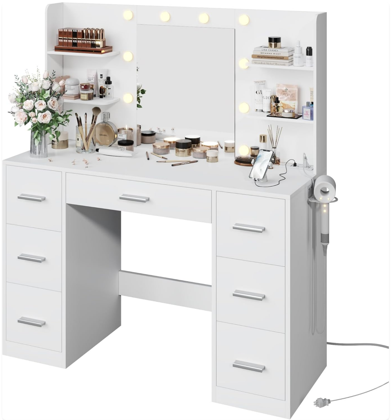
Figure 8: The convenient hair dryer holder attached to the side of the vanity.