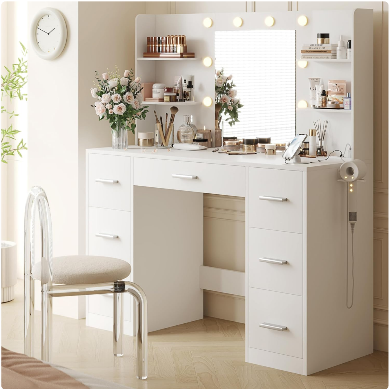
Figure 1: Overview of the YESHOMY Vanity Desk.