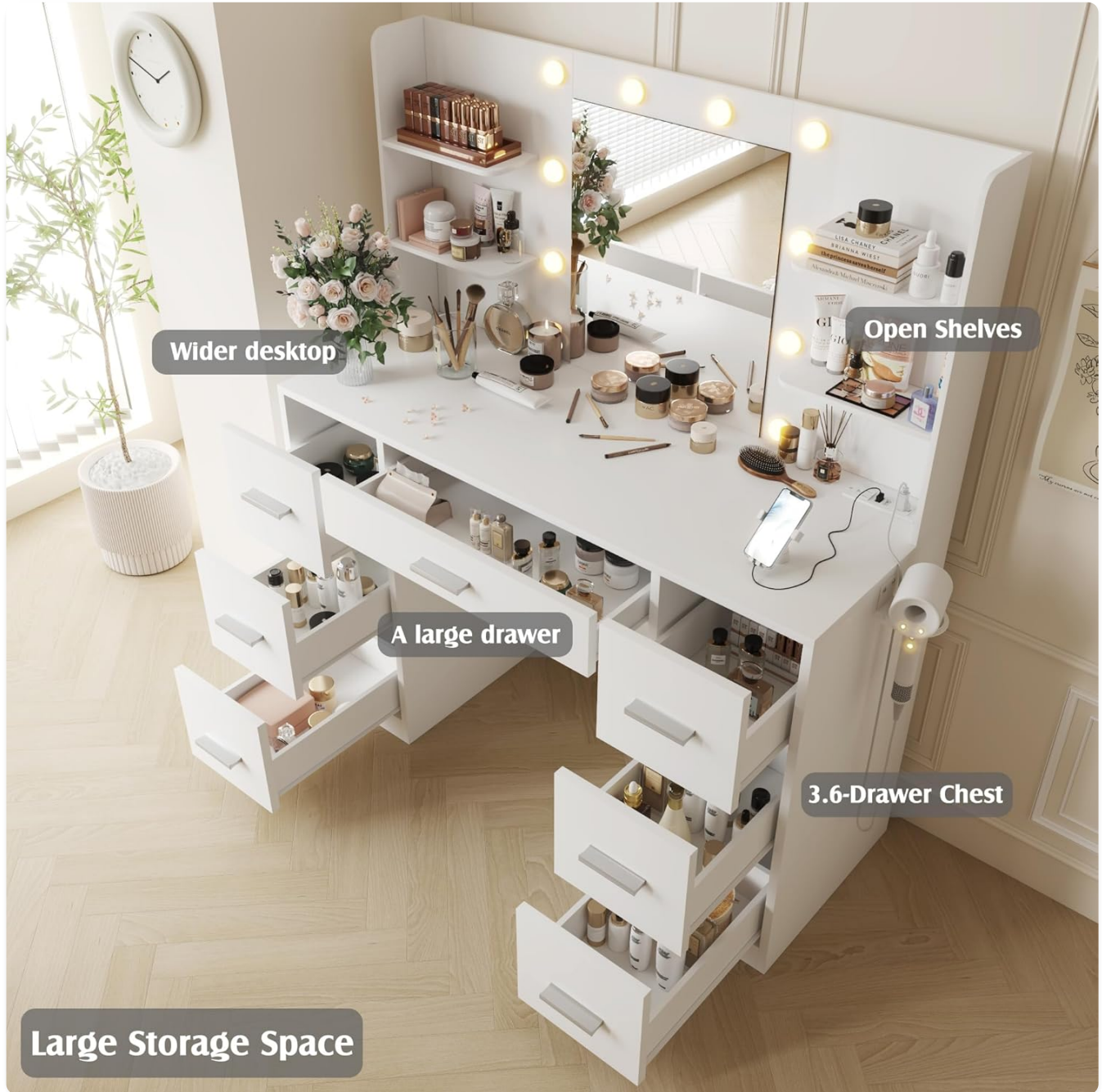
Figure 3: Side view of the vanity desk, showing cabinet structure.

Begin assembling the main frame of the side cabinets, including the base and vertical supports. This involves multiple sub-steps as shown in the video.