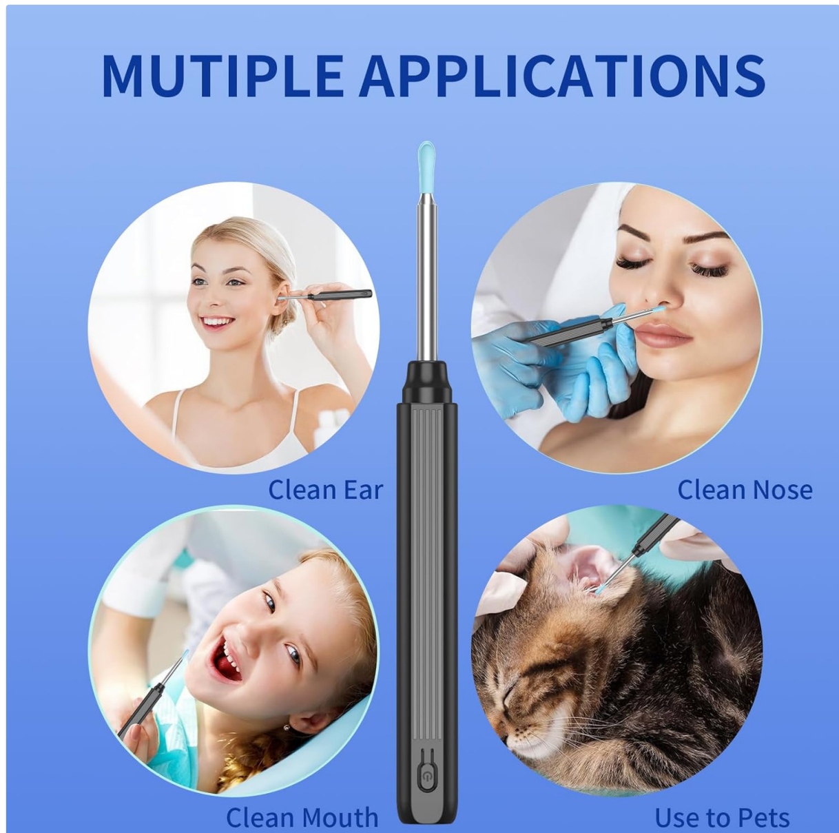
Figure 9.1: Examples of multiple applications for the ear camera, including cleaning ears, nose, mouth, and use with pets. While versatile, always prioritize safety and hygiene for each application.