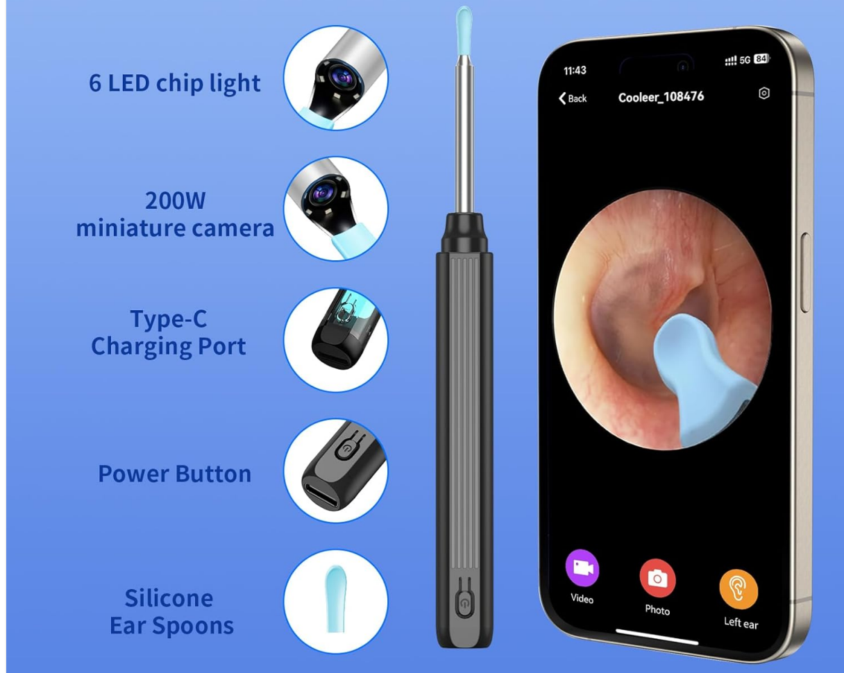
Figure 3.1: Detailed view of the wireless ear cleaner components, including the 6 LED chip light, 200W miniature camera, Type-C Charging Port, Power Button, and Silicone Ear Spoons.