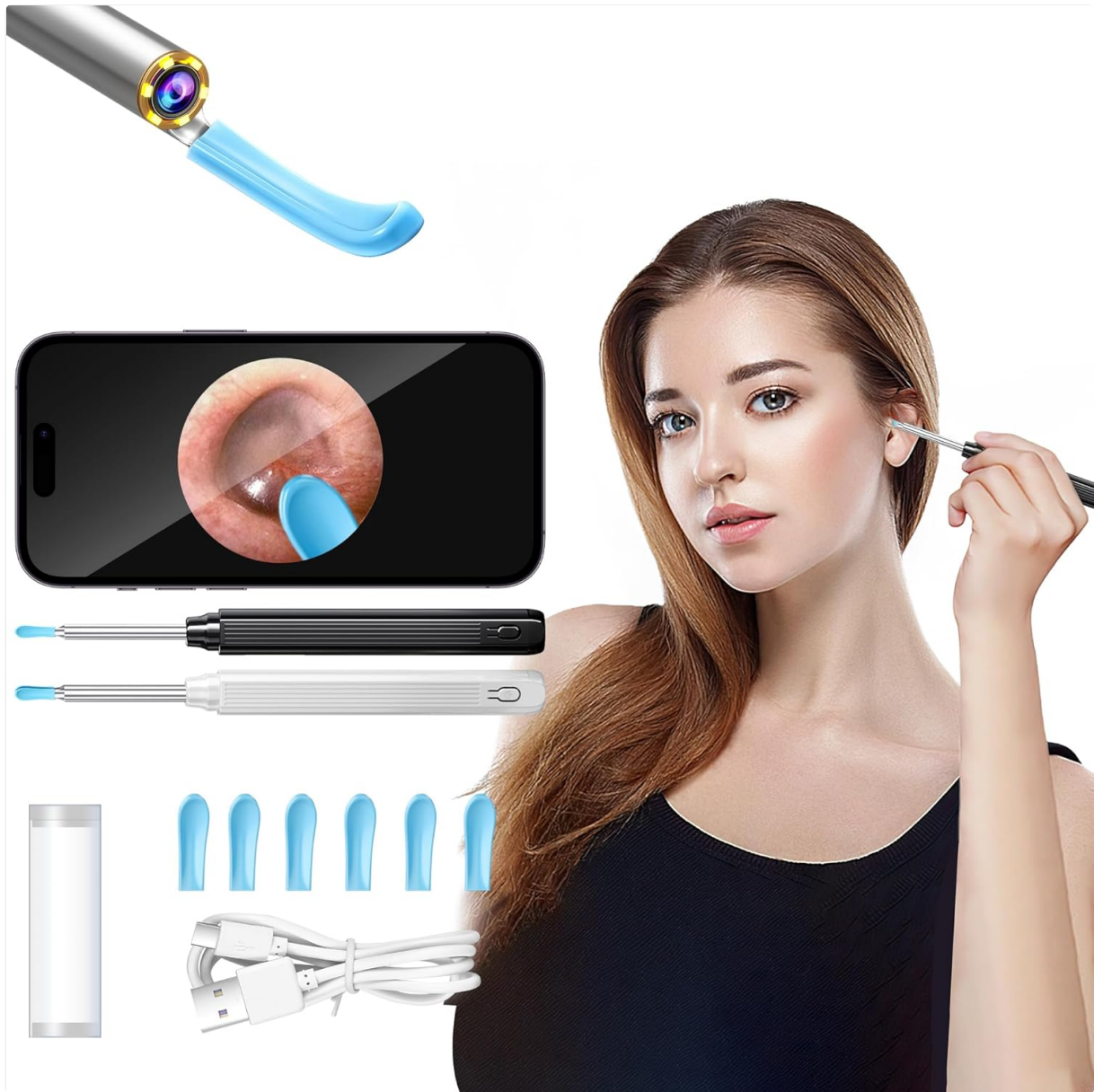
Figure 1.1: ERYITRDK Ear Wax Removal Tool with Camera and included accessories. This image displays the main device, various silicone covers, and charging cable, alongside a smartphone screen showing the ear canal view.