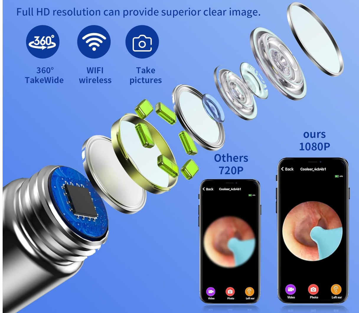
Figure 2.1: Illustration of the 1080P HD Ear Camera's capabilities, highlighting 360° TakeWide view, WiFi wireless connection, and photo capture functions. It also compares the clarity of 1080P resolution to 720P.

Full HD resolution can provide superior clear image.