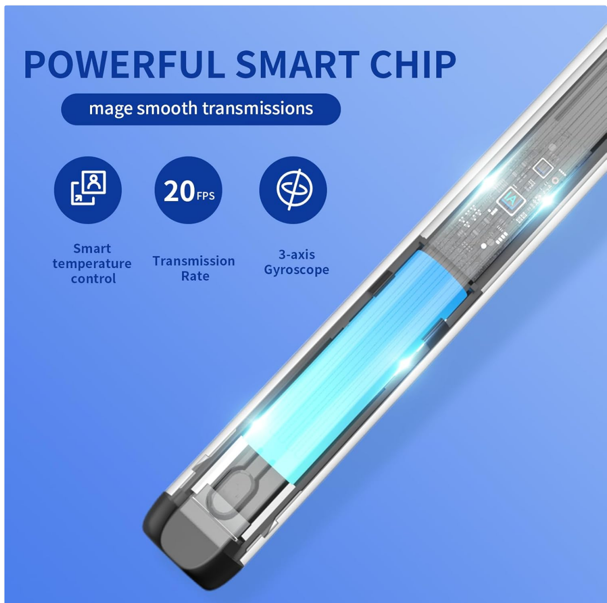
Figure 8.1: Diagram illustrating the internal "Powerful Smart Chip" with features such as smart temperature control, 20 FPS transmission rate, and a 3-axis gyroscope for stable operation.