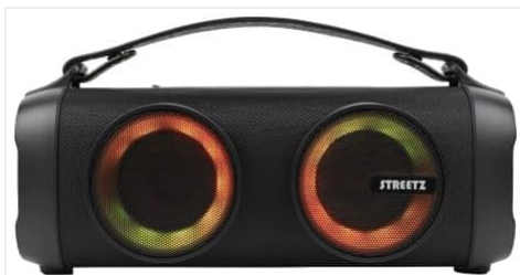
Figure 3: Direct front view of the speaker, showcasing the vibrant illumination of the speaker grilles.