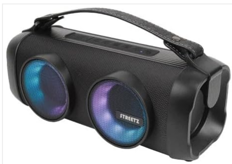
Figure 2: Angled view of the speaker, highlighting its robust, textured casing and portable design.