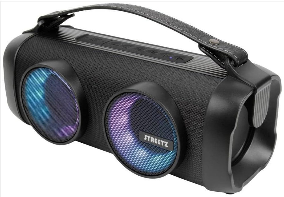
Figure 1: Front-side view of the STREETZ CMB-100 Bluetooth Speaker, showing the integrated handle and the two main speaker grilles with dynamic lighting.