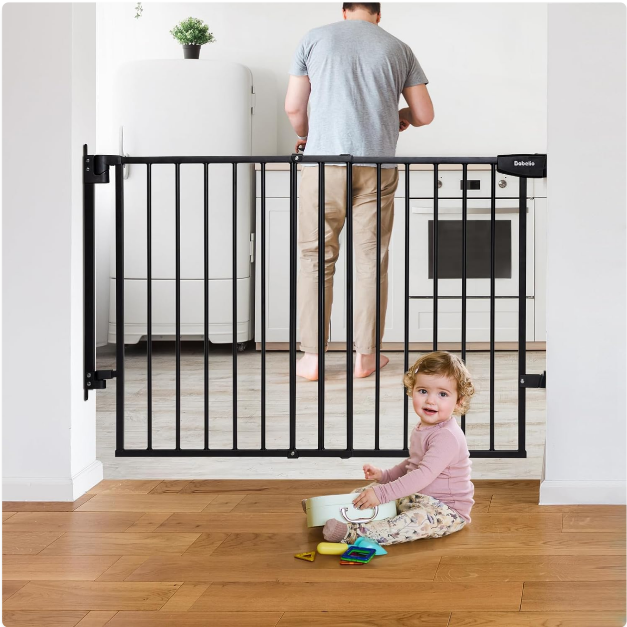
The Babelio No Bottom Bar Baby/Dog Gate providing a safe space for your child.