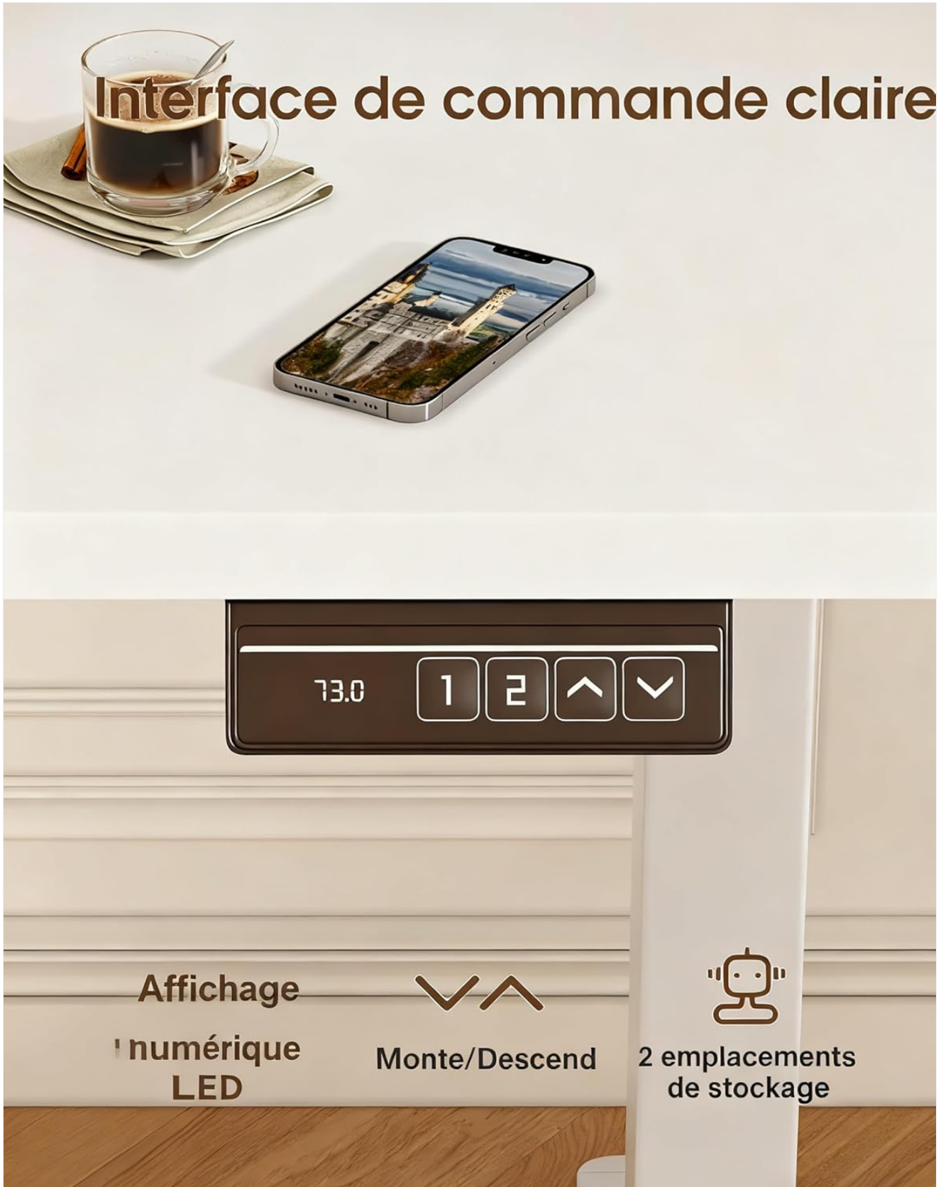
Image 5.1: Close-up of the desk's control panel, showing the LED height display, up/down arrows, and two memory preset buttons.