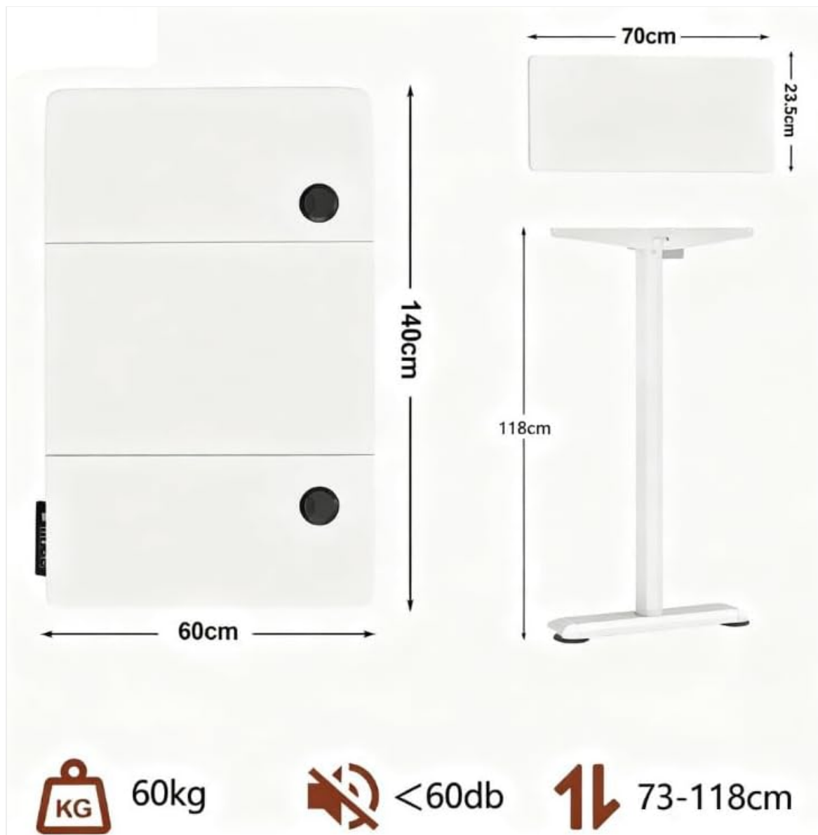
Image 4.1: Diagram illustrating the dimensions of the desk components, including the 140cm x 60cm desktop and the height-adjustable frame.