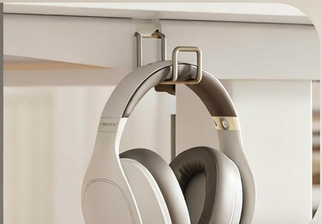
Image 5.3: Visual representation of the desk's special features, including cable management grommets, rounded corners for safety, and an integrated hook for accessories.