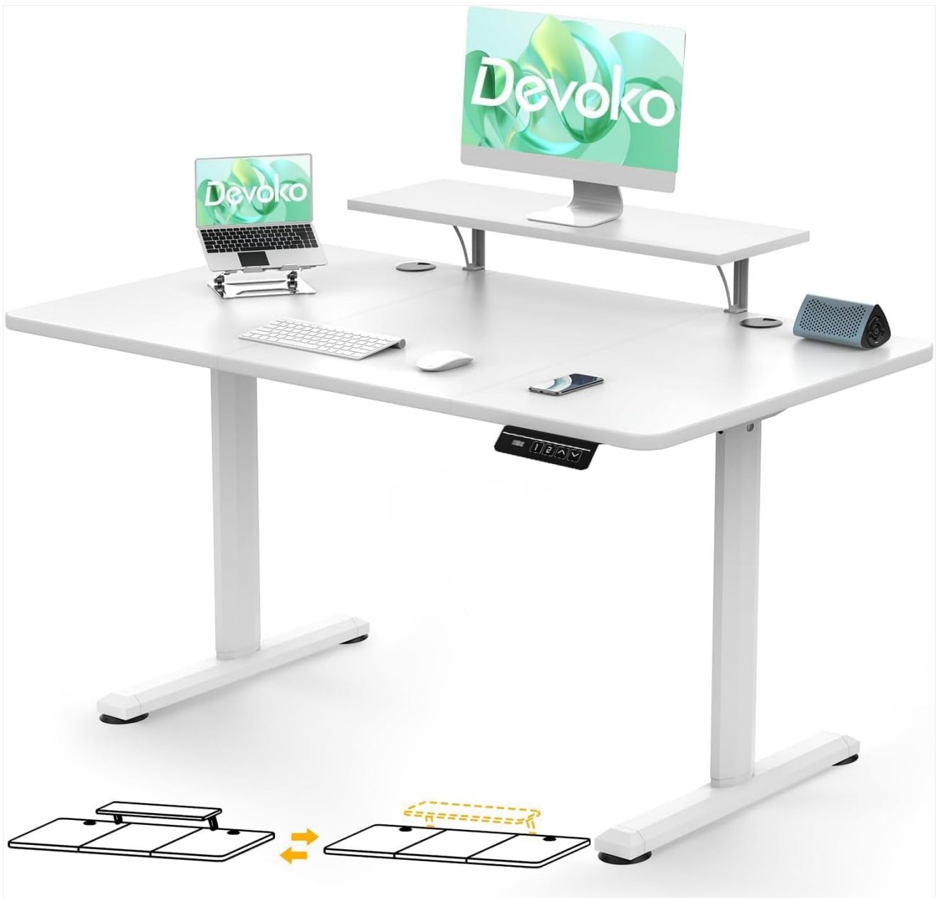
Image 3.1: Fully assembled Devoko Electric Standing Desk with monitor support, laptop, and accessories.