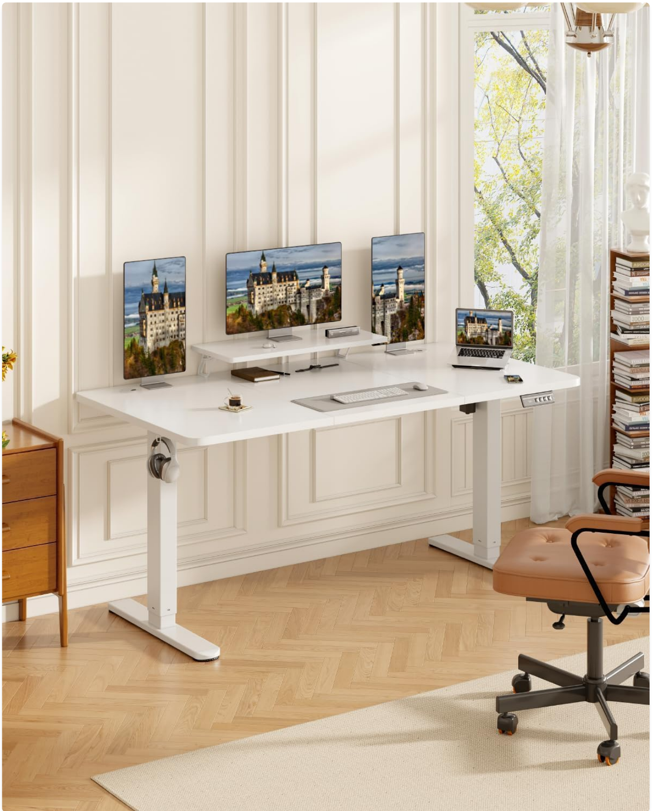
Image 1: The Devoko 120x60cm Electric Standing Desk in a typical setup, showcasing its spacious design and monitor support.