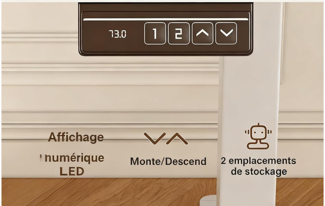
Image 3: The desk's control panel, featuring an LED display for current height, up/down adjustment buttons, and two memory preset buttons.