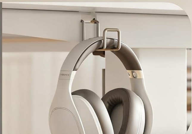
Image 2: Integrated design features such as cable management, rounded corners, and a convenient hook for headphones or bags.