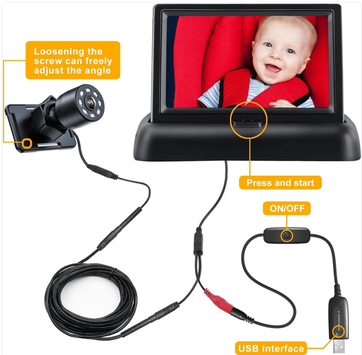
Image: Overview of the Itomoro Baby Car Monitor components, including the camera, monitor, and cables.