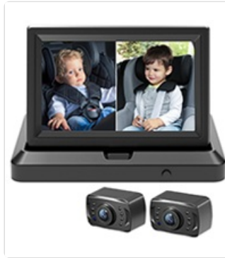
Image: Depiction of the wide-angle lens providing a broad view of the rear seat, capturing more of the child's surroundings.

Image: Illustration of the camera's 360-degree rotation capability for flexible viewing angles.