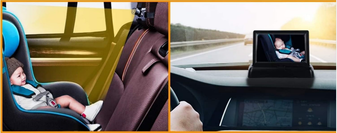
Image: The monitor unit placed securely on the vehicle's center console/dashboard, showing a clear view of the baby in the rear-facing car seat.