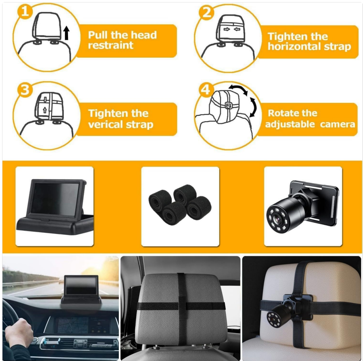
Image: Step-by-step guide for attaching the camera to the headrest using the adjustable straps.