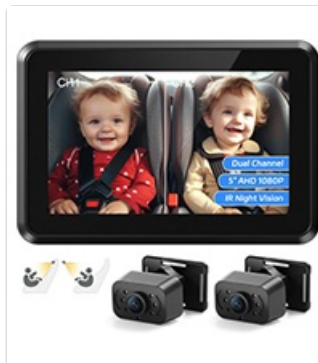
Image: A comparison showing the clear visibility of the child in the car seat during nighttime conditions, thanks to the night vision feature.