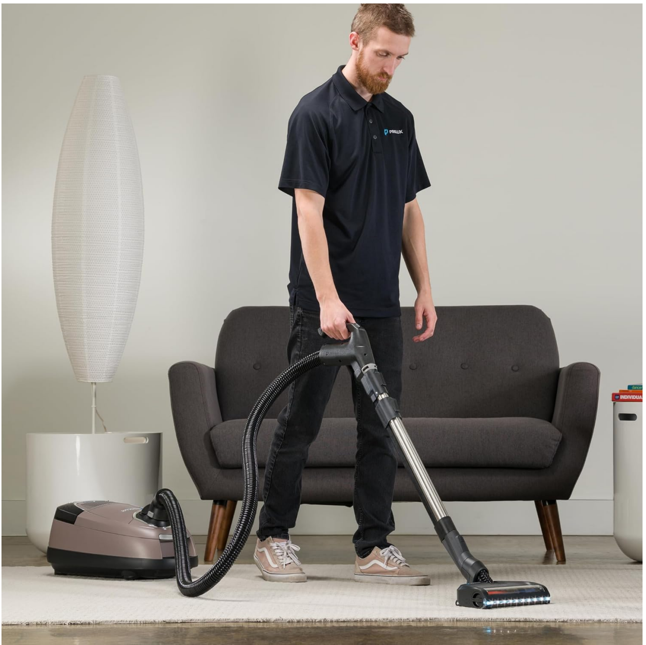
Image 3.1: A person demonstrating the assembly and use of the Prolux QX60 vacuum cleaner, showing the connection of the hose, wand, and power nozzle.