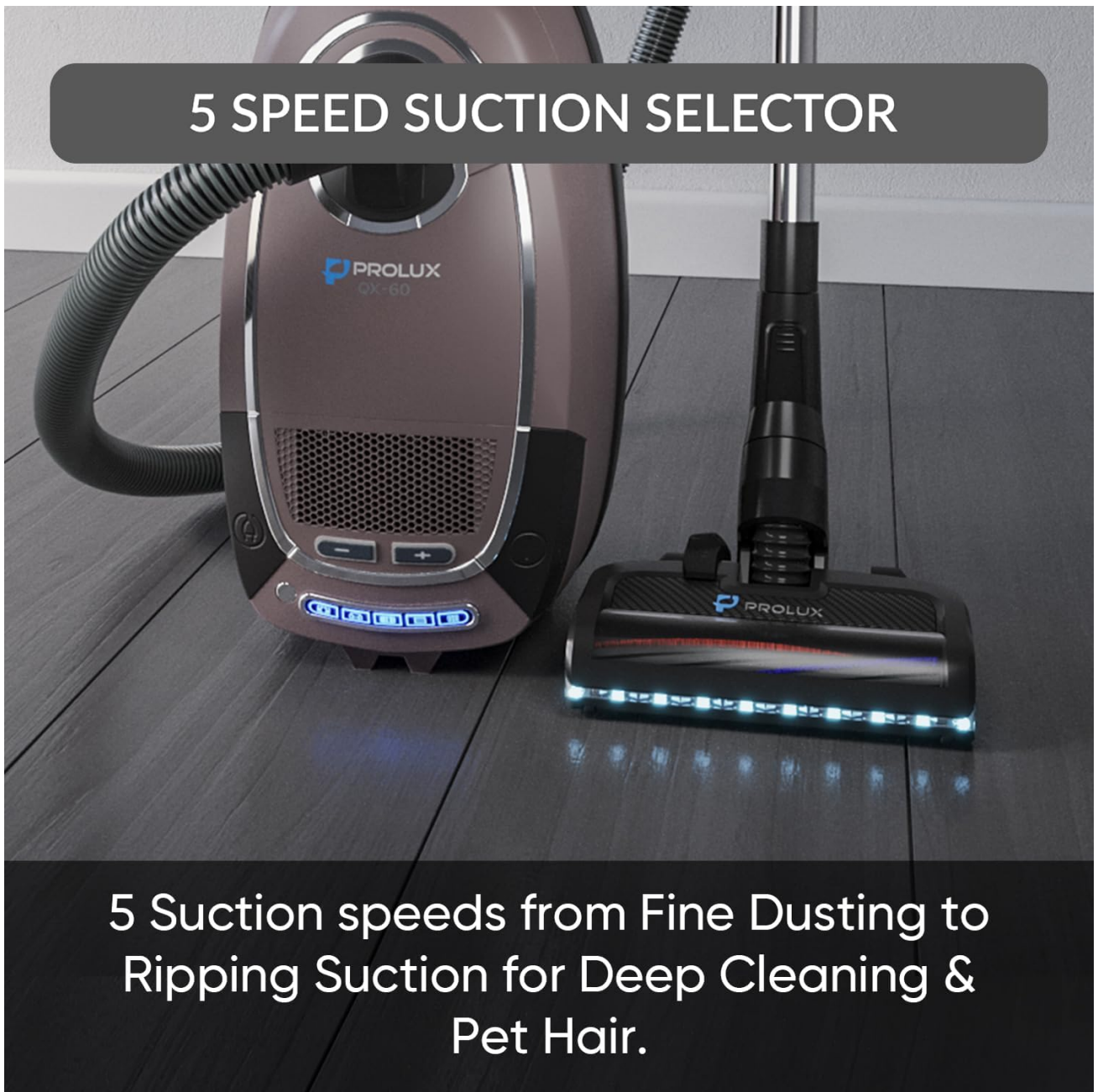
Image 4.1: A close-up of the Prolux QX60 canister unit, highlighting the 5-speed suction selector buttons and indicator lights.