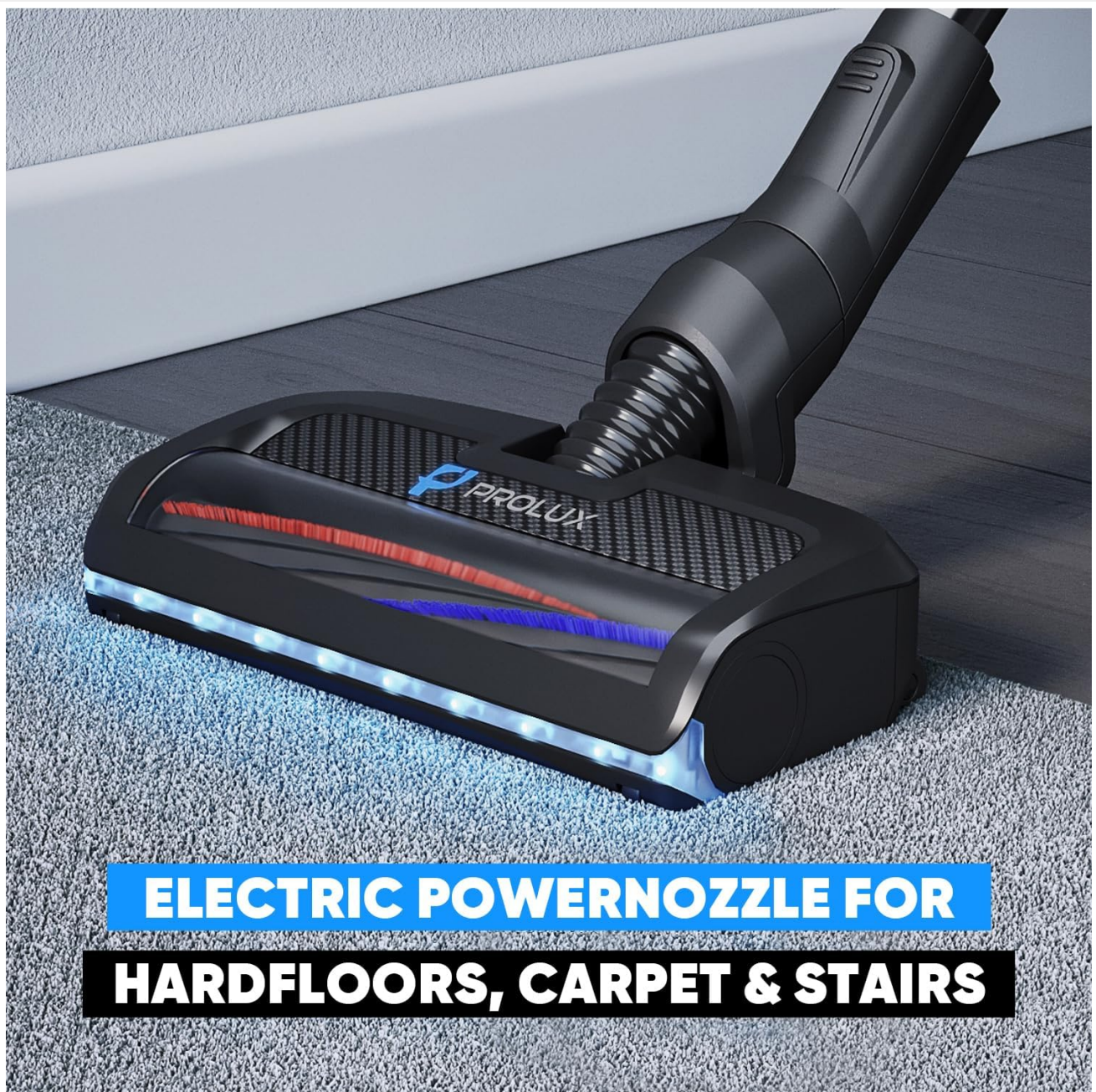
Image 4.2: A detailed view of the Prolux QX60 power nozzle, showcasing its LED lights illuminating the cleaning path on a carpeted surface.