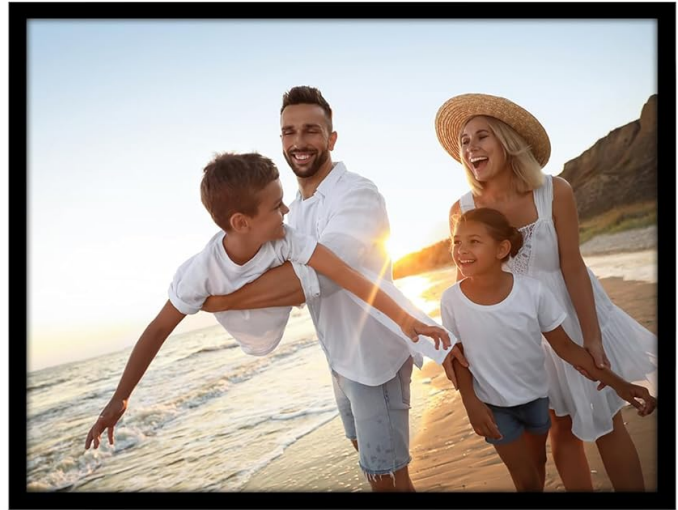
Image: Two examples demonstrating the frame's ability to be used for both horizontal and vertical display.