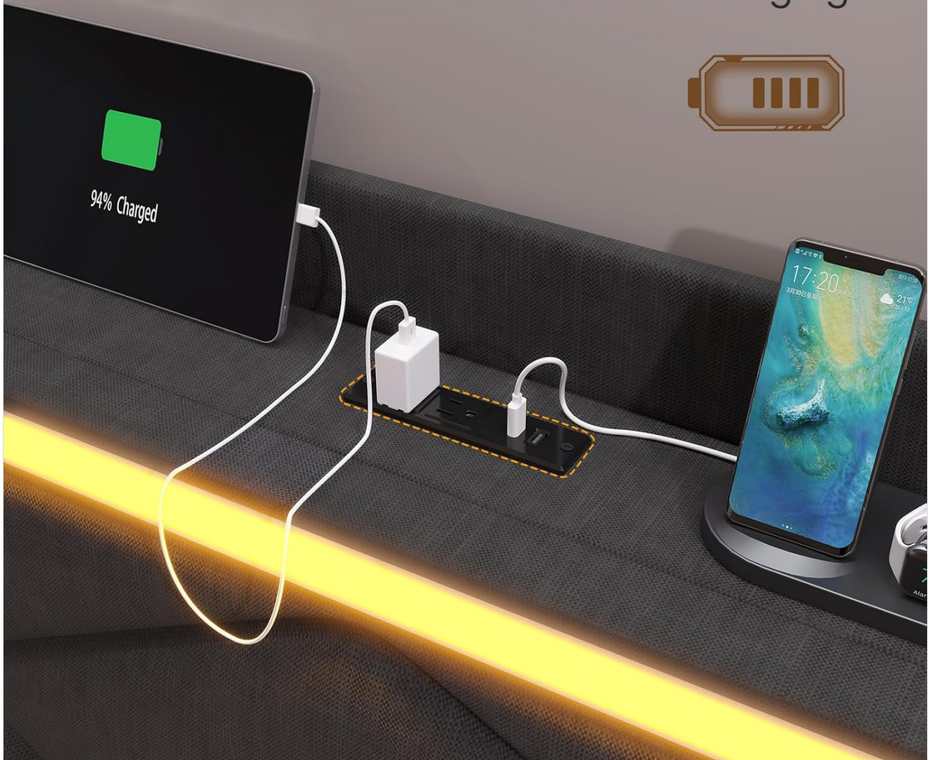
Image 5.2: A close-up view of the headboard's integrated 4-in-1 power combo, with a tablet and smartphone connected for charging.