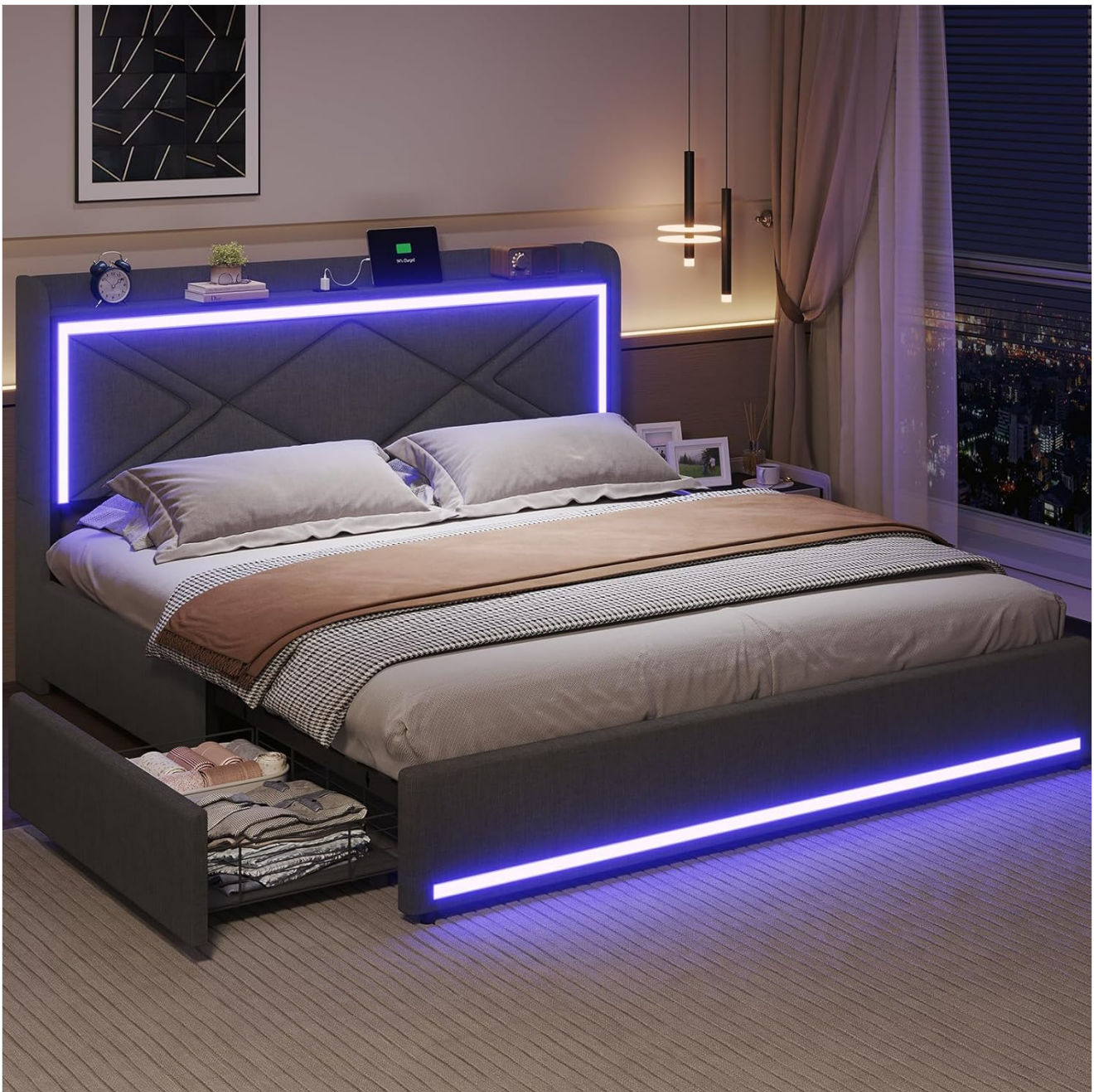
Image 1.1: The BTHFST Full Bed Frame with its integrated RGB LED lighting set to blue, showcasing an open underbed storage drawer.