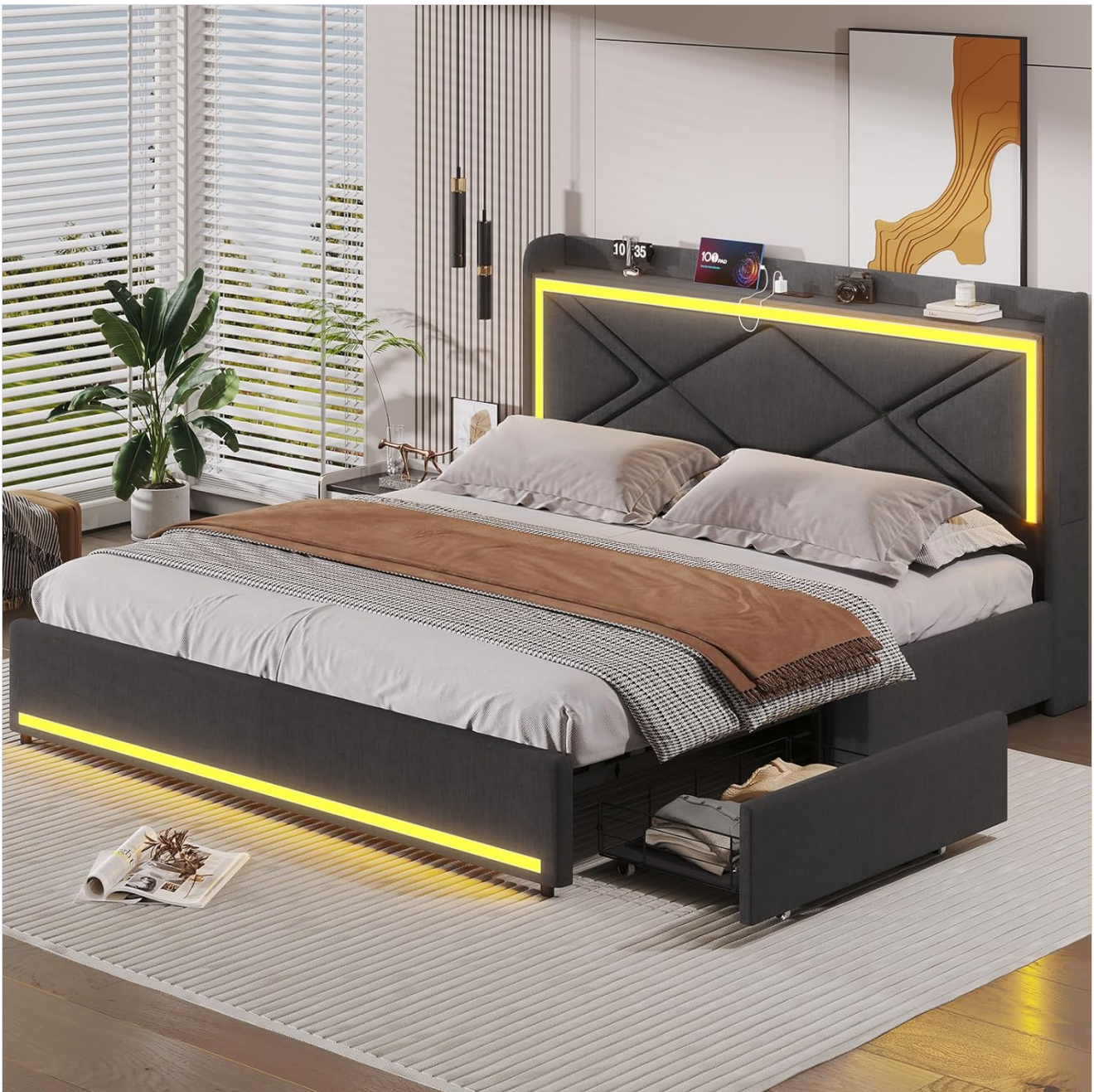
Image 5.1: The BTHFST Full Bed Frame illuminated with yellow LED lights, demonstrating the ambient lighting feature.