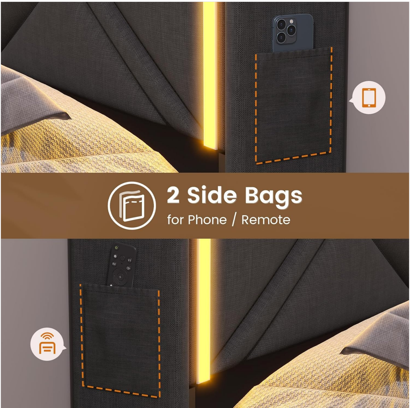
Image 5.4: Detail of the two side bags located on the headboard, designed to hold a phone and a remote control for easy access.