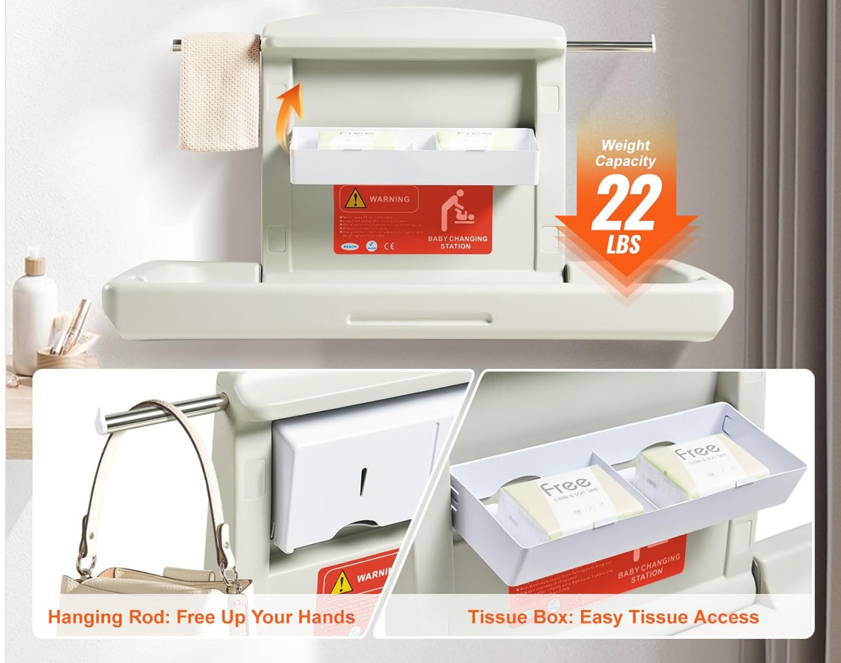
Image: Features including hanging rods and storage compartments.