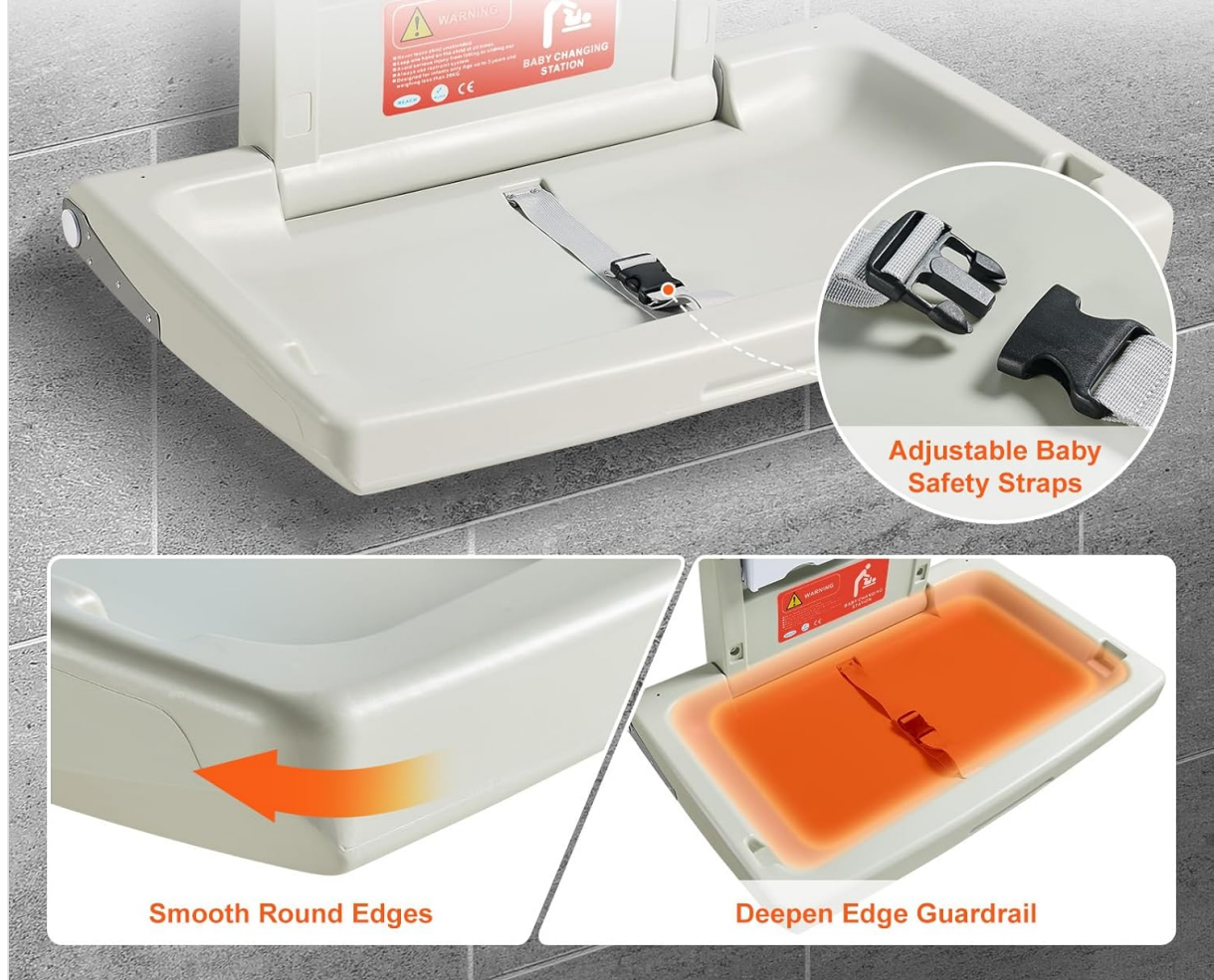
Image: Detail of the adjustable safety belt and smooth edges.