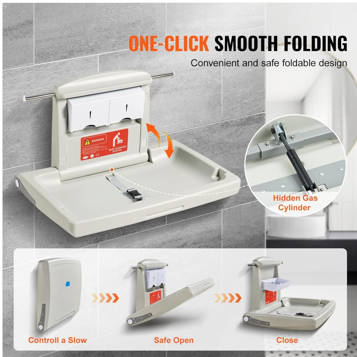
Image: Demonstration of the smooth folding mechanism with a hidden gas cylinder.