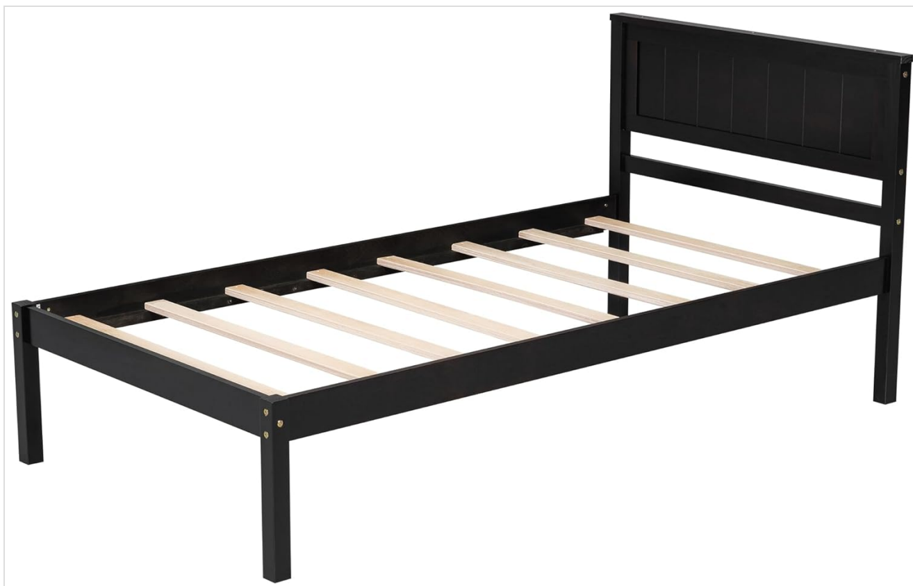
Figure 4.1: Fully assembled Merax Twin Size Wood Platform Bed Frame.