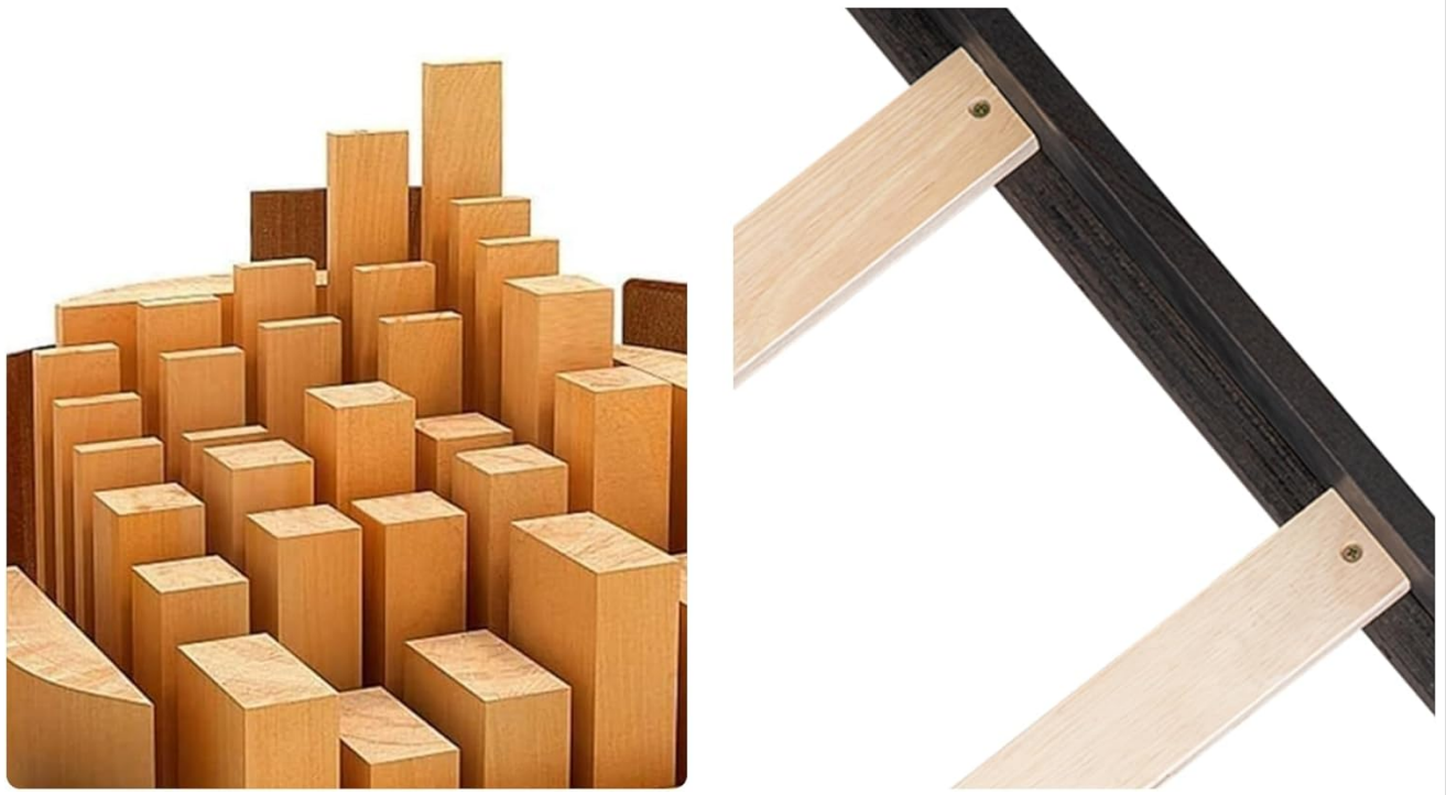
Figure 5.2: Illustration of the strong wooden construction and noise-free design.