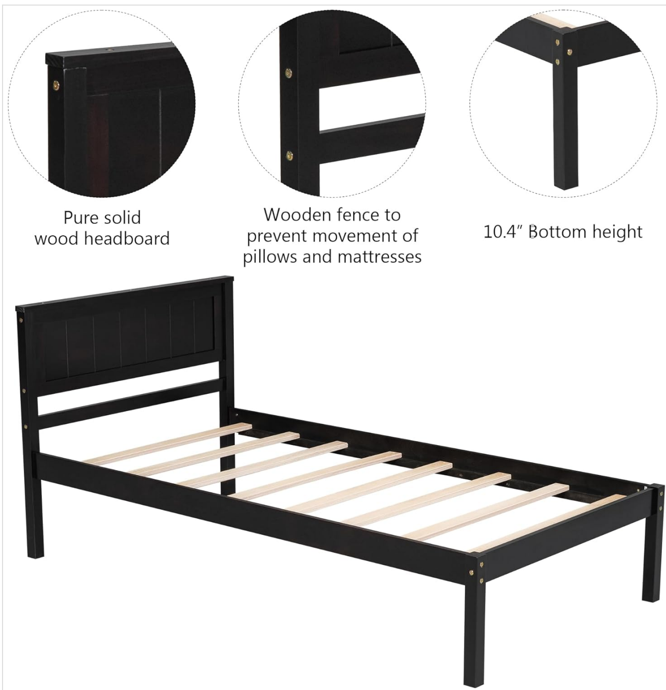
Figure 5.1: Detailed view of headboard, wooden fence, and bottom height features.