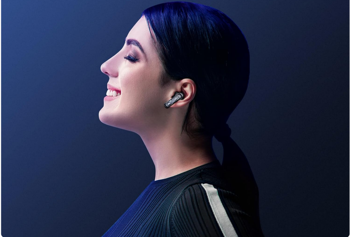
Image: Image depicting the lightweight design of the earbuds in an ear.

Each earbud weighs only 3.9 grams, making it more comfortable and secure to wear.