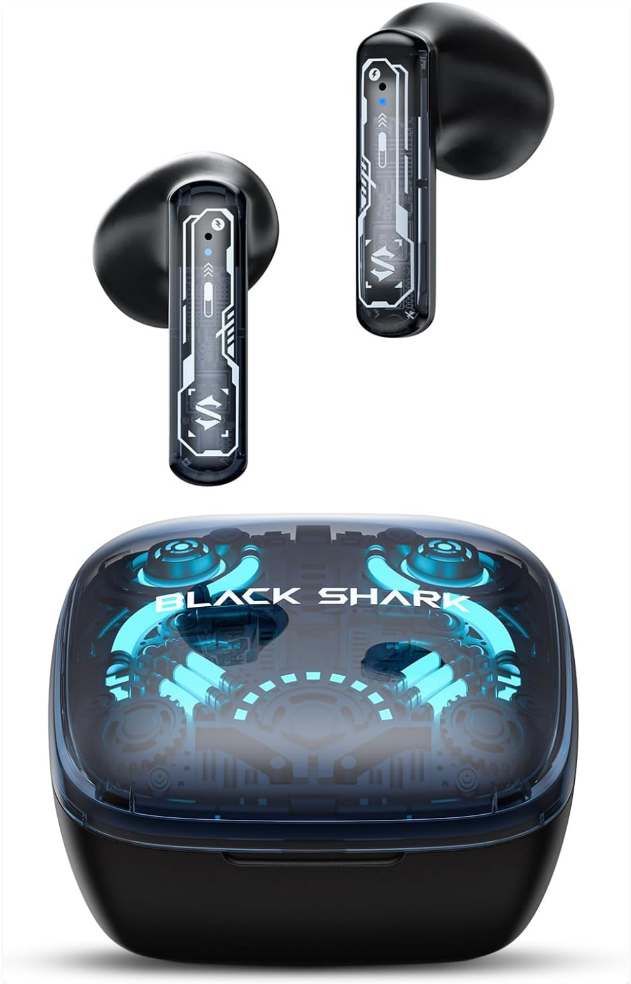
Image: Black Shark Lucifer T15 Earbuds and Charging Case.