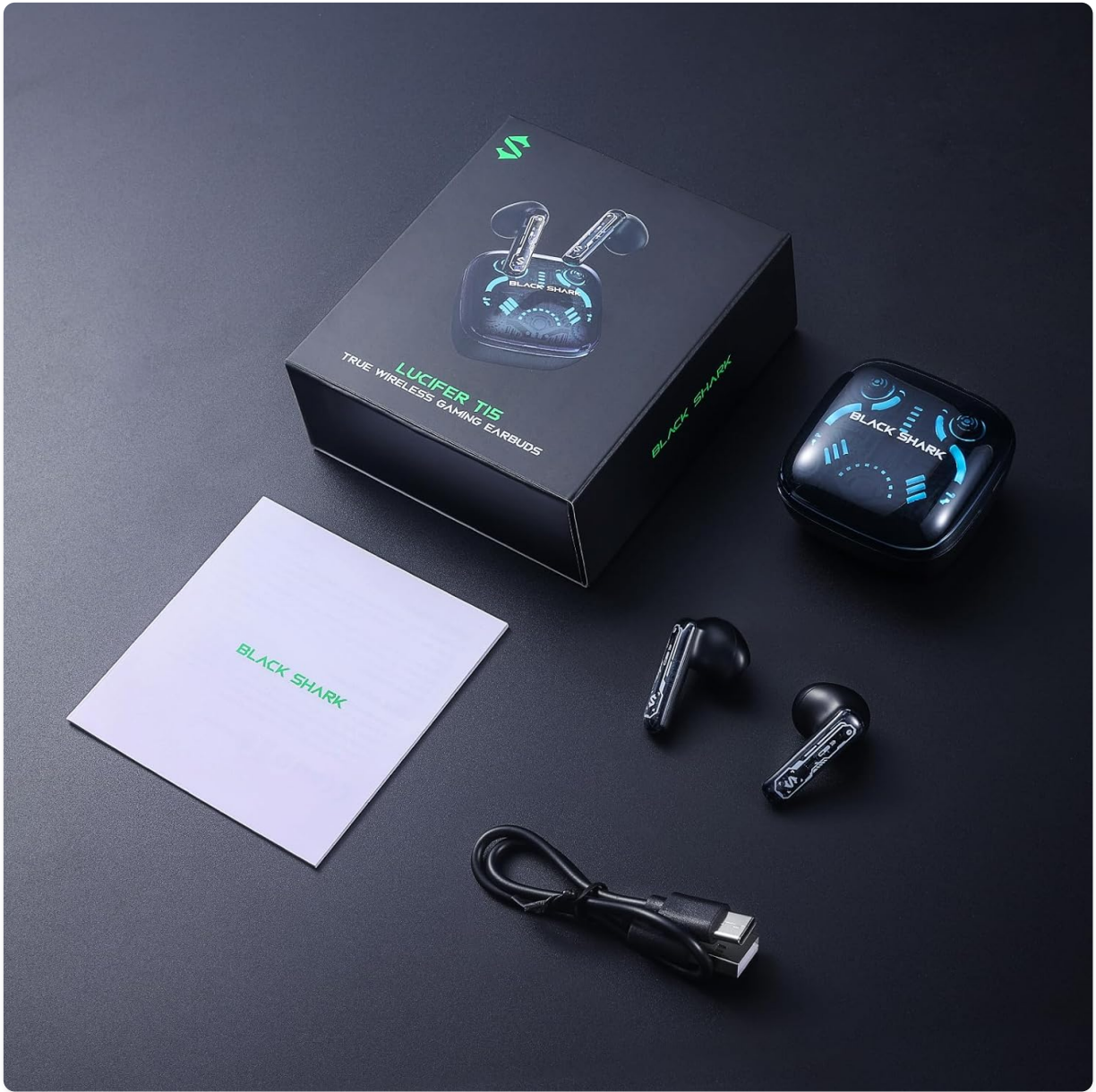
Image: All items included in the Black Shark Lucifer T15 package.