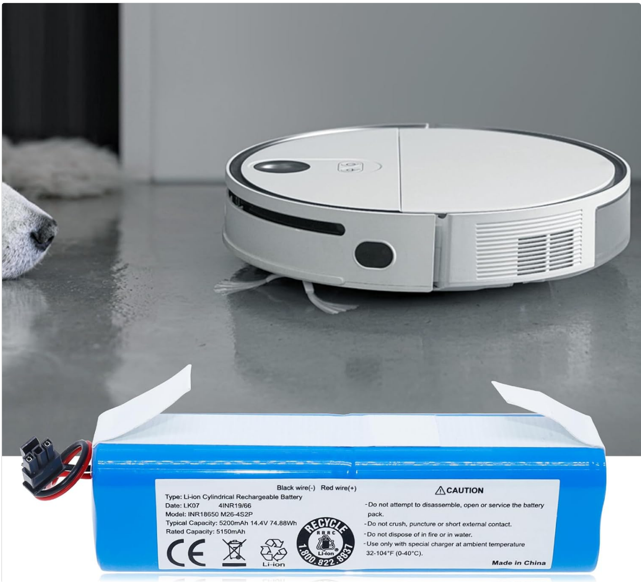
Image: The Fanhua replacement battery positioned alongside an Eufy RoboVac X8, demonstrating the product's intended use.