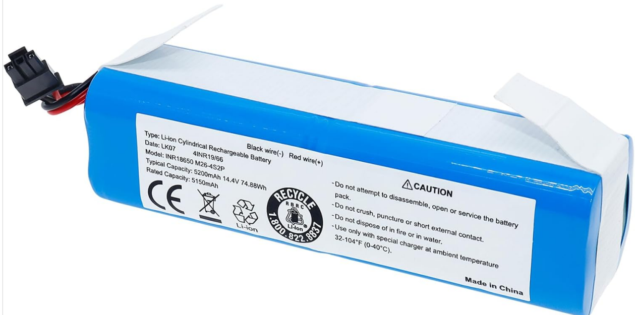
Image: The Fanhua replacement battery clearly labeled as compatible with Eufy RoboVac X8, X8 T226X, X8 Hybrid White, X8 Pro, and X8 Pro SES.

Eufy RoboVac X8, RoboVac X8 T226X, RoboVac X8 Hybrid White, RoboVac X8 Pro, RoboVac X8 Pro SES Robot Vacuum Part Number PA61