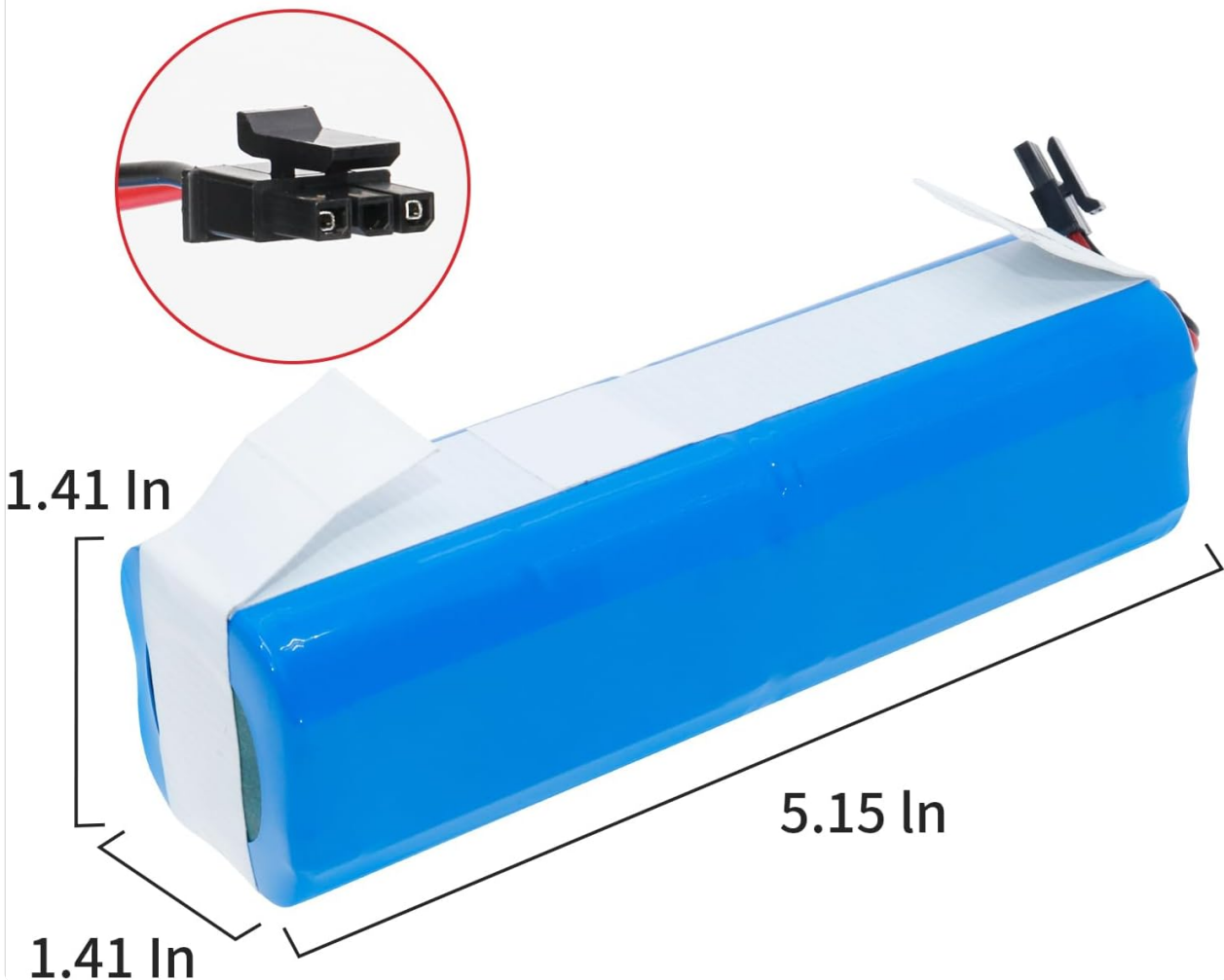
Image: The battery with its physical dimensions and connector design highlighted.