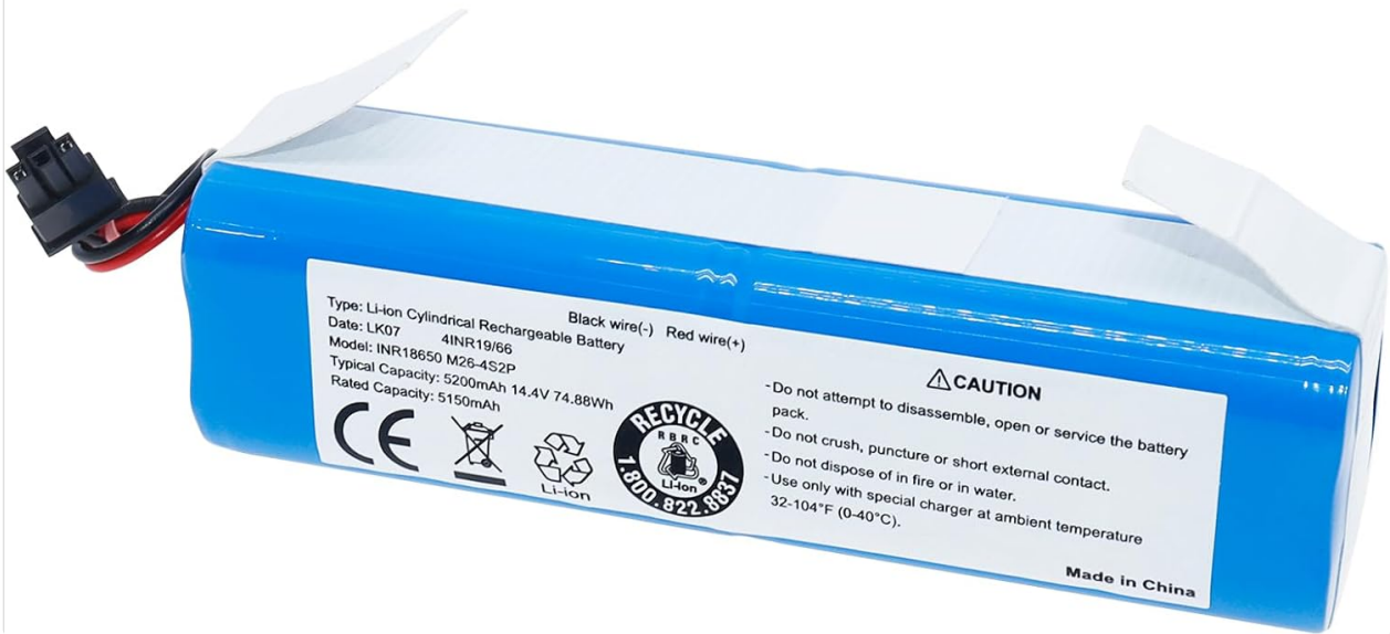
Image: The battery pack displaying its caution label with critical safety warnings.