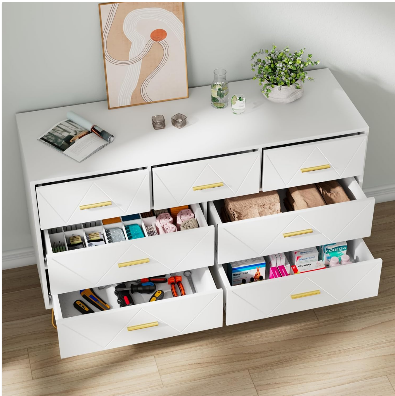
Image: Illustrates the deep and wide drawers, capable of holding a variety of items, highlighting the ample storage space.