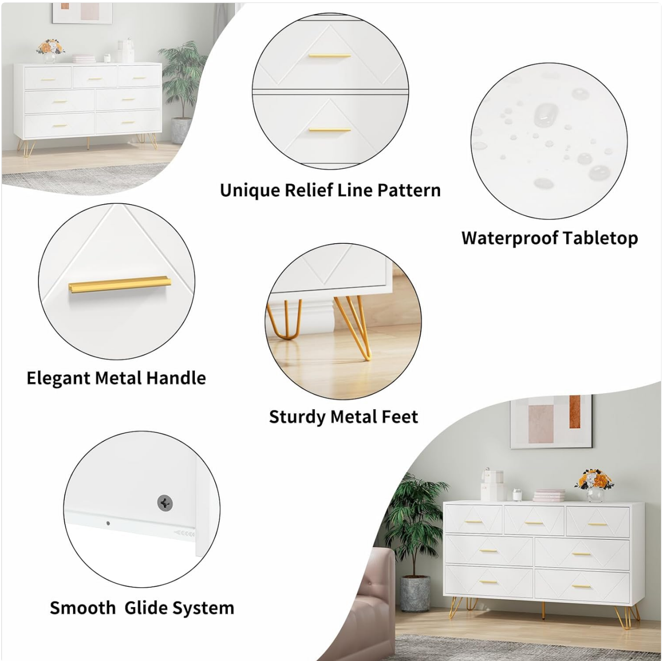
Image: Detailed view of the dresser's construction and design elements, including the unique drawer pattern, gold handles, metal feet, and the smooth drawer mechanism.