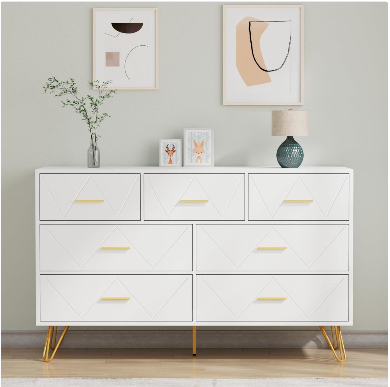
Image: The fully assembled CARPETNAL White 7-Drawer Dresser, showcasing its design and gold handles.