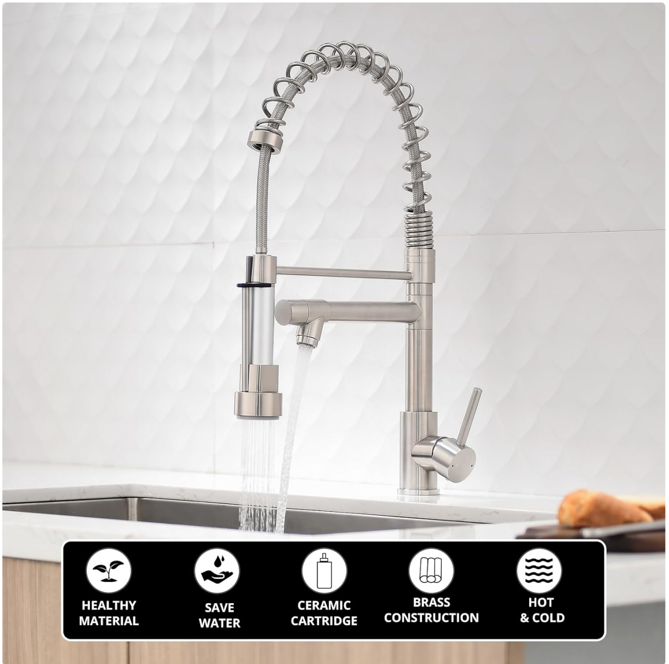
Image 3: Key features including healthy material, water saving, ceramic cartridge, brass construction, and hot/cold compatibility.