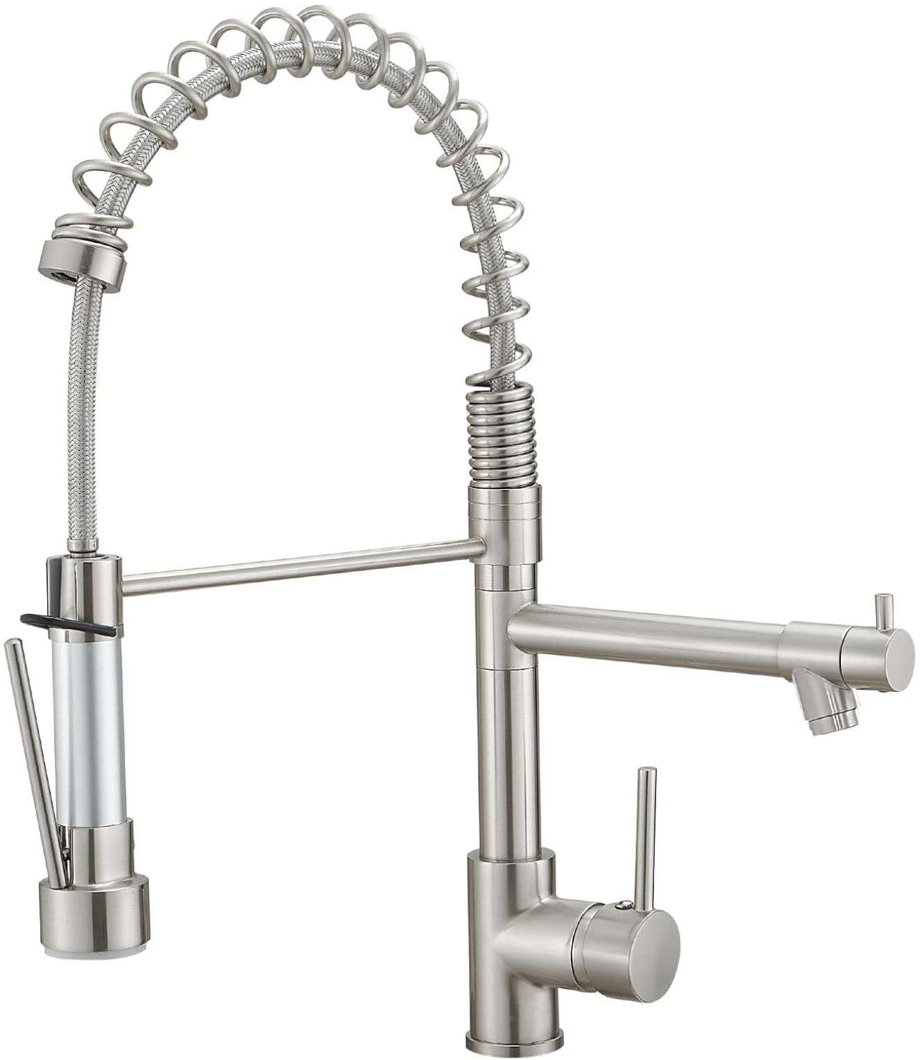
Image 1: AIMADI AM-3041N Stainless Steel Kitchen Faucet with Pull Down Sprayer.