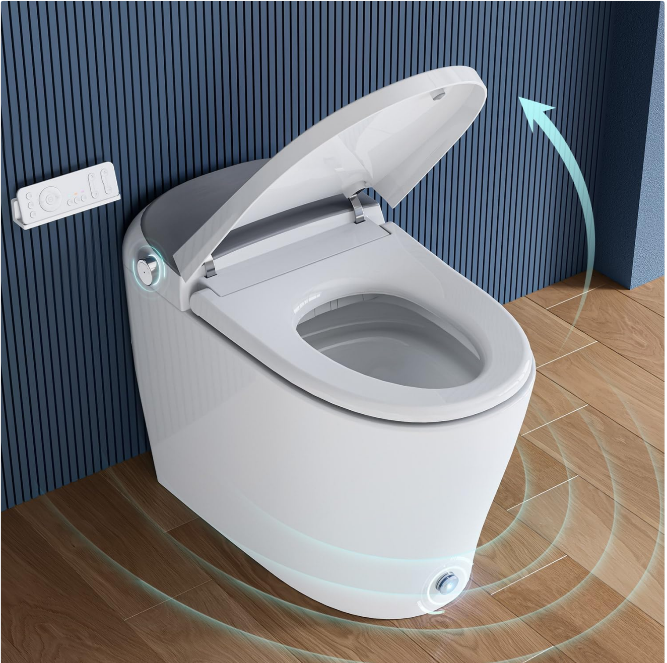
Figure 1: Uncle Brown ST03 Pro Smart Toilet. The image displays the toilet with its lid open, highlighting its modern design and the wall-mounted remote control.