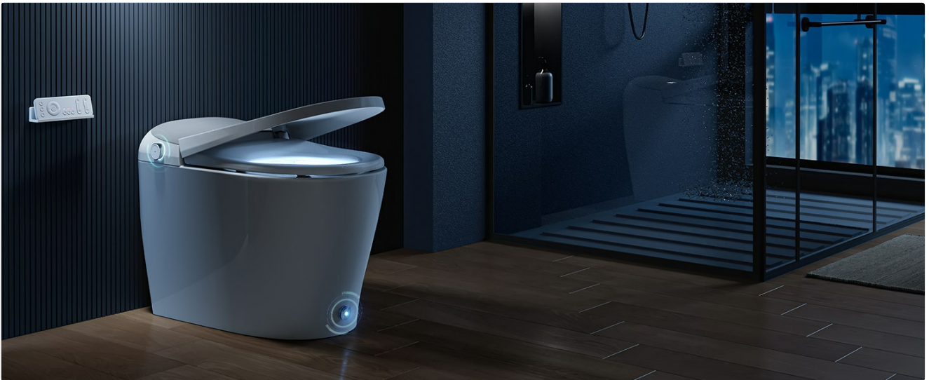
Figure 7: Night light feature. The image shows the toilet in a dimly lit bathroom, with the soft glow of the night light illuminating the bowl and floor, enhancing safety and convenience.