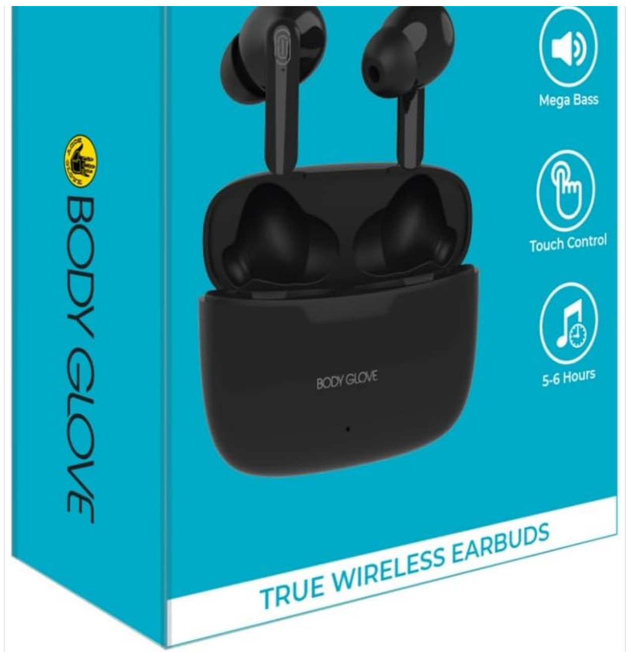
Figure 4.5: The retail packaging for the Body Glove Essentials Lux True Wireless Stereo Earbuds. The box features product images and highlights key features such as 'Mega Bass', 'Touch Control', and '5-6 Hours' playtime.