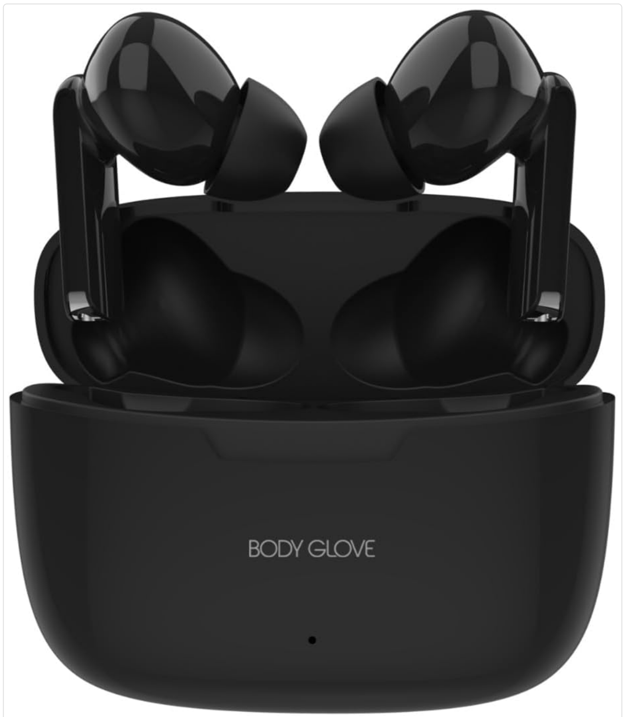
Figure 4.2: A closer front view of the Body Glove Essentials Lux Earbuds within their charging case. This angle highlights the in-ear design and the compact nature of the charging case.