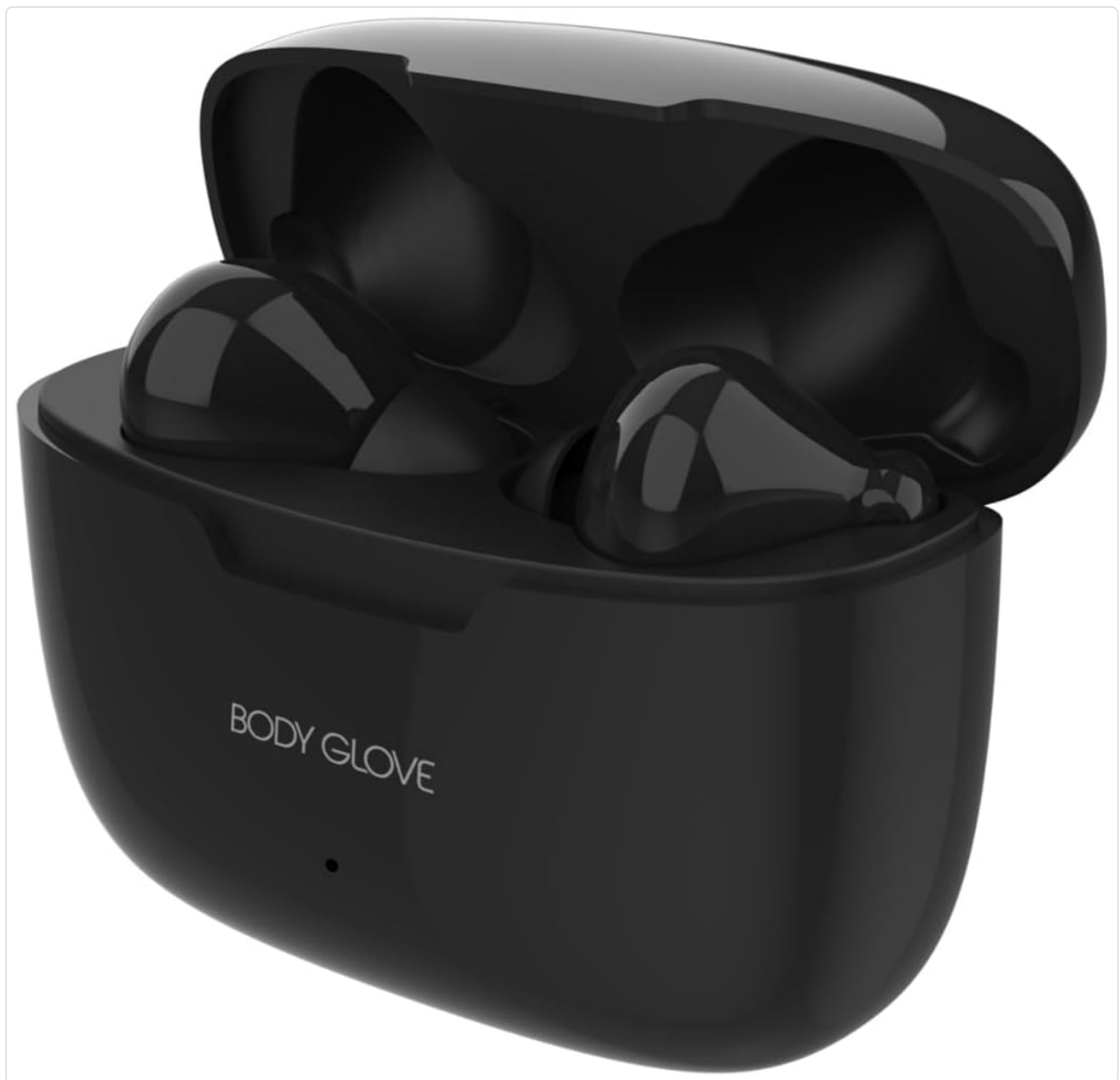
Figure 4.3: An angled view of the Body Glove Essentials Lux Earbuds in their charging case, showing the side profile of the earbuds and the hinge mechanism of the case lid.