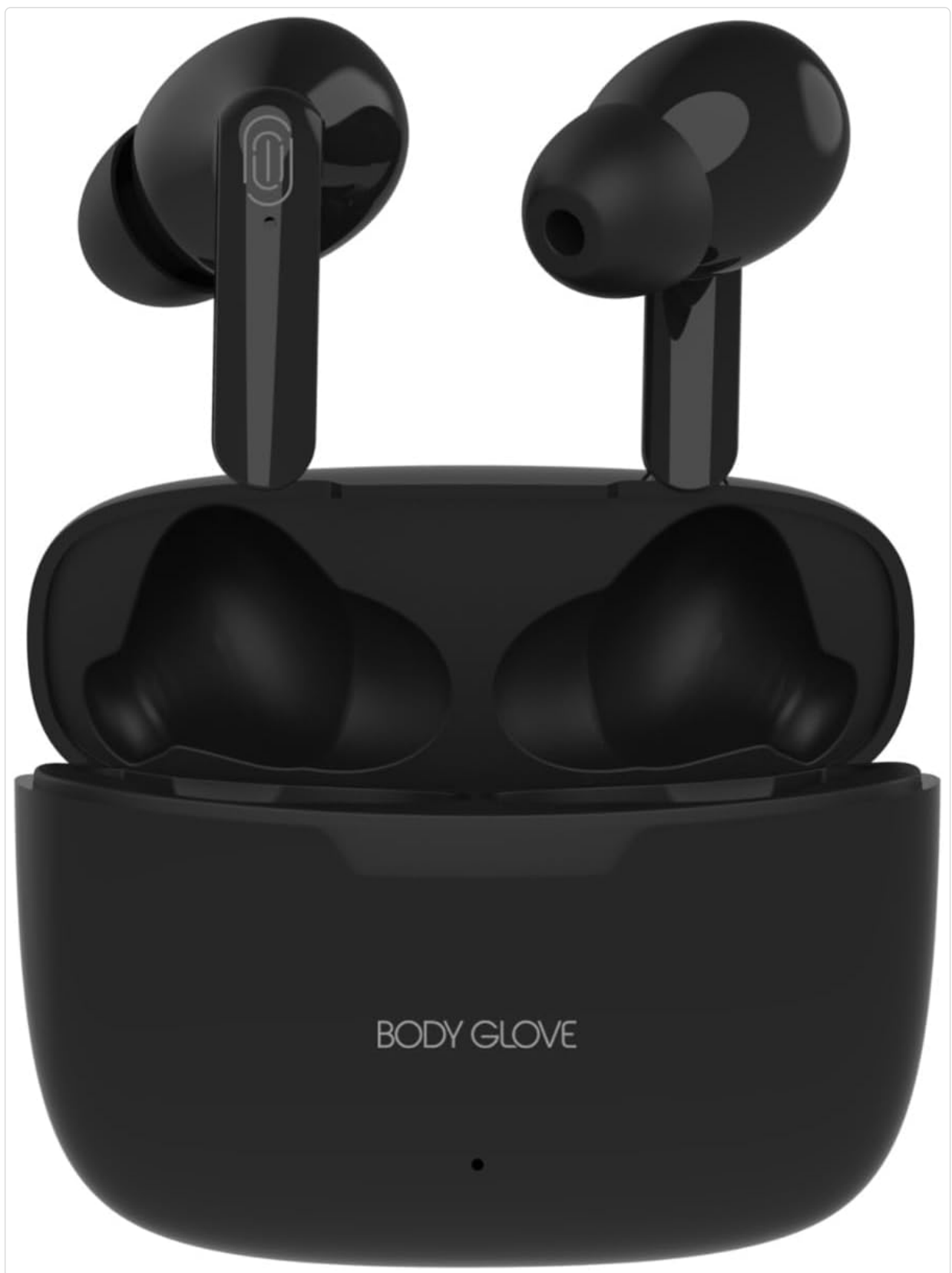
Figure 4.1: The Body Glove Essentials Lux True Wireless Stereo Earbuds resting in their open charging case. The earbuds are black with a sleek, ergonomic design, and the case features the 'BODY GLOVE' logo on the front.