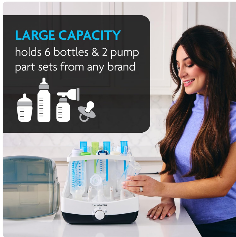
Figure 3: Large capacity accommodates various baby feeding items.

Place clean bottles, pump parts, pacifiers, and other accessories onto the racks. The large universal capacity can hold up to 6 bottles and 2 full pump part sets from any brand. Ensure items are placed upside down to allow steam and air to circulate effectively.