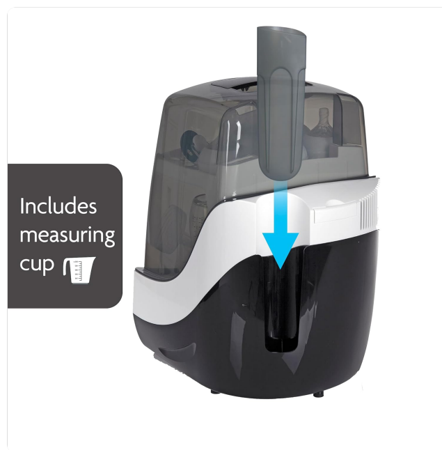
Figure 2: The included measuring cup for precise water filling.

Place the sterilizer dryer on a flat, stable, heat-resistant surface, away from direct sunlight and heat sources. Ensure there is adequate ventilation around the unit.