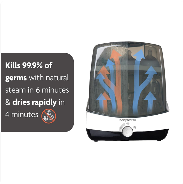
Figure 5: Natural steam kills germs, followed by rapid hot air drying.