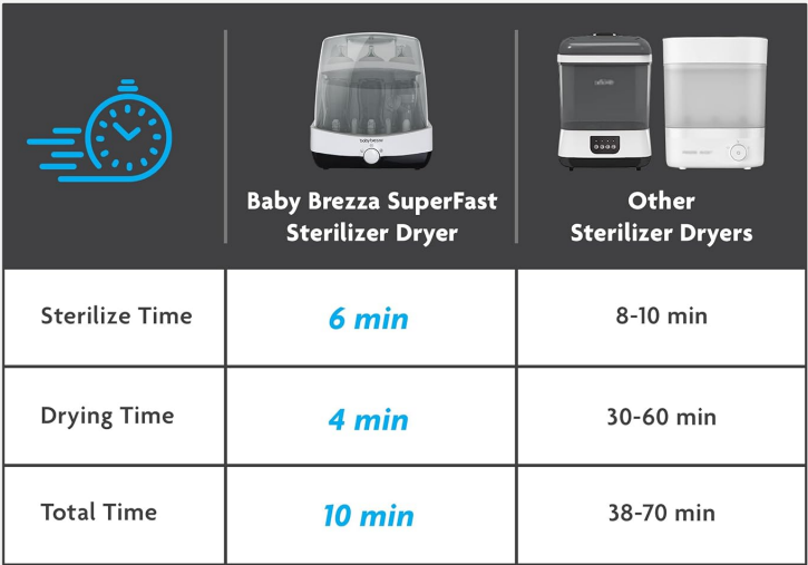
Figure 4: The Superfast Sterilizer Dryer completes cycles significantly faster.