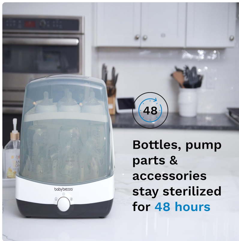
Figure 6: Items remain sterilized inside the unit for up to 48 hours.